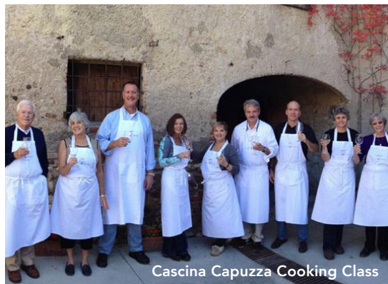
Cascina Capuzza Cooking Class