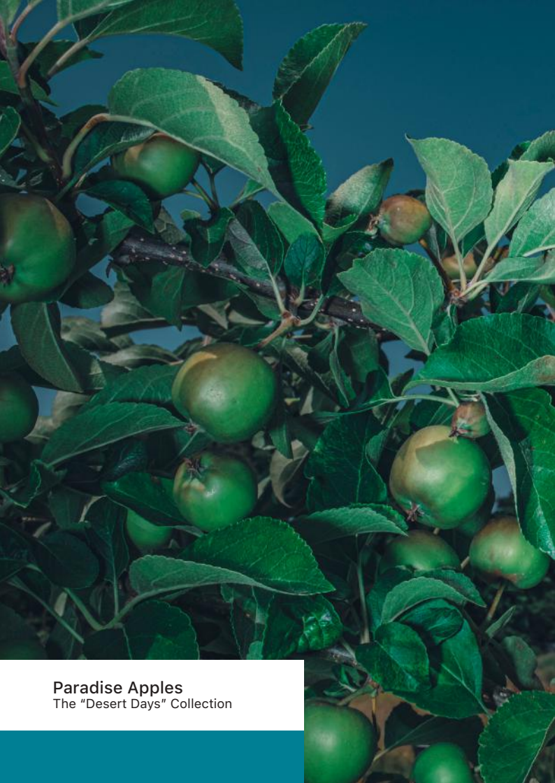
Paradise Apples The "Desert Days" Collection