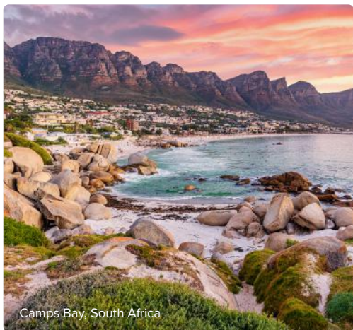
Camps Bay, South Africa

Experience the timeless allure of Africa , from thrilling game drives and wildlife in Kenya and Tanzania, to exploring South Africa's gorgeous Garden Route. After your inspiring safari, why not add a luxurious beach stay in Mombasa or Zanzibar.