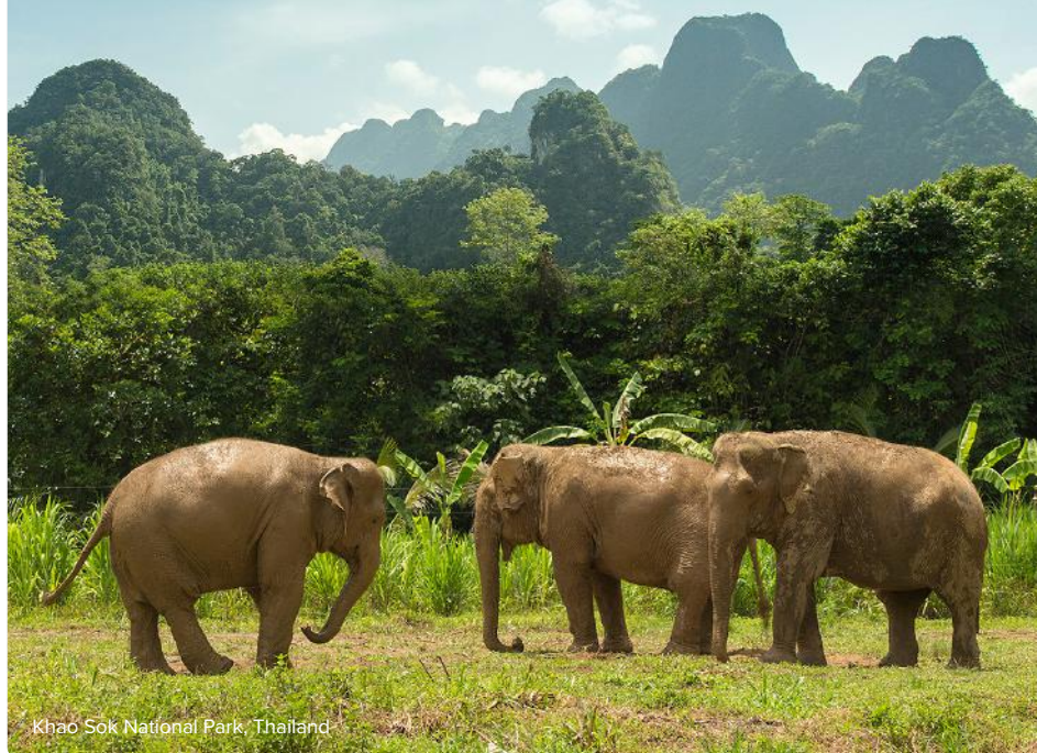
Khao Sok National Park, Thailand

A dynamic region where every sense awakens. Captivating culture, rich history, and wild adventure welcome curious travellers to these extraordinary lands.