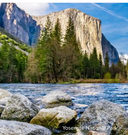
Yosemite National Park