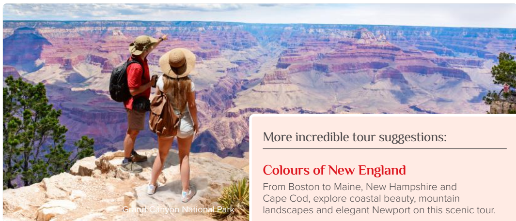
Grand Canyon National Park