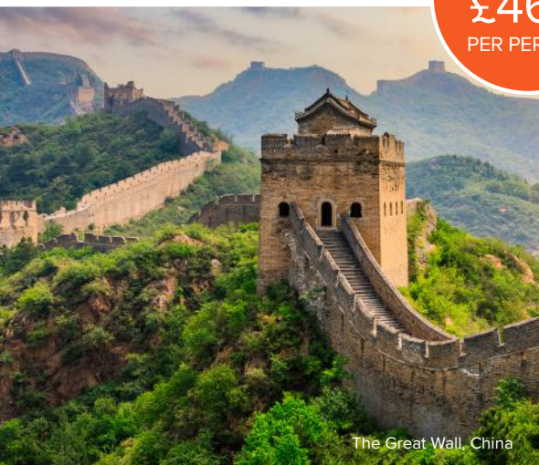
The Great Wall, China