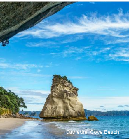
Cathedral Cove Beach