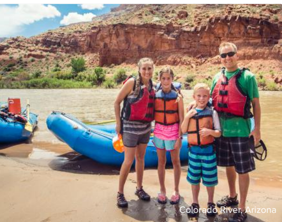
Colorado River, Arizona