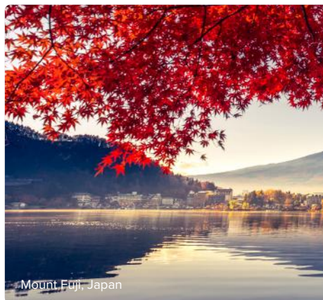
Mount Fuji, Japan

Exclusive Offer: Save up to £400pp. Book by 31 Jan