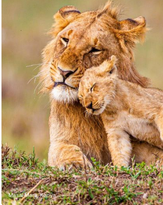
Masai Mara, Kenya

Experience the timeless allure of Africa , from thrilling game drives and wildlife in Kenya and Tanzania, to exploring South Africa's gorgeous Garden Route. After your inspiring safari, why not add a luxurious beach stay in Mombasa or Zanzibar.