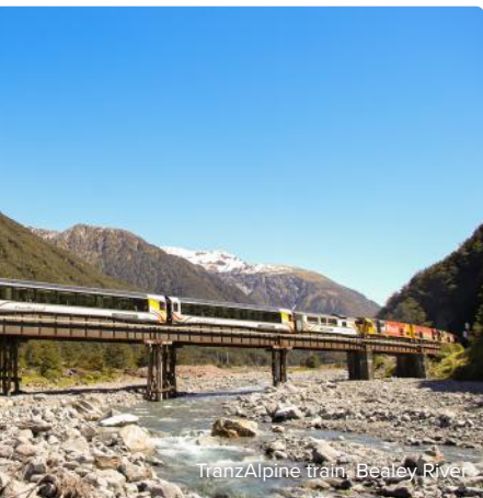
Trans-Alpine train, Bealey River