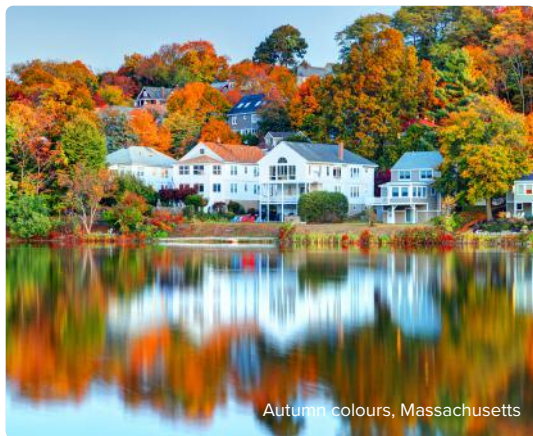
Autumn colours, Massachusetts