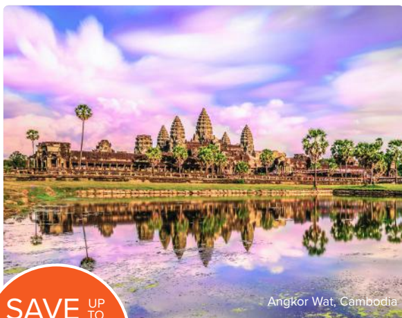
Angkor Wat, Cambodia