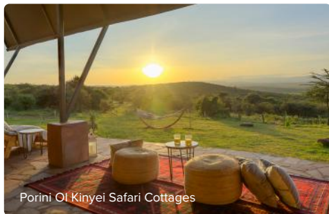
Porini Ol Kinyei Safari Cottages