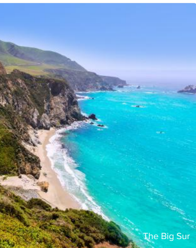
The Big Sur