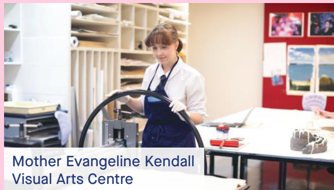
Mother Evangeline Kendall Visual Arts Centre