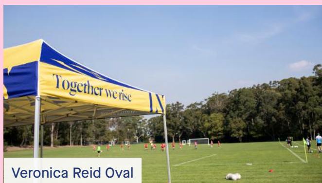
Veronica Reid Oval