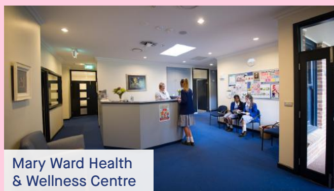
Mary Ward Health & Wellness Centre