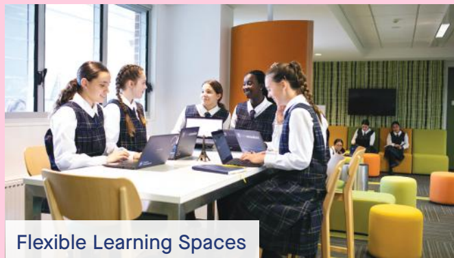
Flexible Learning Spaces