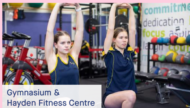
Gymnasium & Hayden Fitness Centre