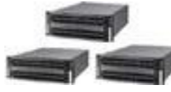
DS-A830XXS-ICVS Cluster storage 3.0