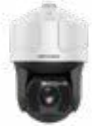
iDS-2VS435-F836-EY Illegal Parking Detection Speed Dome