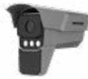
iDS-TCM403-EIR/0832 Radar-Assisted Smart Monitoring camera