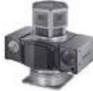
iDS-TCC446-C-L/B/DLYH Mobile Intelligent Panoramic Positioning System