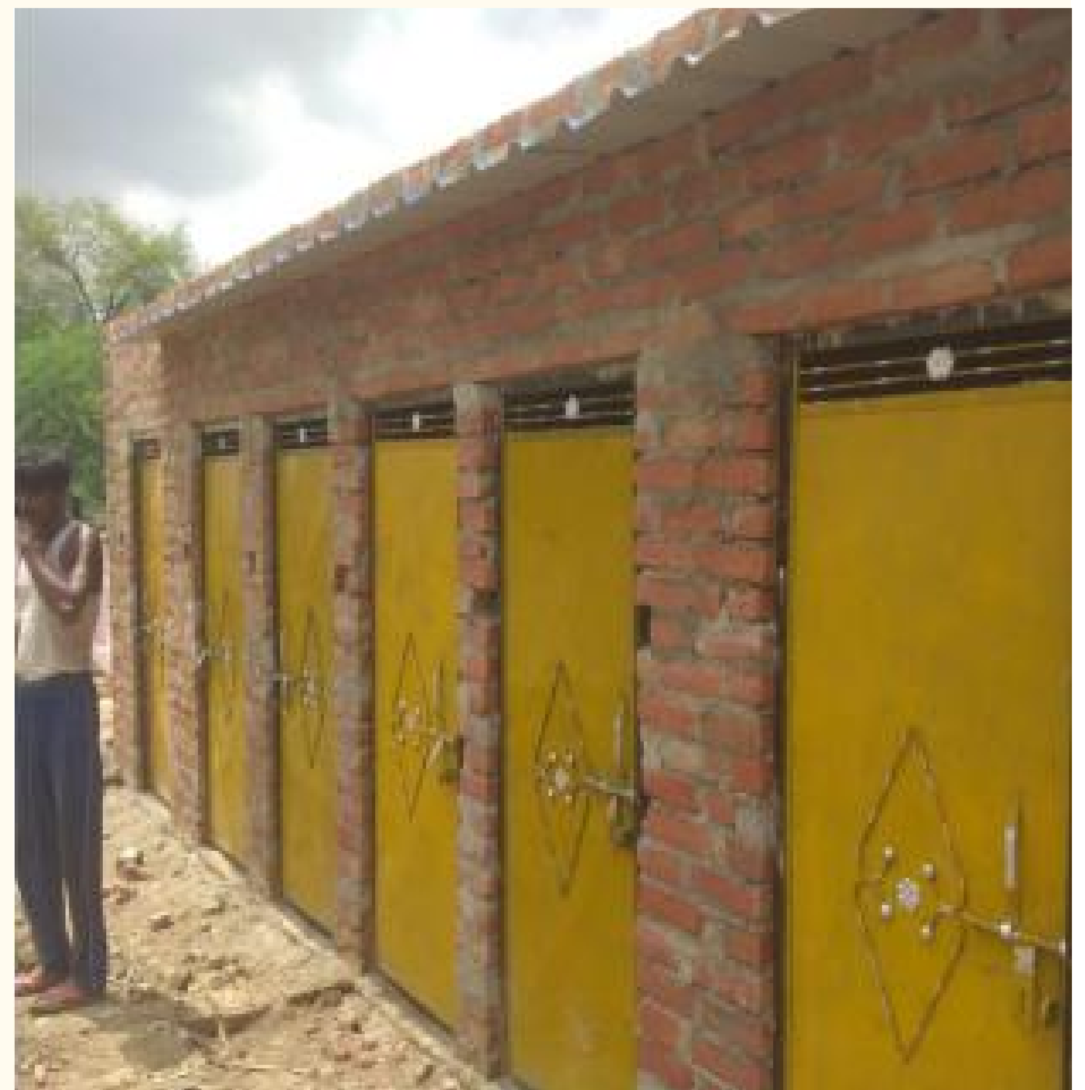
The 'SHE' Project -- Sanitation, Hygiene, and Empowerment -- focuses on building toilets in government and non-profit schools in India.

Sewa International has started constructing nearly 98 toilets in the Indian states of Andhra Pradesh, Delhi, Karnataka, Kerala, Maharashtra, and Uttar Pradesh under the Sanitation, Hygiene and Empowerment Project for the Girl Child (SHE) program as schools in India reopened in June after a long and intermittent gap due to the COVID-19 pandemic.