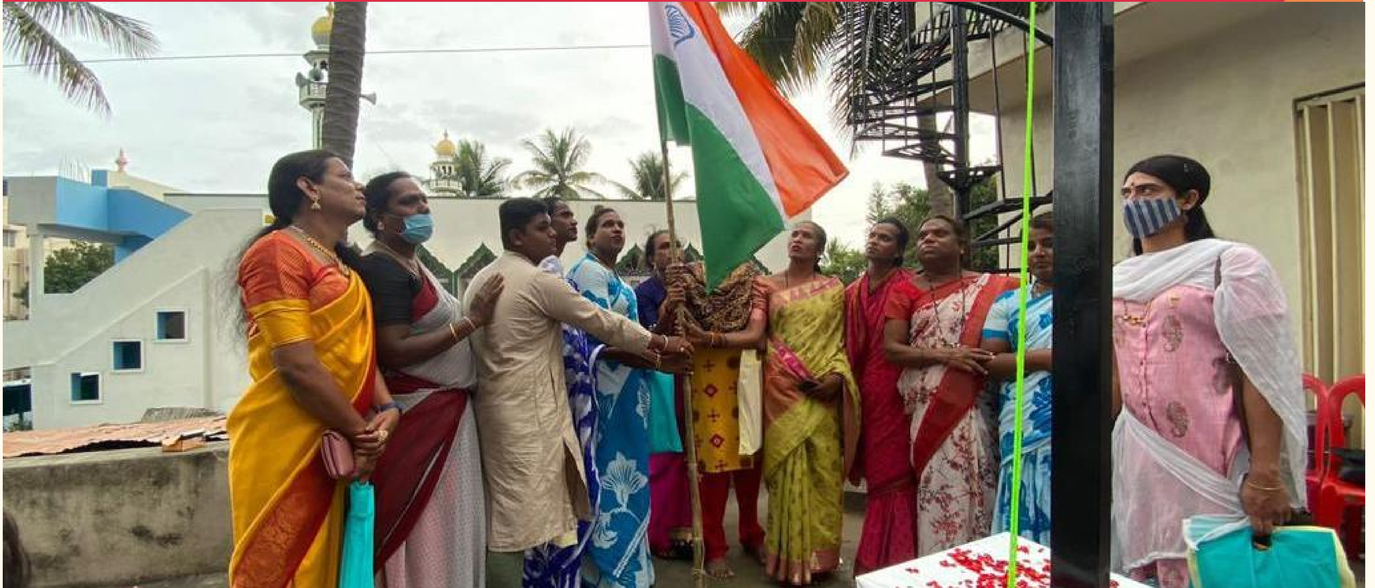
SHE-CAF celebrated the 75th Anniversary of Independence on August 15 with the transgender community at Karisandra in South Bengaluru

Sewa International launched a microenterprise training program to help transgender people set up small businesses. Sewa launched this program on August 15, in an event organized to celebrate India's 75th Independence Day with the transgender community in Bengaluru, India.