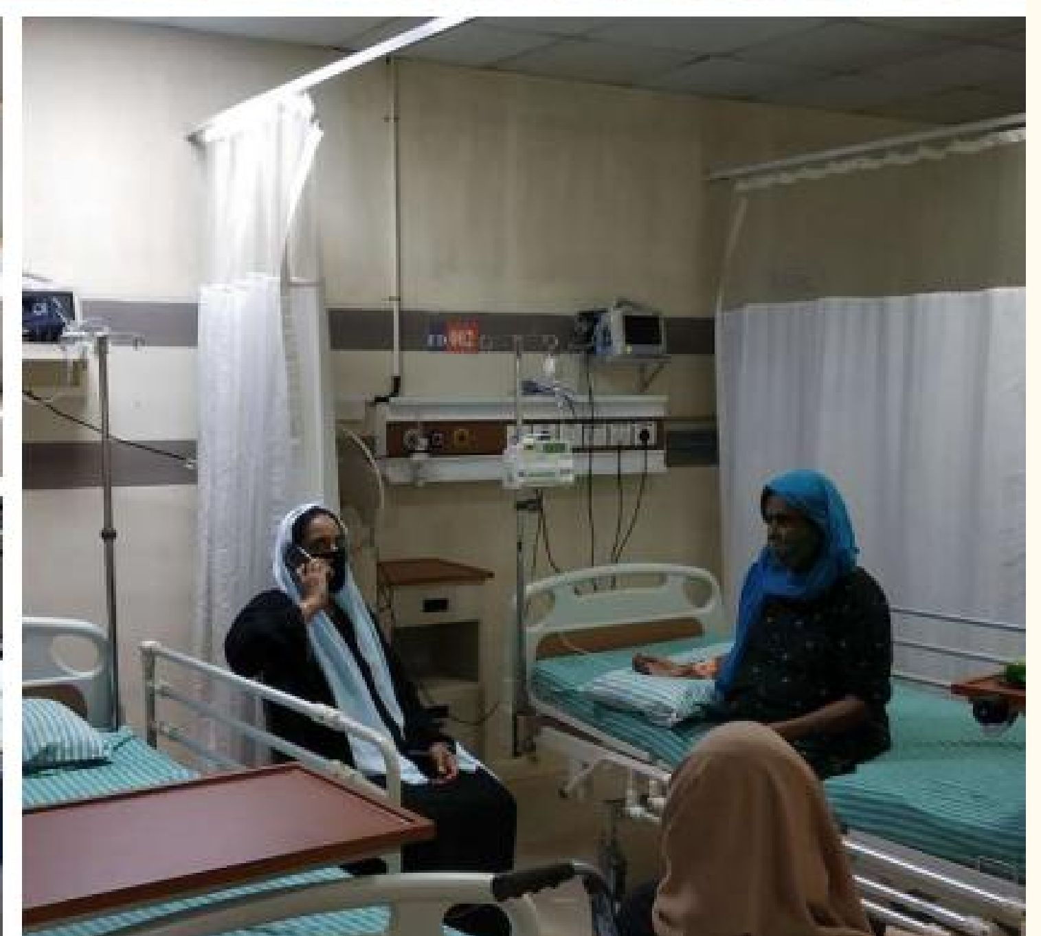
Oxygen generation plants have been installed across India to build resilience in the health care system of rural and tribal India