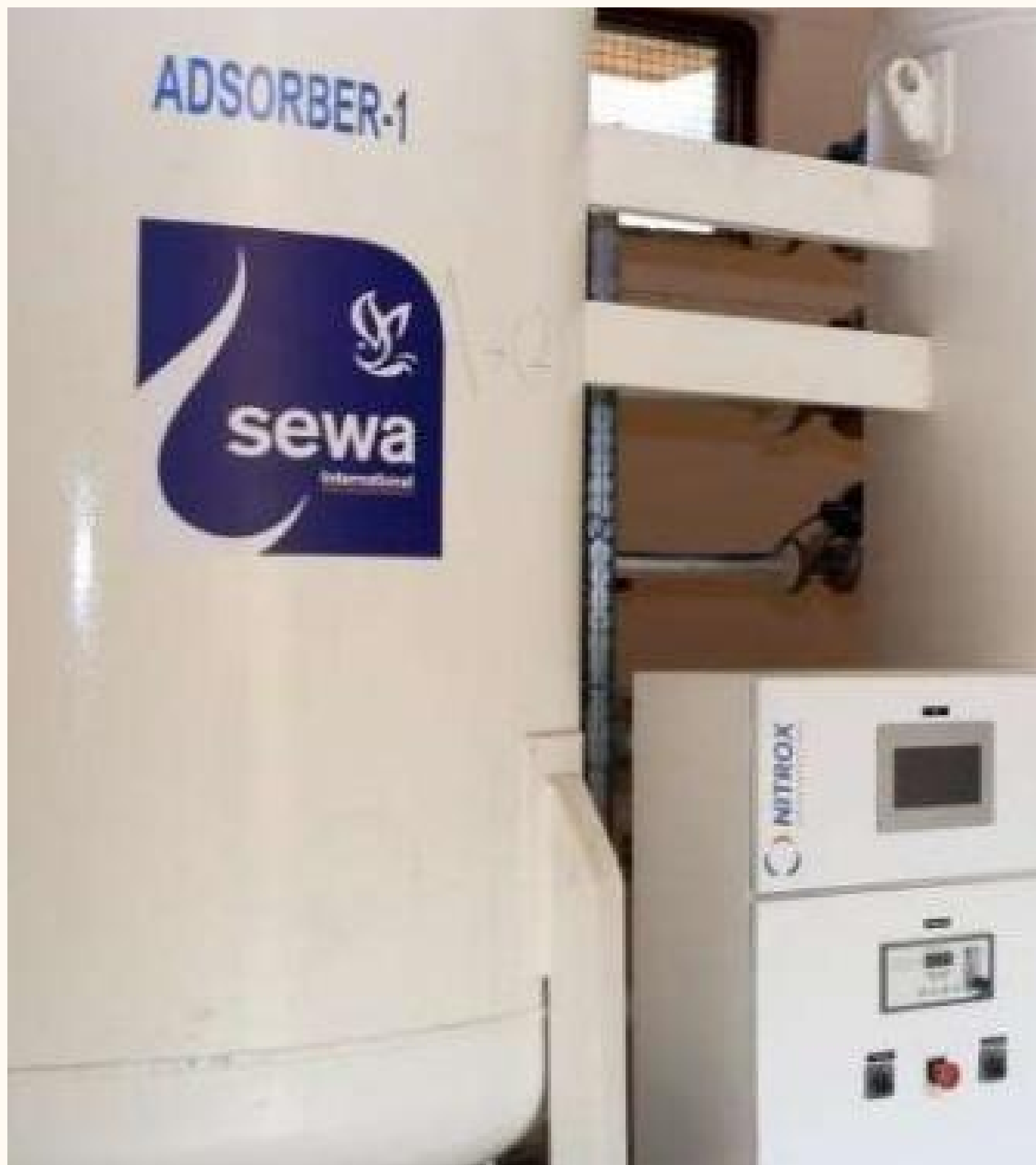
A picture of an Oxygen (O2) Generation Plant installed in a rural hospital by Sewa International in India

Sewa International, as part of its Oxygen Plant (O2) Initiative, installed 32 oxygen plants in India. Sewa launched this project to help India fight the COVID-19 pandemic after the COVID second wave hit the country in early 2021.