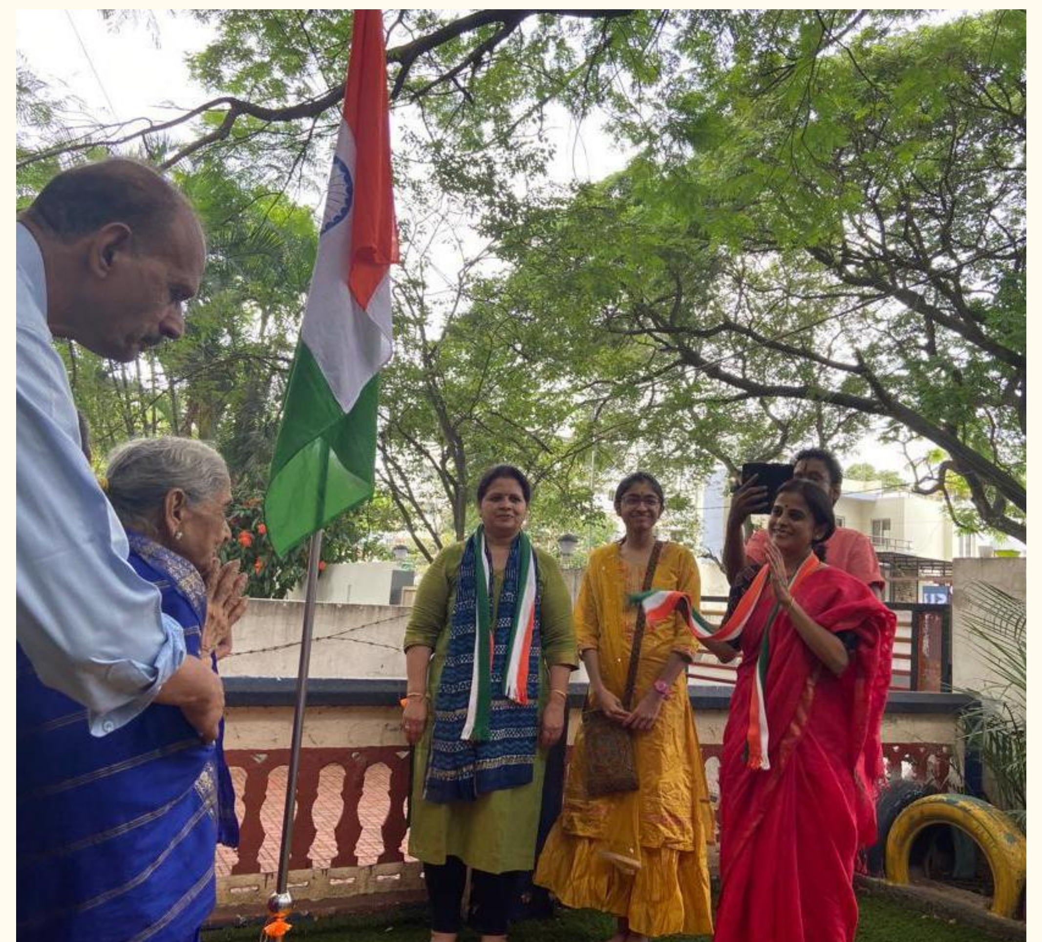
SHE-CAF celebrated the 75th Anniversary of Independence on August 15 with Senior Citizens in South Bengaluru

These much-needed identity cards help the community members establish a business and conduct other financial transactions.