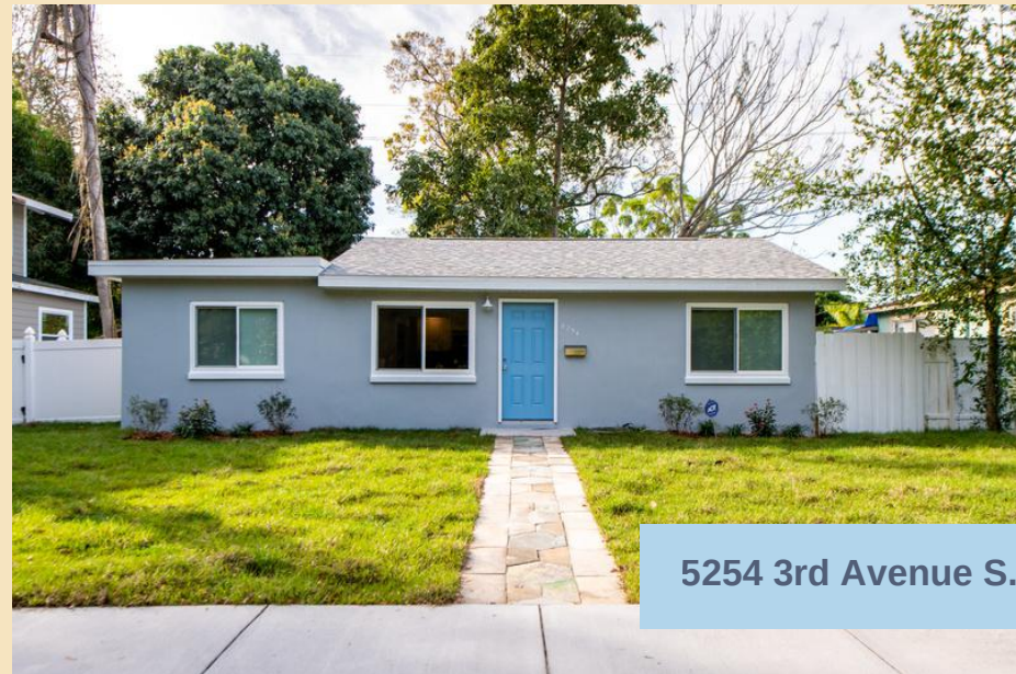
5254 3rd Avenue S.

Whether you are purchasing an investment property as a rental property, or to fix it up and sell it, you'll need an agent with market knowledge, knowledge of financing instruments, property valuation, cash flow & cap rates. Spitzer Rutland agents have the knowledge, gained from experience, and the connections to ensure that your process goes smoothly.