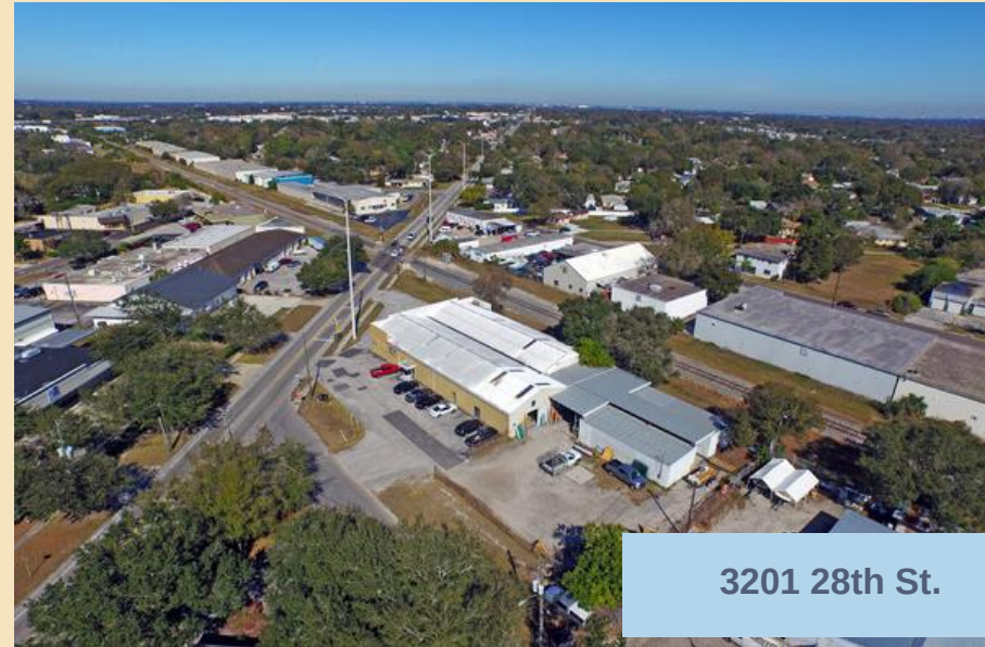
3201 28th St.

County & city planning, accessibility and environmental concerns are just a few of the considerations involved with the sale, purchase or lease of industrial properties. Spitzer Rutland agents have access to a wide network of resources to gather the information that our clients need to make well informed decision.