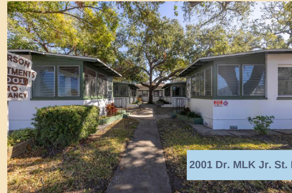
2001 Dr. MLK Jr. St. N.

When considering the purchase of multi-family properties, Spitzer Rutland agents will provide you with in-depth market analysis to help you identify and acquire properties which meet or exceed your investment goals.