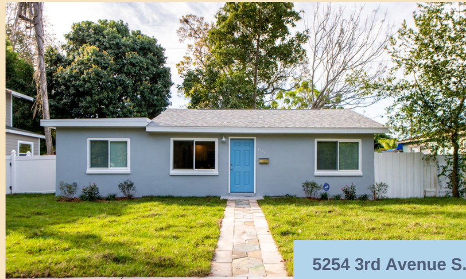
5254 3rd Avenue S.

Whether you are purchasing an investment property as a rental property, or to fix it up and sell it, you'll need an agent with market knowledge, knowledge of financing instruments, property valuation, cash flow & cap rates. Spitzer Rutland agents have the knowledge, gained from experience, and the connections to ensure that your process goes smoothly.