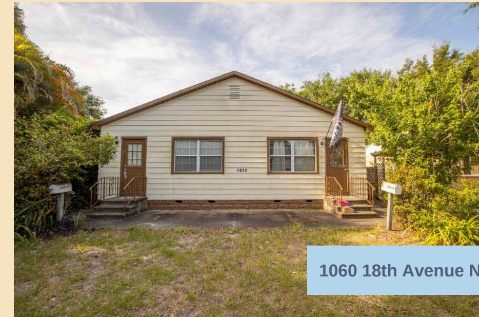
1060 18th Avenue N.

When considering the purchase of multi-family properties, Spitzer Rutland agents will provide you with in-depth market analysis to help you identify and acquire properties which meet or exceed your investment goals.