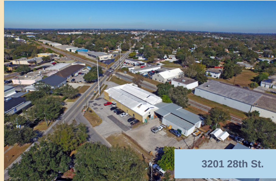
3201 28th St.

County & city planning, accessibility and environmental concerns are just a few of the considerations involved with the sale, purchase or lease of industrial properties. Spitzer Rutland agents have access to a wide network of resources to gather the information that our clients need to make well informed decision.