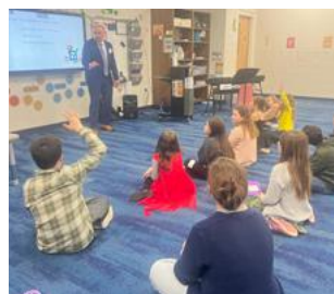
Students at Whitehouse Primary learned about a wide variety of jobs thanks to the many volunteers who spoke about their work at the school's annual Career Day.