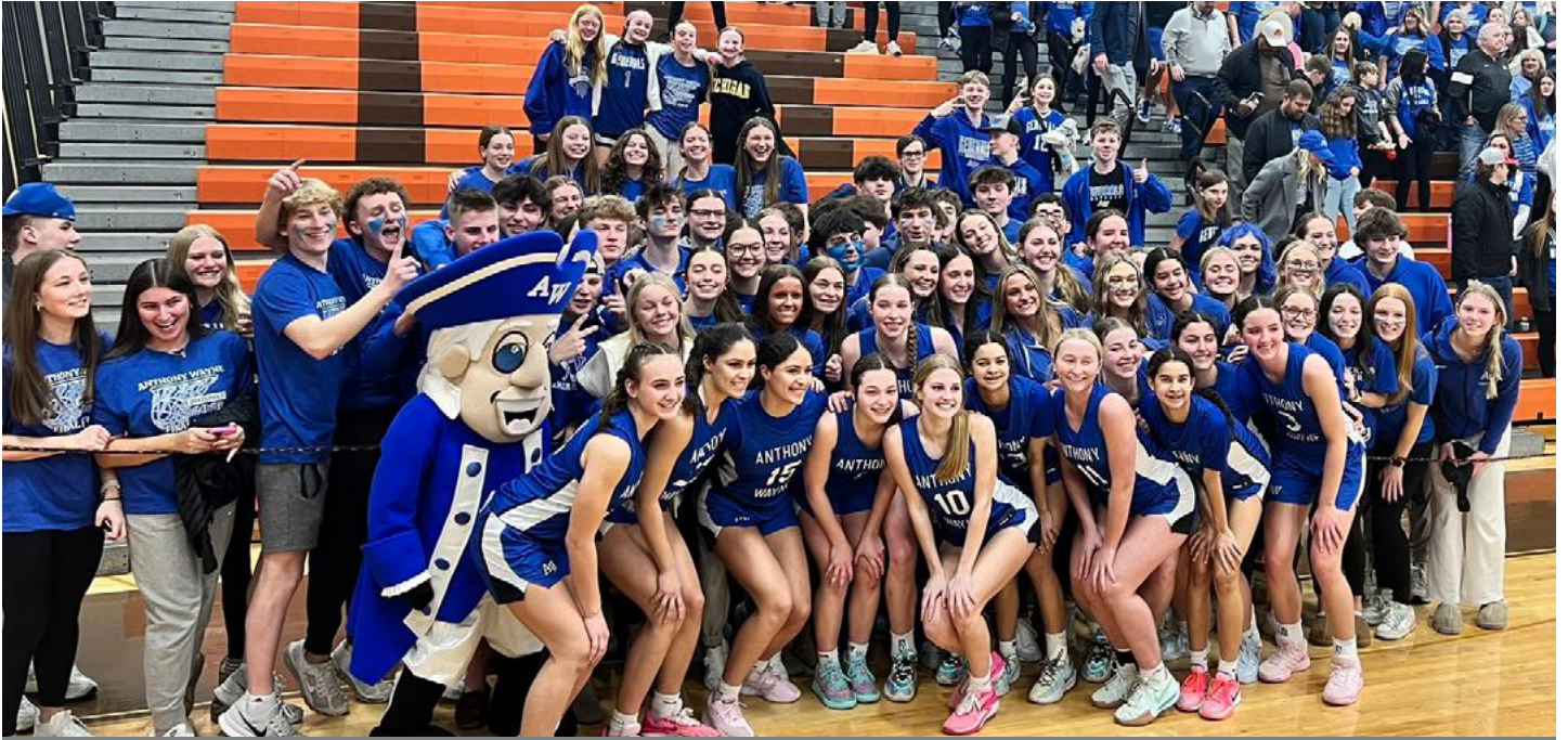
The AWHs girls basketball team made history by finishing the 2024-25 season as State Runners Up. It was the first time the program appeared in the state final match up. The team came up short of their state championship goal with a final score 77-55 against Winton Woods. [Hear from the players]