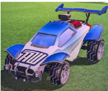
The AWHs Rocket League team ended its undefeated regular season and will move on to regionals at the Sandusky eSports Arena on April 6. [Purchase tickets.]