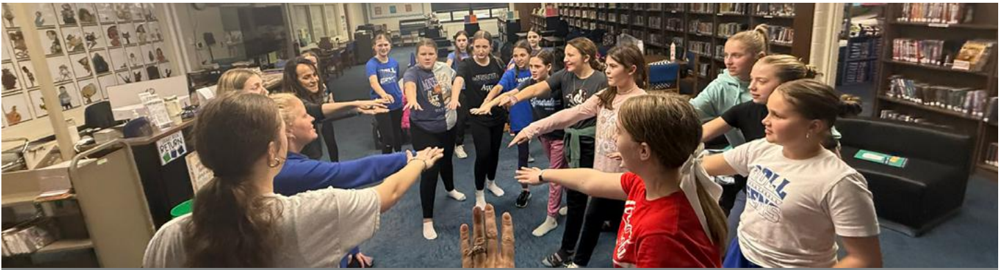
Heart and Sole practices have begun at Fallen Timbers Middle School. The after school running and personal development program for girls encourages goal setting, builds confidence, promotes positive relationships and physical fitness.