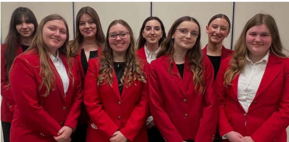
Representing the AWHs-Penta and AW Junior High chapters of FCCLA, students presented their projects to judges at the regional conference, returning with 12 gold awards, two silver awards and one bronze award. [Read more about their accomplishments.]