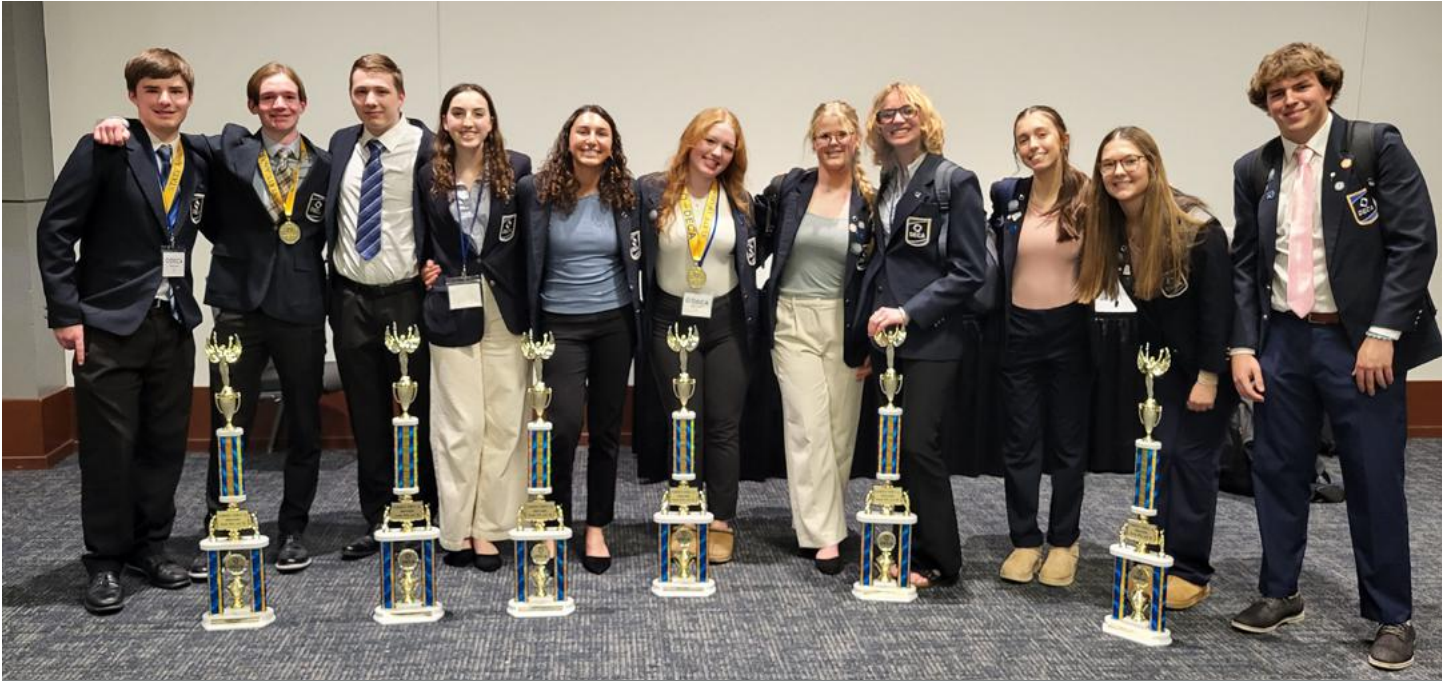
Fifteen members of the AWHs-Penta chapter of DECA will advance to the International Career Development Conference (ICDC) in Orlando, Florida this month, where they will compete among the best DECA students from around the world. [Meet the honorees and see more photos from the state conference.]