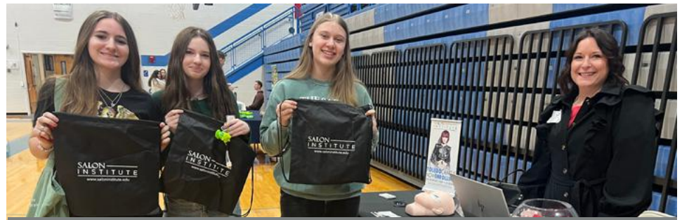
AWHS students met with dozens of local employers, recruiters and college representatives to learn about local opportunities at a career fair hosted by the Anthony Wayne Chamber of Commerce.