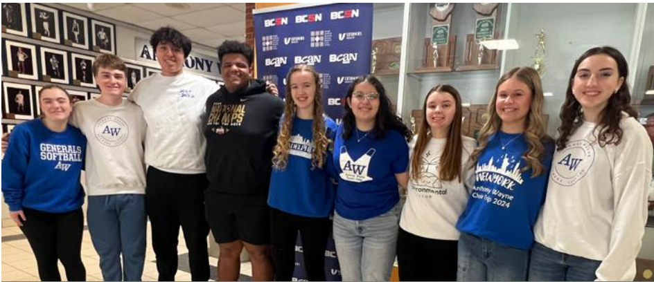
Several AWHs students shared their thoughts about the importance of remaining drug and alcohol free on prom night as a part of BCSN's Project Prom Contest. The winning school will receive $1,000 to enhance After Prom Activities.