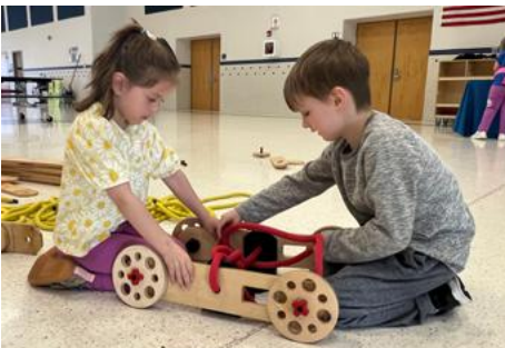
With thanks to MAPS, Monclova Primary students participated in STEM activities from Imagination Station.