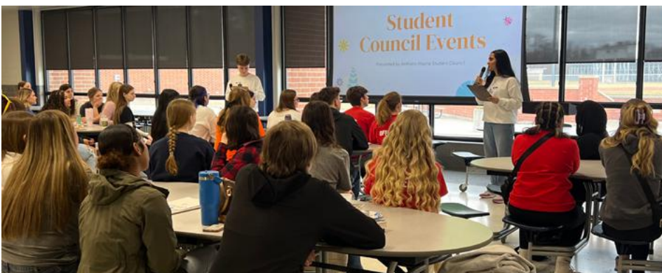
AWHS hosted students from Bowling Green, Otsego, Maumee, Springfield, Sylvania Northview and Whitmer Student Council Professional Development Day. Now in its fourth year, the event aims to improve student leadership through collaboration. [Learn more.]