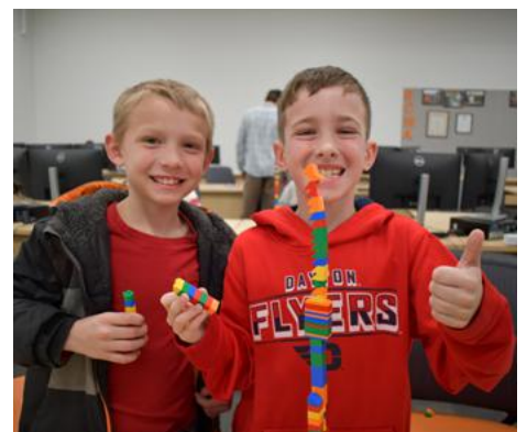
Whitehouse Primary School's third grade students enjoyed a morning of hands-on learning during STEM Day hosted by the BGSU Dept. of Construction Management. [See more photos.]