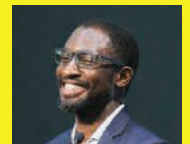
Uzodinma Iweala CEO of The Africa Center in New York