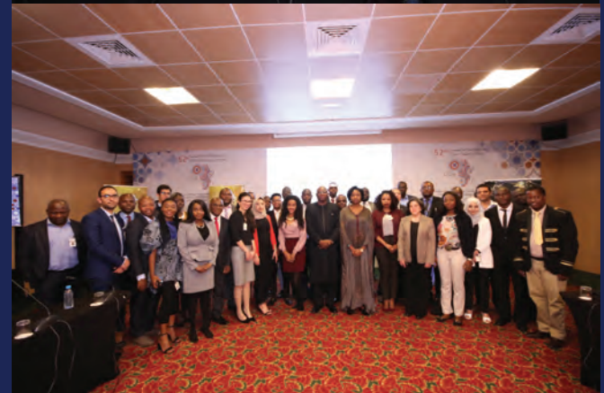
YALDA - UNECA Event attendees with Gambia Minister of Finance, H.E. Mambury Njie