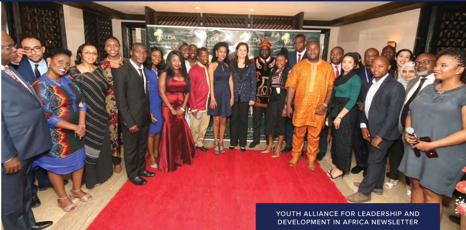
YALDA -UNECA Gala Dinner with H.E. Dr Hala El Said Minister of Planning, Egypt

QUARTERLY NEWSLETTER VOLUME 1 • ISSUE 1 MARCH 2019