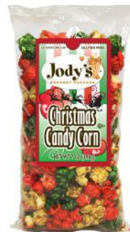
CHRISTMAS CORN 1076/32 5½" W x 9" H Net Wt. 7 oz. (198g)