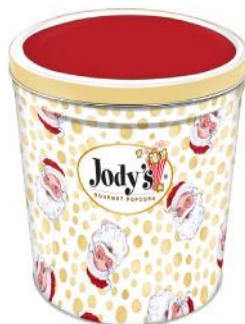
SANTA DOTS 3.5 GALLON TIN T3SantaDots (4 tins/case)