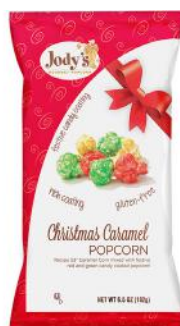
CHRISTMAS CORN CF100/32 5½" W x 9" H Net Wt. 6.5 oz. (182g)