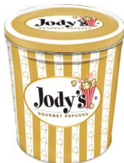
GOLD & WHITE STRIPES 3.5 GALLON TIN T3GoldWhite (4 tins/case)