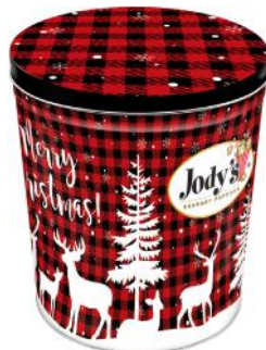
REINDEER PLAID 3.5 GALLON TIN T3Reindeer (4 tins/case)