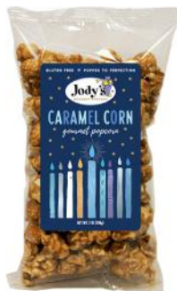
HANUKKAH CARAMEL 1076/53HAN 5½" W x 9" H Net Wt. 7 oz. (198g)

Ships September - December • 12 Bags/Jars Per Case