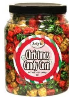
CHRISTMAS CORN RJR/32 5" Dia x 6¾" H Net Wt. 14 oz. (396g)