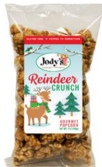
REINDEER CARAMEL 1076/53REINDEER 5½" W x 9" H Net Wt. 7 oz. (198g)