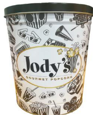
MOVIE THEME 3.5 GALLON TIN T3Movie (4 tins/case)