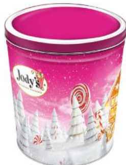
PINK GINGERBREAD 3.5 GALLON TIN T3PinkGingerbread (4 tins/case)