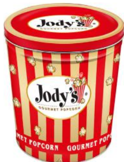
RED & GOLD STRIPES 3.5 GALLON TIN T3RedGold (4 tins/case)