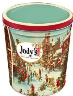
SANTA VILLAGE 3.5 GALLON TIN T3SantaVillage (4 tins/case)

9.5 oz. Caramel, 3.5 oz. Kettle Corn, 3.5 oz. Sea Salt & 3.5 oz. Double Cheddar Quantities are limited – order in advance!