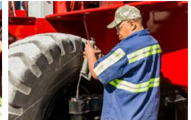
Easy Access for Steer Axle Maintenance