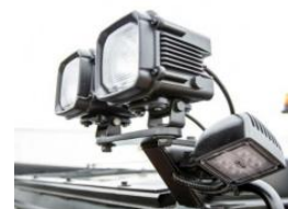
12 LED Work /Step Lights (Standard)