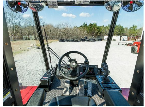
Climate Controlled 2-door Cab - All Steel - Heat, A/C & Defrost (Standard)