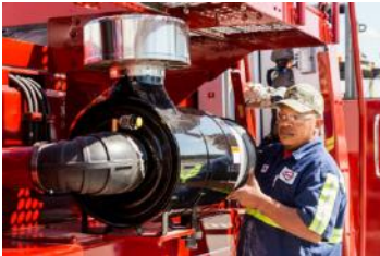
Donaldson Air Cleaner with Safety Element (Standard)