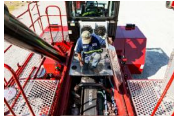
Lightweight Deck Lids allow Easy Access for Service and Inspection Service & Inspection from