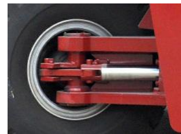
Industry's Toughest Steer Axle (Standard)