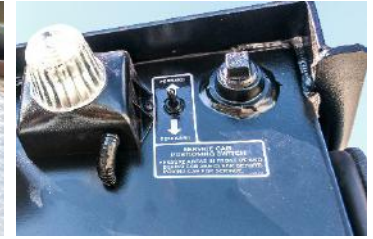
Service Cab Positioning Switch allows the Cab to be Traversed with Machine Powered Down