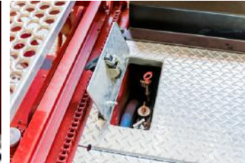
Daily Checks are Easily Accessed from the Operator Platform without Deck Lid Removal