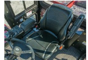
Fully Adjustable Air Ride Seat (Standard)