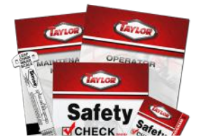
Vehicle Information Package (Standard)