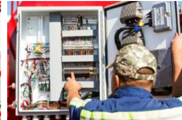
Easy Access to Heavy Duty Circuit Breaker Panel and Breaker Reset Switches