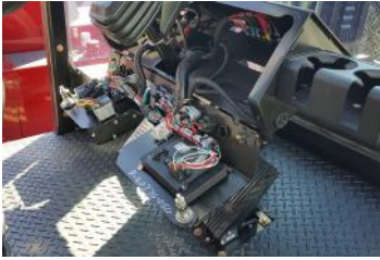
Flip-down Dash with Color/Number Coded Wiring (Standard)

Taylor Reachstackers are designed with ease of maintenance and serviceability as a key priority. With today's engine and emissions requirements, daily maintenance checks and timely periodic service are the key to your equipment's longevity. All daily checks on the XRS-9972 can be accessed from either the ground or operator platform, ensuring that operators can complete these requirements with ease. Also, the side service doors and removable deck panels open to expose the drivetrain and hydraulics to provide easy access for service and inspection.