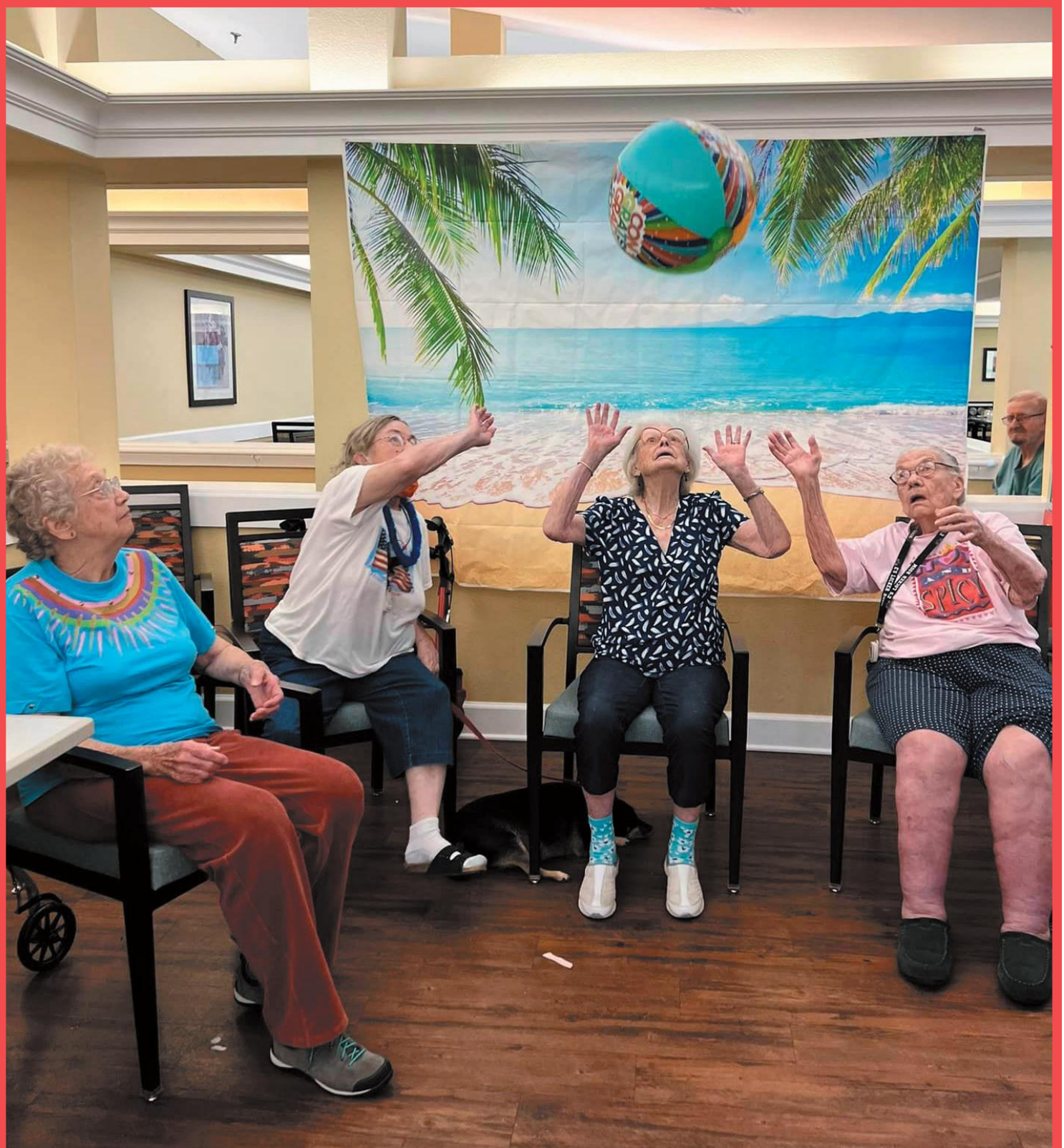
A little beach volleyball on a warm summer day at Lassen House .