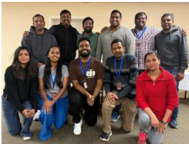
National Team of JY New Zealand (2024 - current)