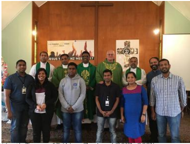
Youth Team of JY New Zealand (2017 - 2021)