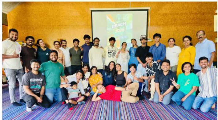
Reach 2026 at Highland Home Christian Camp, Palmerston North