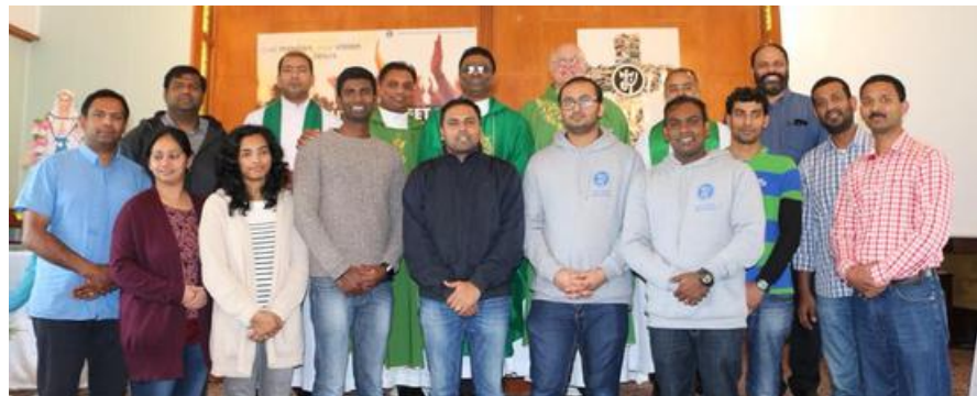
National Team of Jesus Youth New Zealand elected in 2017

As we celebrate 20 years, may we continue to keep formation and mission at the heart of all we do. The journey ahead is bright, and I am confident that the same grace that has led us thus far will continue to guide Jesus Youth NZ into the future.