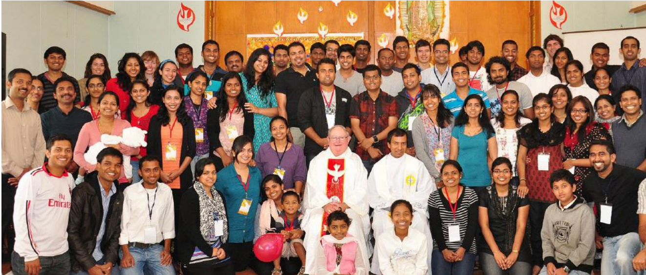
Exult 2012 at Narrows Park, Hamilton