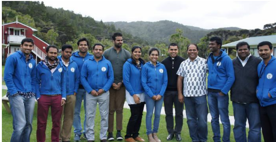
National Team of Jesus Youth New Zealand elected in 2014

During those years, we witnessed the emergence of initiatives like 3sixTEENS and Hours of Mercy, humble efforts that became powerful encounters of faith for many. Alongside these blessings, there were also challenges, moments that called for sacrifice, understanding, and unity amidst diversity. In hindsight, these experiences were gifts in unexpected forms, shaping us into more compassionate and servant-hearted leaders.