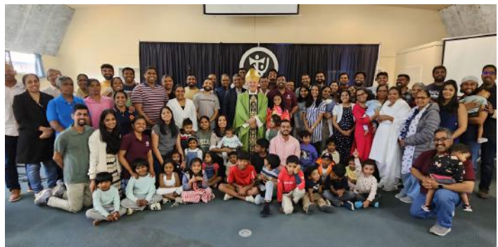
Leaders Training 2025 at Blue Skies Centre, Christchurch