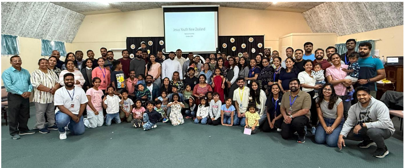
National Assembly 2024 at Blue Skies Centre, Christchurch

That is why the words of Jesus in John 20:21–22 feel so alive today: "As the Father has sent me, so I am sending you...Receive the Holy Spirit." This Jubilee is not only a celebration—it is a commissioning. Jesus reminds us of who we are: not just a missionary movement collectively, but individuals personally called to reach out with love and courage. This call is not limited to leaders or national and regional team members, it is for each one of us. He invites each of us to listen again to His words: I am sending you. Each one of us is chosen and sent.