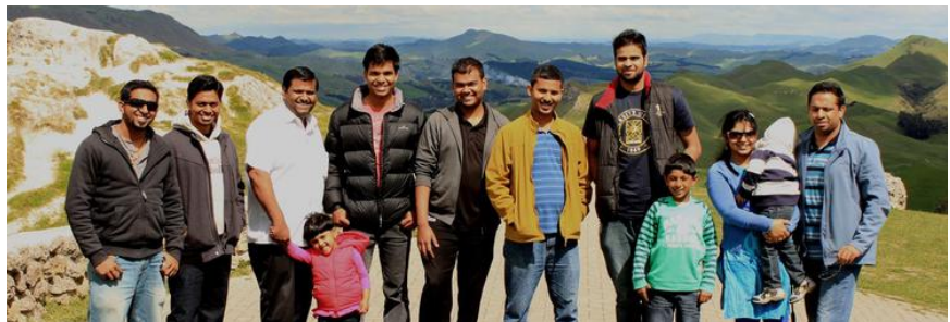
National Team of Jesus Youth New Zealand elected in 2011

Ultimately, this was never our work. It was God who led, sustained, and brought the growth. We were simply invited to be part of His plan. May He continue to fulfil His great purpose for the salvation of the people of New Zealand, as we continue to play our part in His master plan.