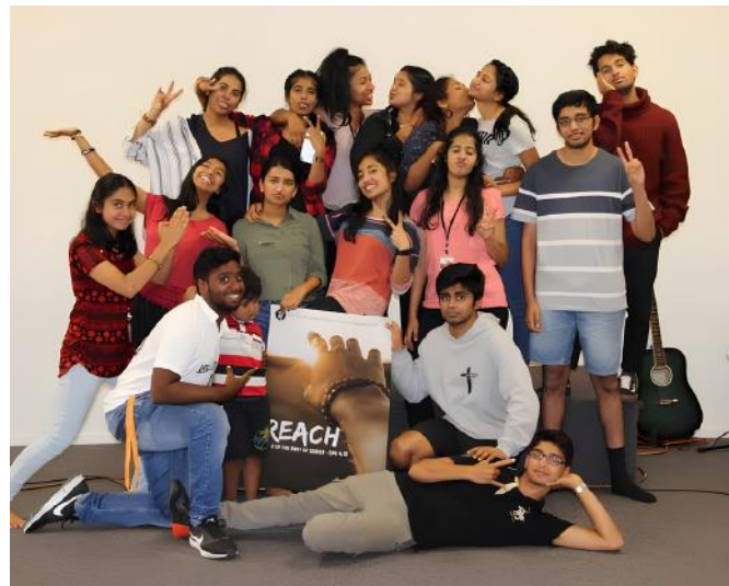
Participants of Reach 2019 at Sunshine Ranch, Auckland