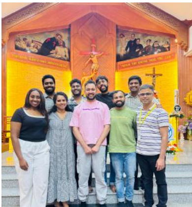
With the JY Australia delegation at the 2025 International Leaders Learning Program

As we mark twenty years of the Jesus Youth movement in New Zealand, our hearts naturally turn to gratitude. Looking back, we begin to recognise more clearly what the Lord has been doing - often quietly, and in ways we could not have planned or anticipated.