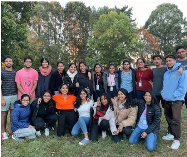
Participants of Reach 2021 at Blue Skies Centre, Christchurch

This is how the Lord often works—quietly, steadily, and more deeply than we first realise. What began as a simple desire to reach teenagers has become part of the formation of a generation. And the story is still unfolding.