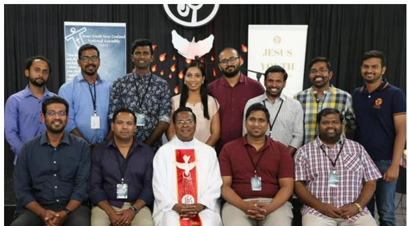
National Team of Jesus Youth New Zealand elected in 2021

With confidence, I hold on to this promise: the God who has brought us to this grace of 20 years will continue to lead us in the days ahead.