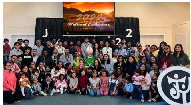
National Conference 2022 at Blue Skies Centre, Christchurch