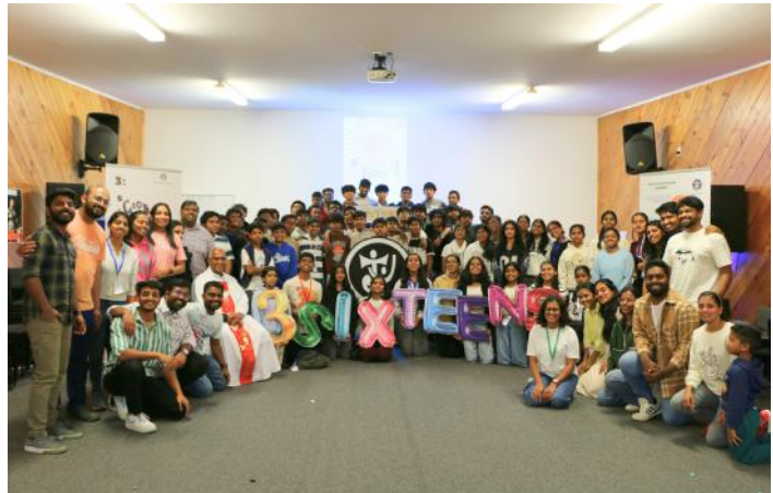
3sixTEENS 2025 at Sonshine Ranch, Auckland

Let this Jubilee be more than a celebration; let it be a turning point. A time when we, as Jesus Youth in New Zealand, recommit ourselves wholeheartedly to mission. Not in distant or abstract ways, but in the simplest and most real way: by sharing our lives. If each of us takes that step, the impact will be far beyond what we can imagine. The movement will grow. The Church will grow and most importantly, more people will come to know the love of Jesus.