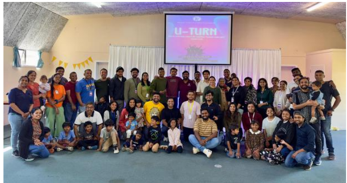
U-Turn 2025 at Blue Skies Centre, Christchurch

As we celebrate, may we also hear that gentle yet powerful call once more: GO, SHARE, TELL YOUR STORY!