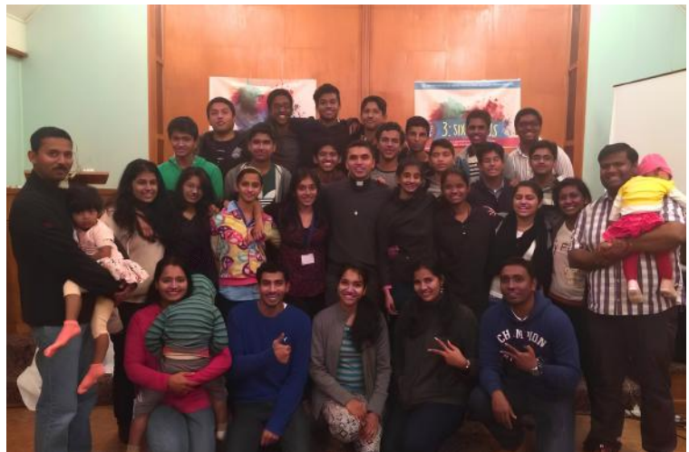
Participants of 3:sixTEENS 2015 at Narrows Park, Hamilton

In later years, that fruit began to emerge more clearly. Last year, 50 teenagers attended 3:sixTEENS. This year, 60 young people gathered. Those numbers are meaningful not merely because they are larger, but because it shows a growing hunger among young people for something deeper than what the world ordinarily offers.