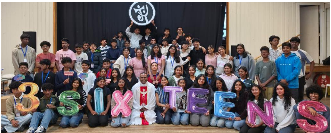
Participants of 3:sixTEENS 2026 at Narrows Park, Hamilton