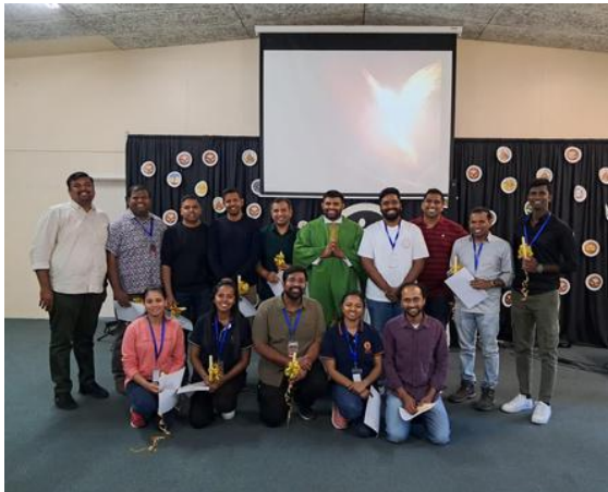
National Team of Jesus Youth New Zealand elected in 2024