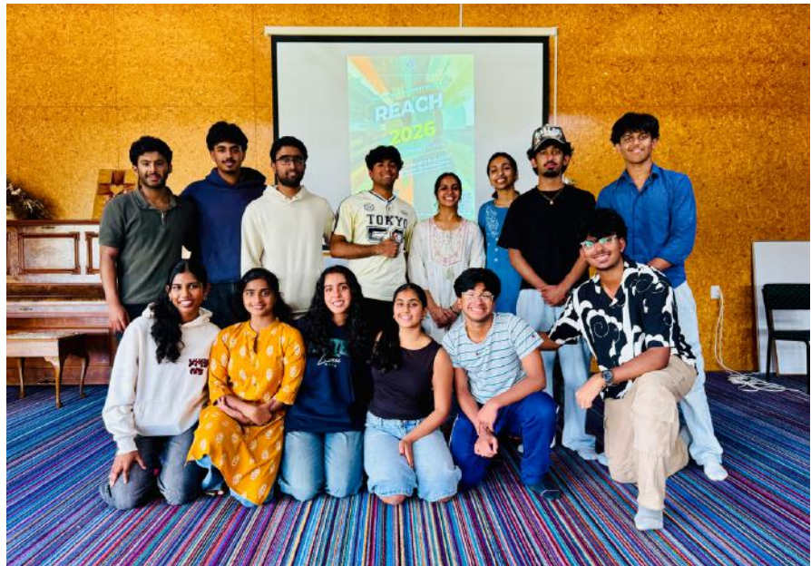
Participants of Reach 2026 at Highland Home Christian Camp, Palmerston North

As young people move into university, work, and adult life, the questions become deeper and more demanding. Reach creates space to reflect on identity, vocation, mission, and what it means to follow Christ with intention in everyday life.