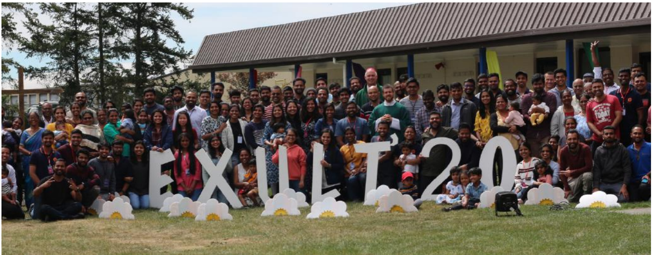
Exult 2020 at Blue Skies Centre, Christchurch

As we turn these pages, may gratitude fill our hearts. May hope rise again within us. May the same Lord who led us this far continue to guide Jesus Youth New Zealand into the years ahead.