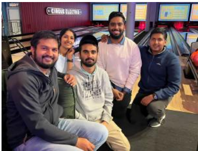
Youth Team of JY New Zealand (2021 - 2024)