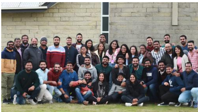
Exult 2023 at Narrows Park, Hamilton