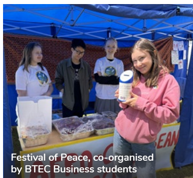
Festival of Peace, co-organised by BTEC Business students