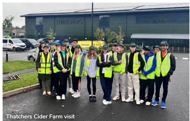
Thatchers Cider Farm visit