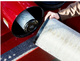
Donaldson Air Cleaner with Safety Element (Standard)