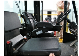
Fully Adjustable Air Ride Seat (Available Trainer Seat)