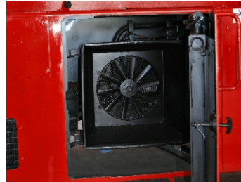
Remote Mounted Swing-out Cooler Service & Inspections from Ground and Running Board