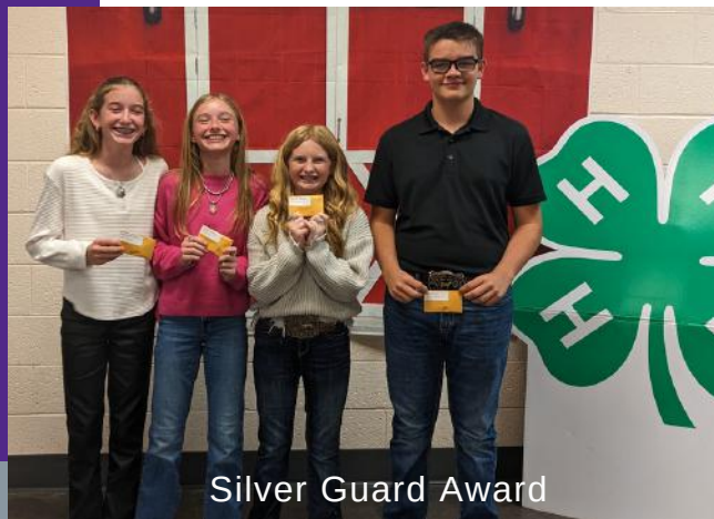
Silver Guard Award