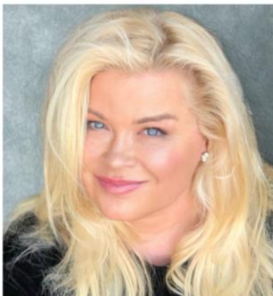
SHERI SALATA CO-FOUNDER OF THE PROSPER NETWORK, BEST-SELLING AUTHOR, + FORMER EXECUTIVE PRODUCER OF THE OPRAH WINFREY SHOW

"We get to be cooperative components in one another's dreams. Watch, then, what starts happening for you."