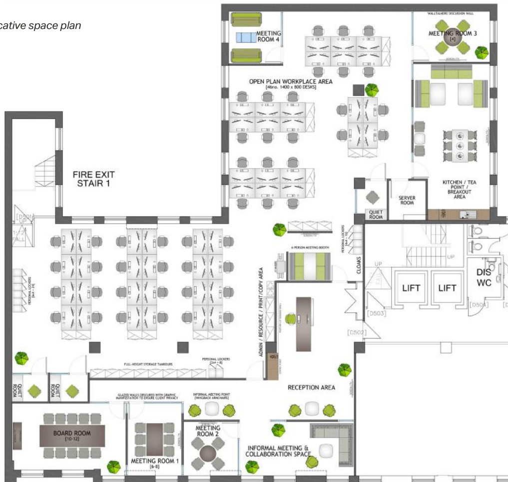
*indicative space plan