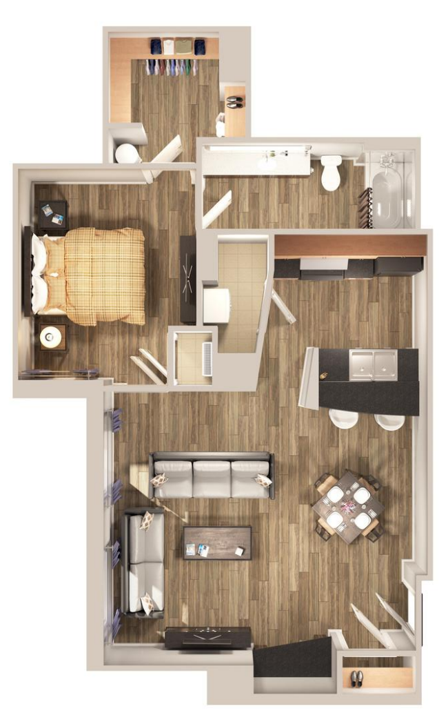
St. Nichoas 1 Bed/1 Bath 829 Sq. Ft.