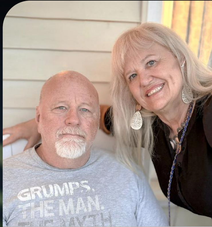
Why I work. Why I take off.

Don't listen to the naysayers that tell you not to door knock, make cold/warm calls, visit Realtor offices, etc. It may be "old school" but it still works! You have to find what works for you!