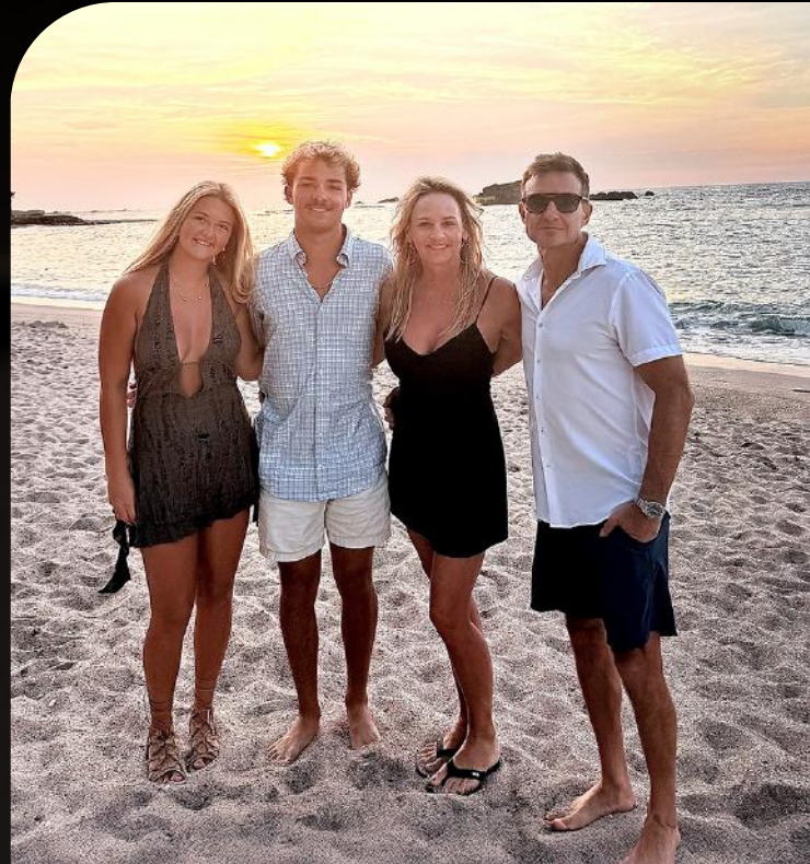
Family Pic Love 2025

Somewhere that blends mountains and the ocean.