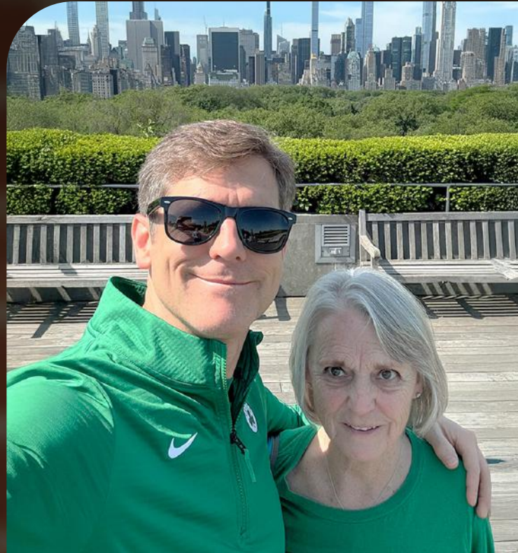
My mom and me in NYC for Mother's Day

I have a strong base of love and support from family and friends, and I enjoy life!