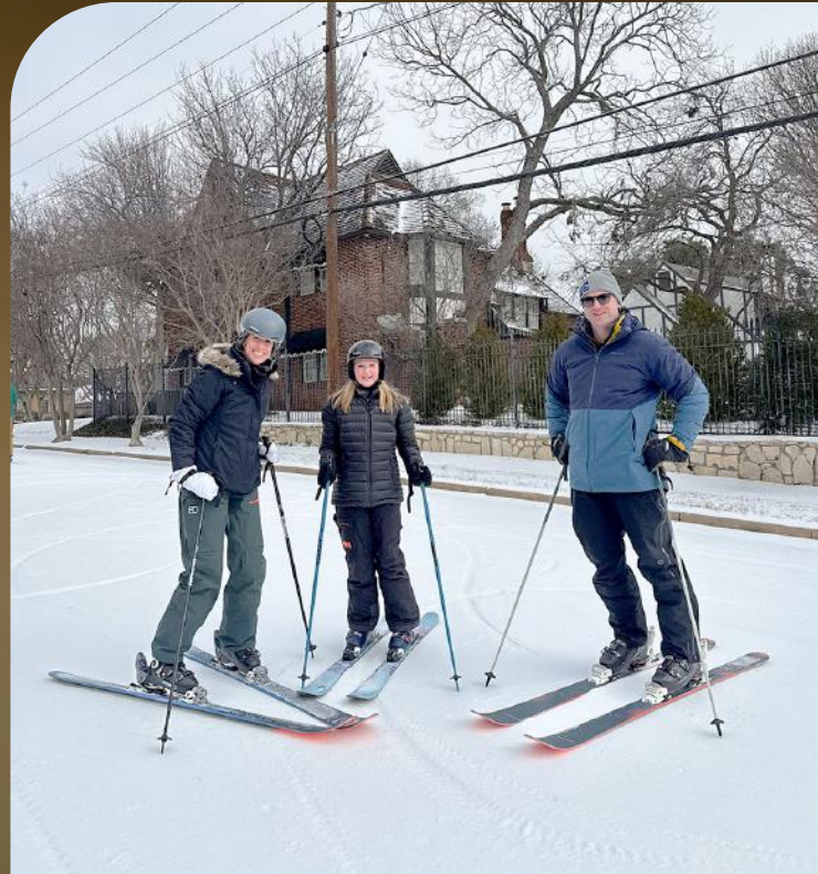
Just skiing the streets that one time it snowed in Dallas

Swinging a golf club, because I'm terrible and my ego can't handle it.