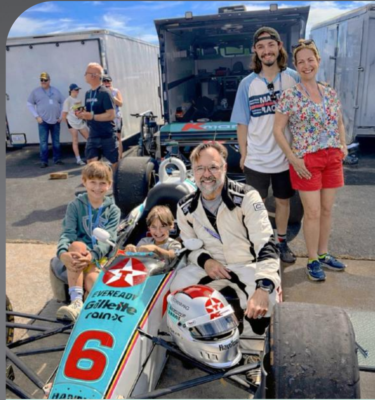
Racing Vintage Indy with our family!

Between SWBC and Landman, I have fallen in love with Texas. My accent is part Southern, part Texas and part "Please repeat that." Especially when I refer to something as simple as a ceiling "light." Voice to text will require another level of A.I. to translate, but I still love Texas.