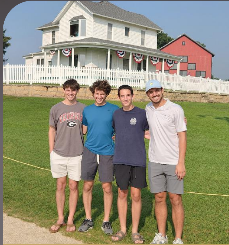
Field of Dreams

The beach. White sand, clear water, and an umbrella. In the immortal words of Zac Brown: "I got my toes in the water, toes in the sand. Not a worry in the world, a cold beer in my hand. Life is good today!"