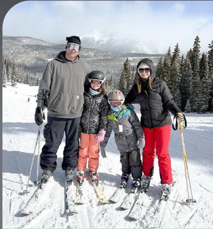
Skiing with the family in Colorado 2025

Put at least 40 hours of quality work in per week. Jobs with autonomy are great if you are a disciplined individual.