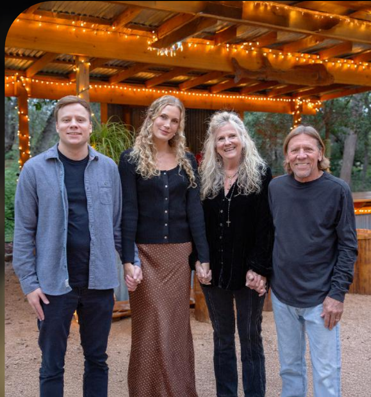
Christmas 2025 with my favorites

Film Photography. I have always loved photography, capturing places, people, interiors, etc. Film is such a beautiful art.