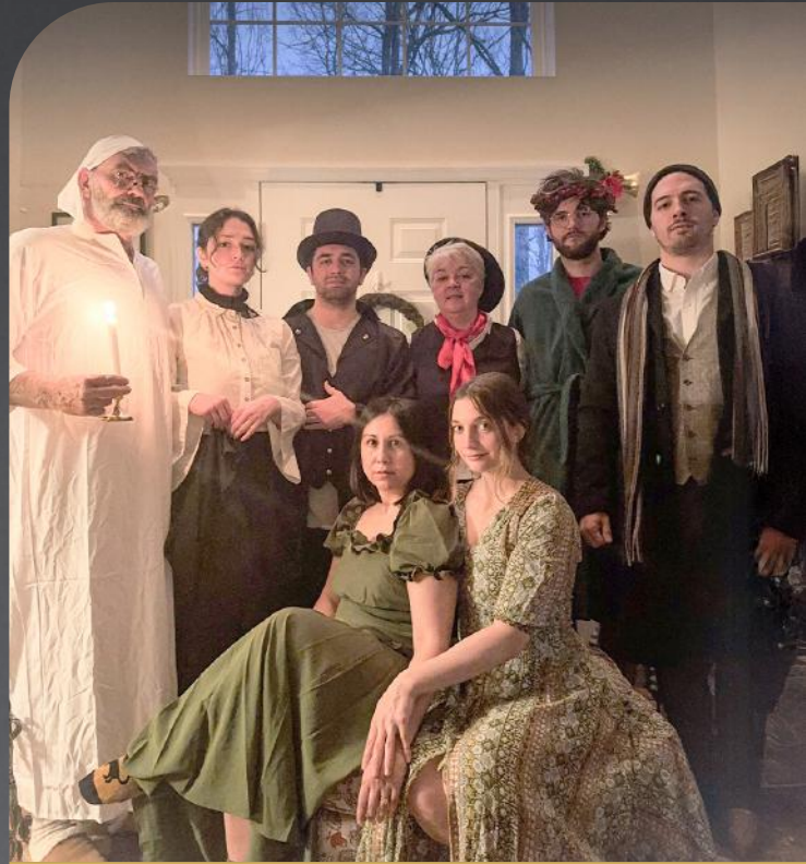
Victorian X-mas photo last years theme