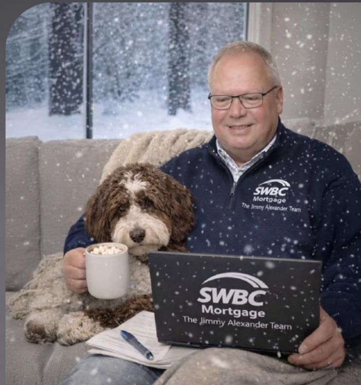
A Texas Winter with my bestie

Jerry Jones, the owner of the Dallas Cowboys. He has power, money, and a franchise that has a following that's unreal, not to mention fan loyalty.