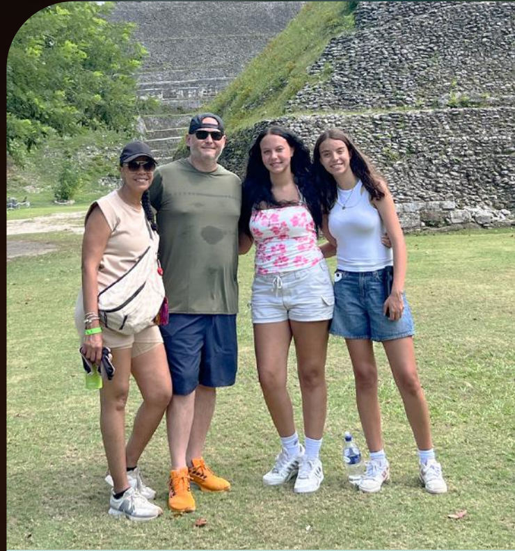
Family in Belize

I'd choose someone living in extreme poverty to gain perspective & gratitude.