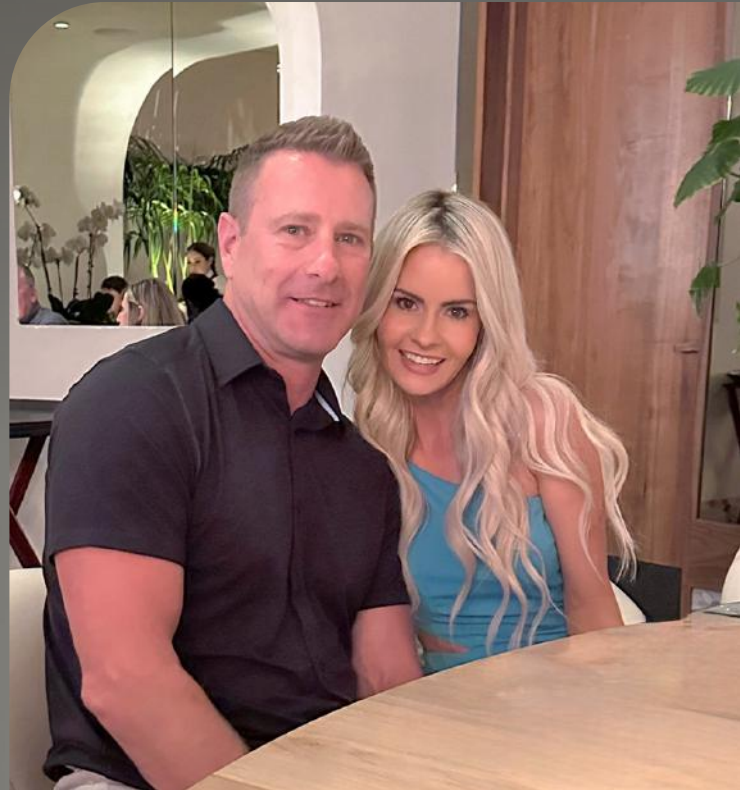
Built a life I love, with the one I love

Focus on building relationships, not just closing transactions. Be the calm, trusted advisor who educates, communicates clearly, and genuinely cares about the client's bigger picture. Show up even when there's no deal attached!