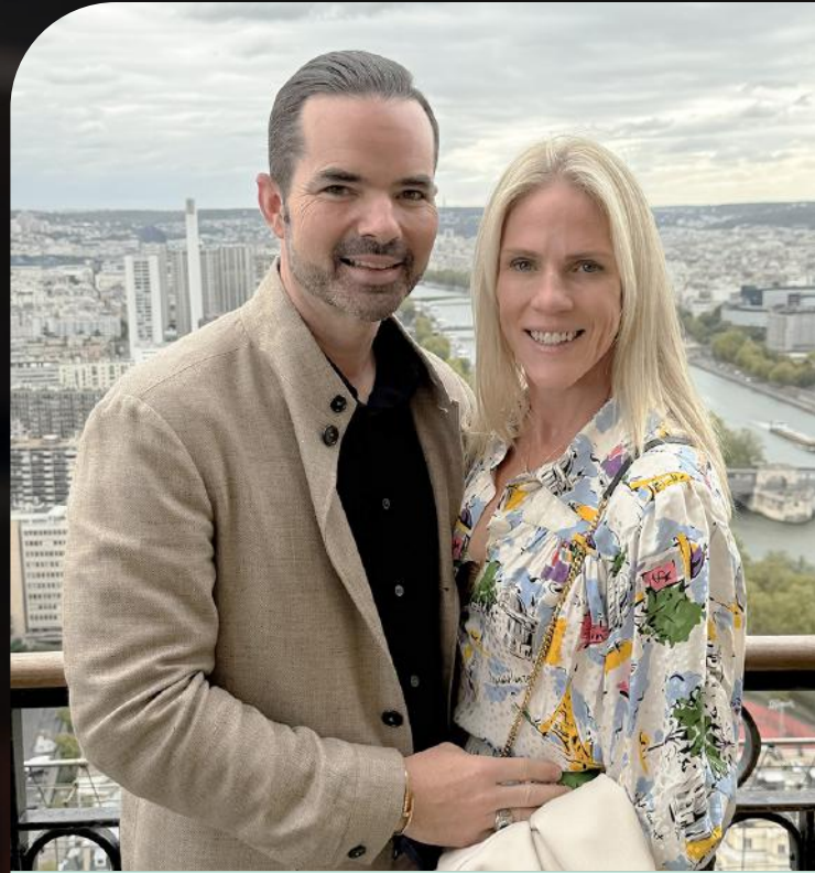
Chairman's Circle in Paris, France

Speaking French fluently because I enjoy time in France and would prefer to speak with locals fluently.