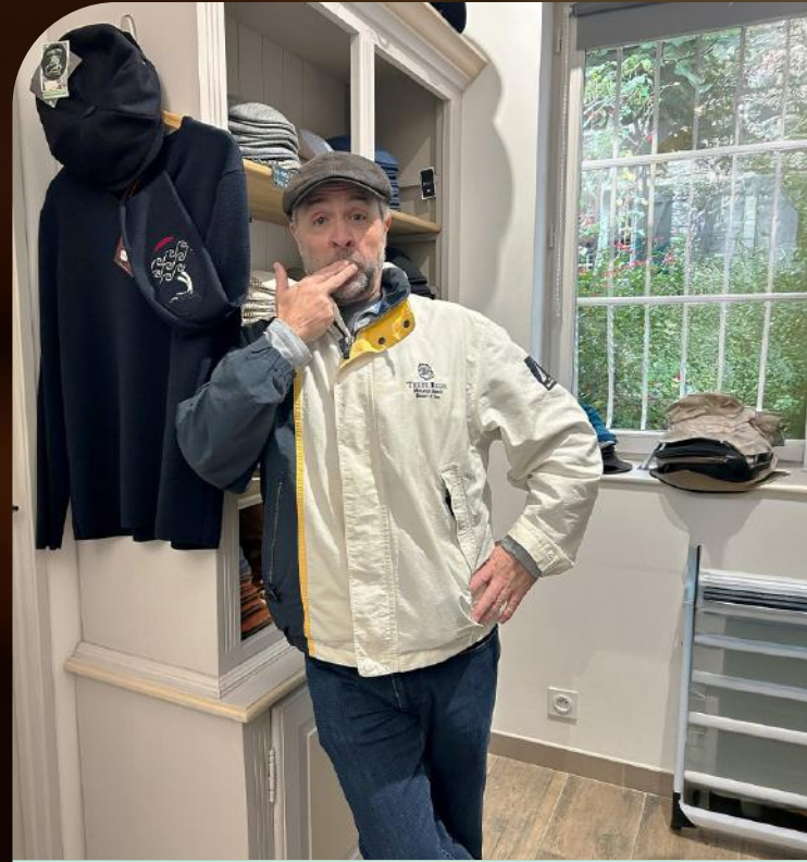
SWBC Chairman's Circle, Giverny, France

My memory. I can remember vivid details that friends and family are astonished by!