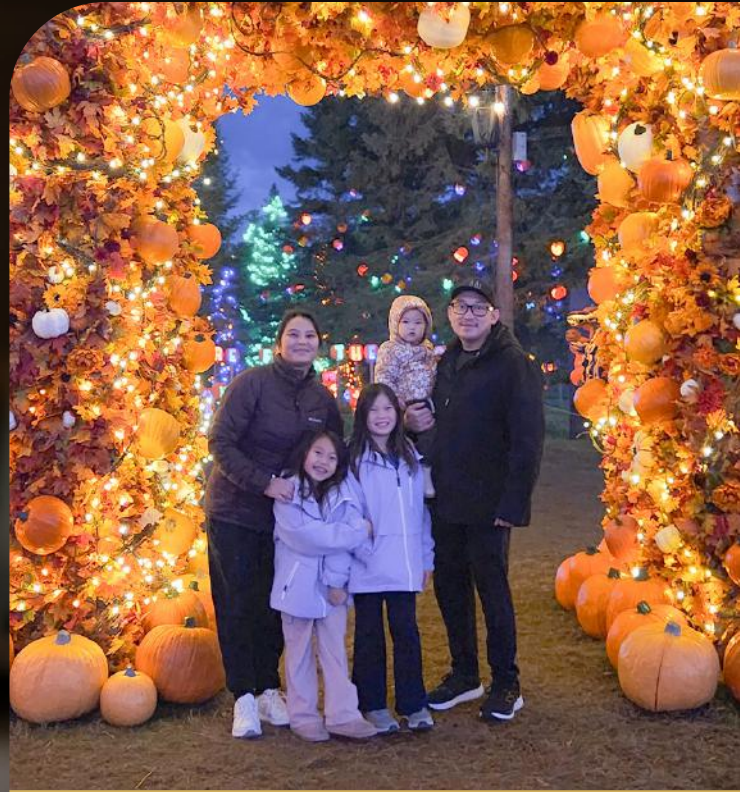
The Great Pumpkin Trail

I would love to be artistic. The world becomes more beautiful with the right combination of textures and colors.