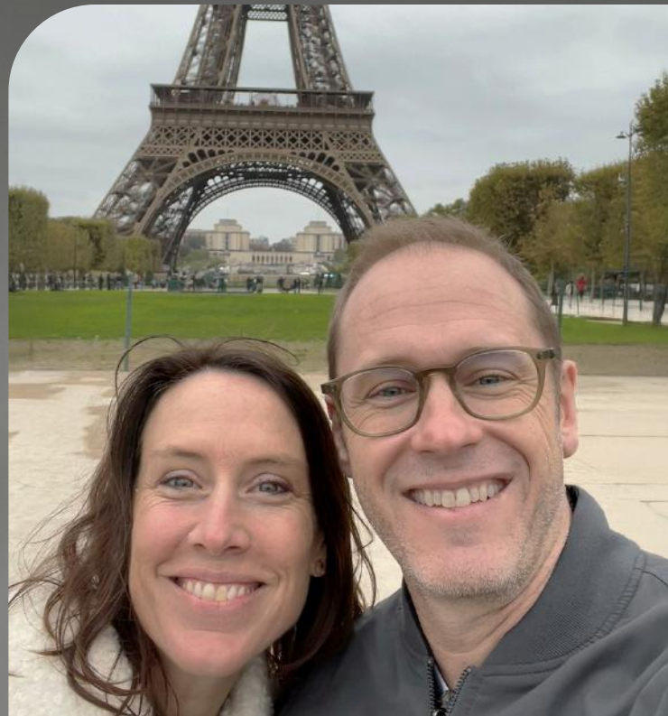
Us. Paris. Toujours l'amour. 15 ans!

Beatboxing. I just think it would be the best at parties.