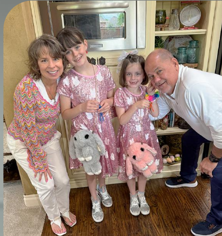
Love spending time with our granddaughters

Invest in your client base and relationships. Database. Be visible and strive to impact your client's life financially.