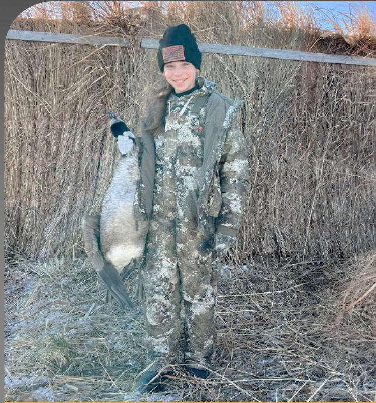
My Daughter and her first goose

I would live on a farm in Easton, on the eastern shore of Maryland, and hunt every day.