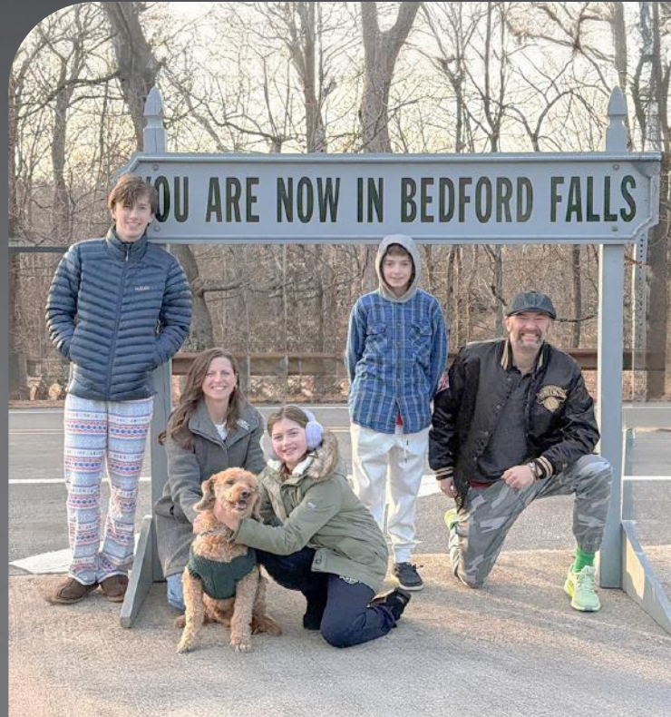
It's a wonderful life!

One year is not enough time to be a part of the community and truly enjoy what the location has to offer. But I have a red beard and I like Guinness so I guess it would be Ireland.