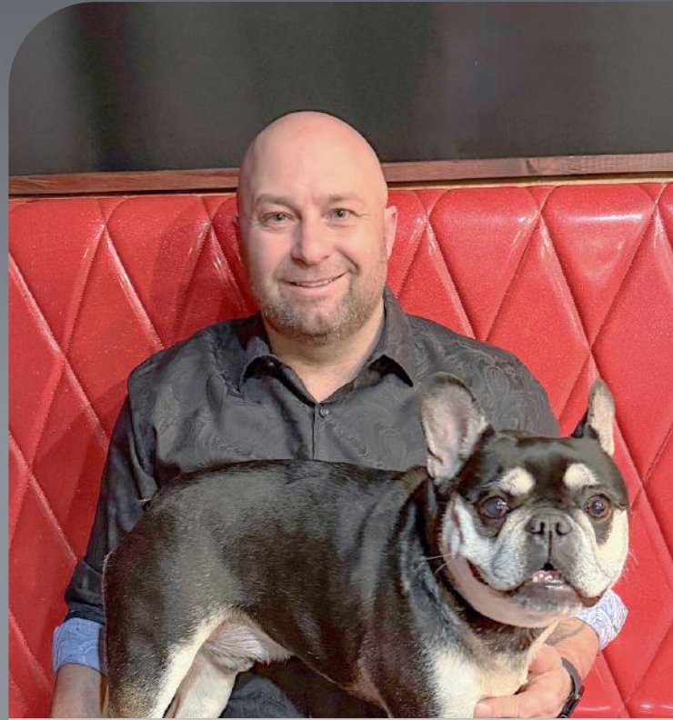
Maverick is always along for the ride!

Don't wait until you "feel ready." Learn in real time, ask questions early, and build relationships before you need them.