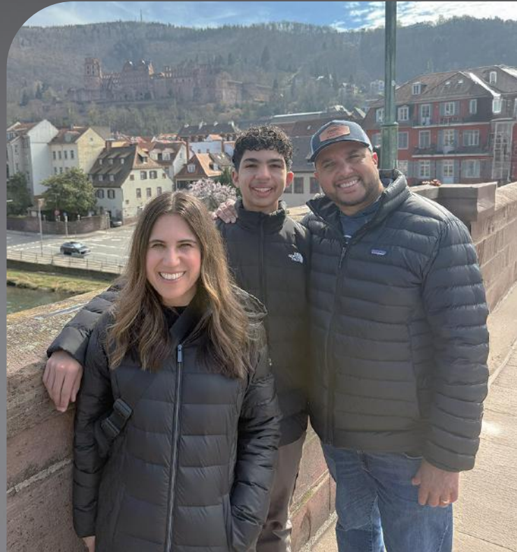
Tatum Family Trip to Germany 2025

Put the work in, stay committed and Trust in God.