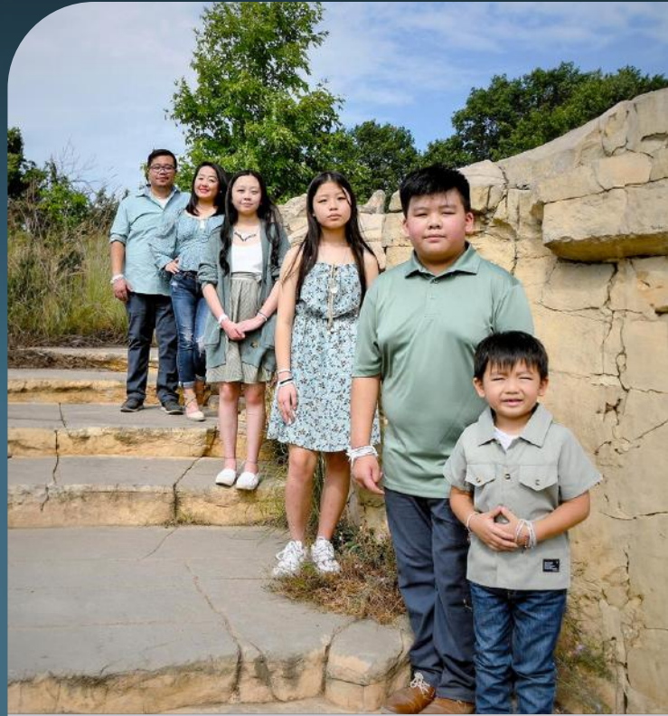
My #1 Supporters

As the phrase we've all come to know, "There is no place like home" says, I wouldn't change where I'm living now for anywhere else.