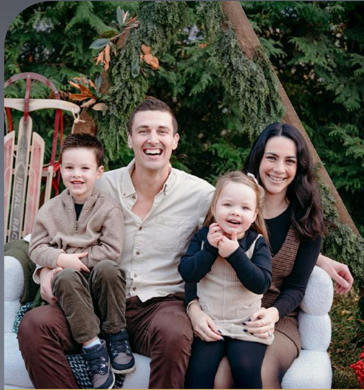
All of my why's in one picture

A NASA Astronaut on the International Space Station.