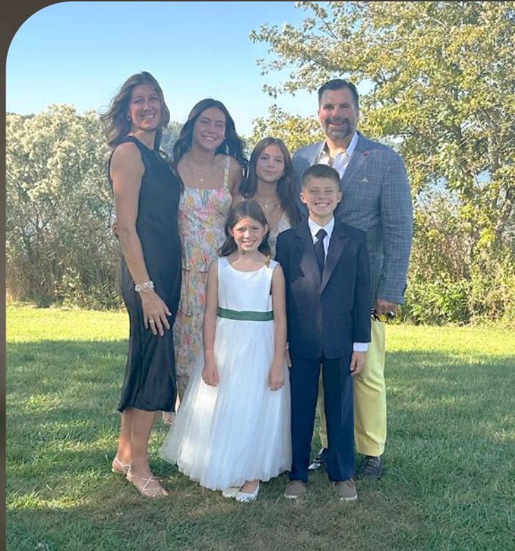
My Sister's wedding, North Beach, MD

I would want to instantly master how to drive the golf ball 300 yards down the middle of the fairway. every time. Why? Because I struggle with my distance off the tee.