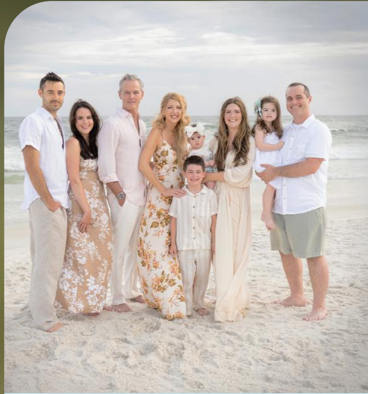
Rosemary Beach 2025