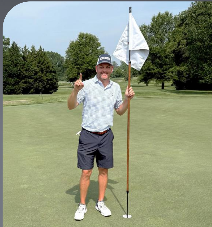
Hole in One from June 2025

I'm a natural litigator. I love a spirited back-and-forth to prove my point. My wife would say this is not always my best superpower.