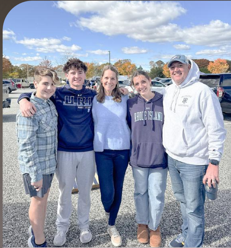
The College Experience Begins

Someone in my family, just to see how different a perspective on the same thing can be! Plus getting to see me from someone else's point of view has to be amazing!