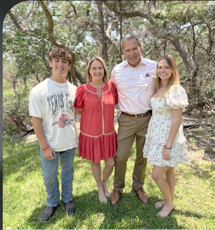
One Lucky Guy!