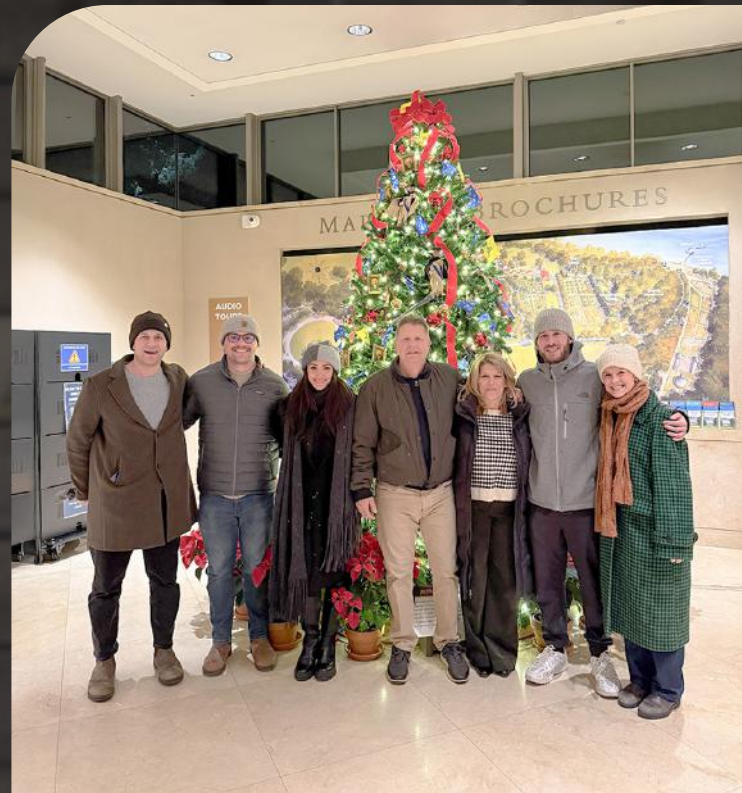
Family time at Mount Vernon Estate

Build authentic long term relationships by providing consistent personalized values ensuring you remain the top of mind expert for your customers & agents when they need you the most.