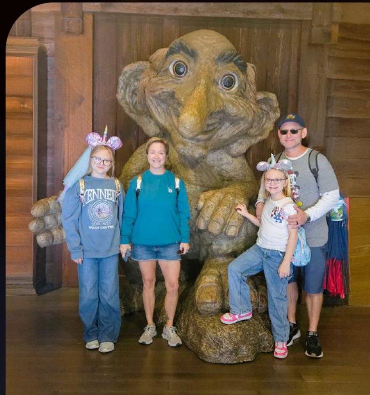
Coleman Family 2025 Christmas Trip

New England Summer. As long as it lasts year-round. "I wouldn't make it in the winter"