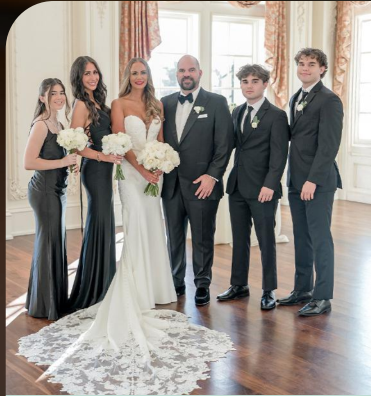
The best day EVER!

Italy! For the slower pace, rich history, and emphasis on family and community! Spending a year there would be a reminder that success is about balance, relationships, and enjoying the moments in between!