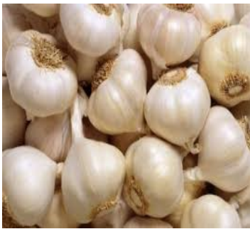
AUTUMN PLANTING WHITE