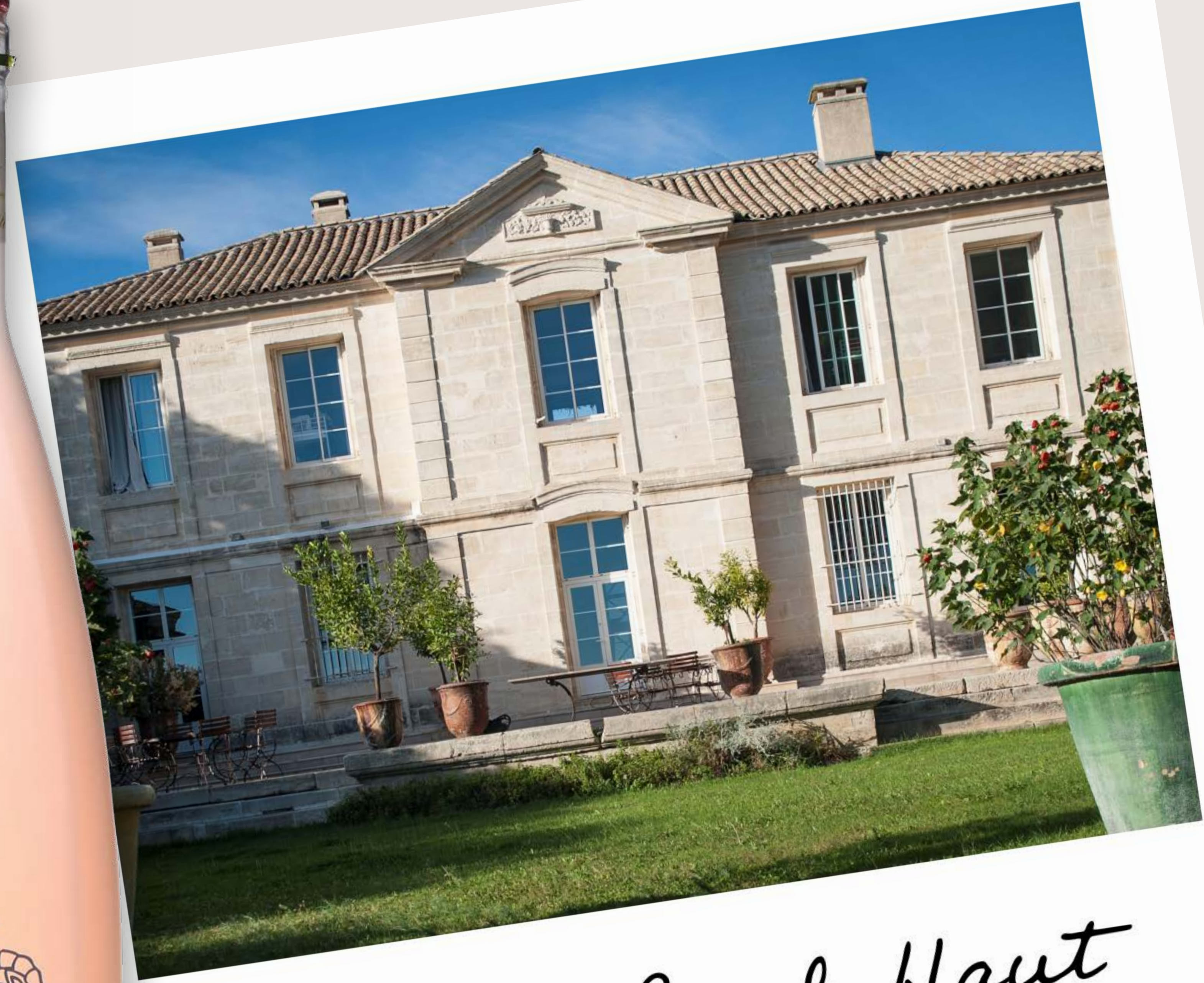
Chateau Puech Haut LANGUEDOC, FRANCE