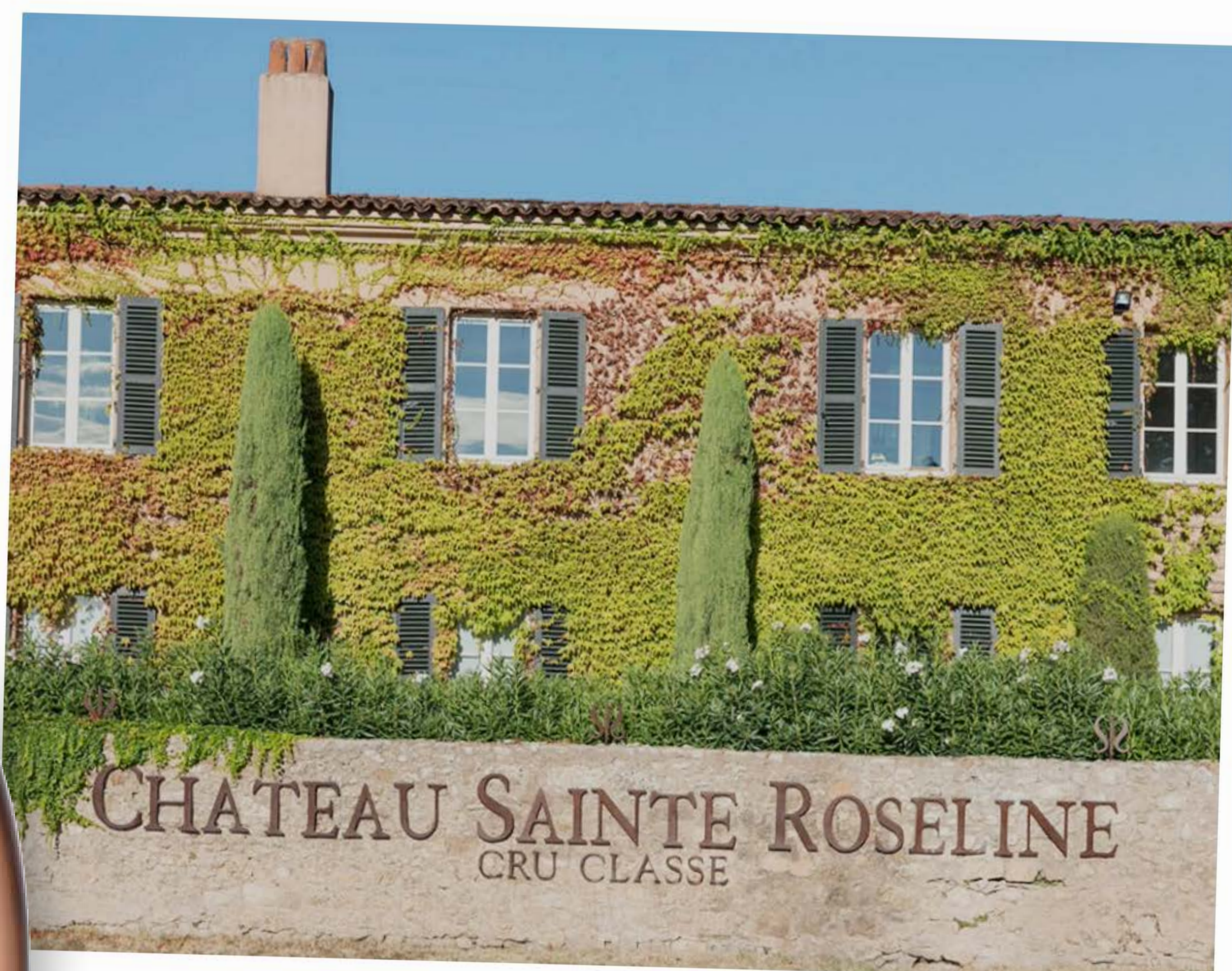
Chateau Saint Roseline PROVENCE, FRANCE