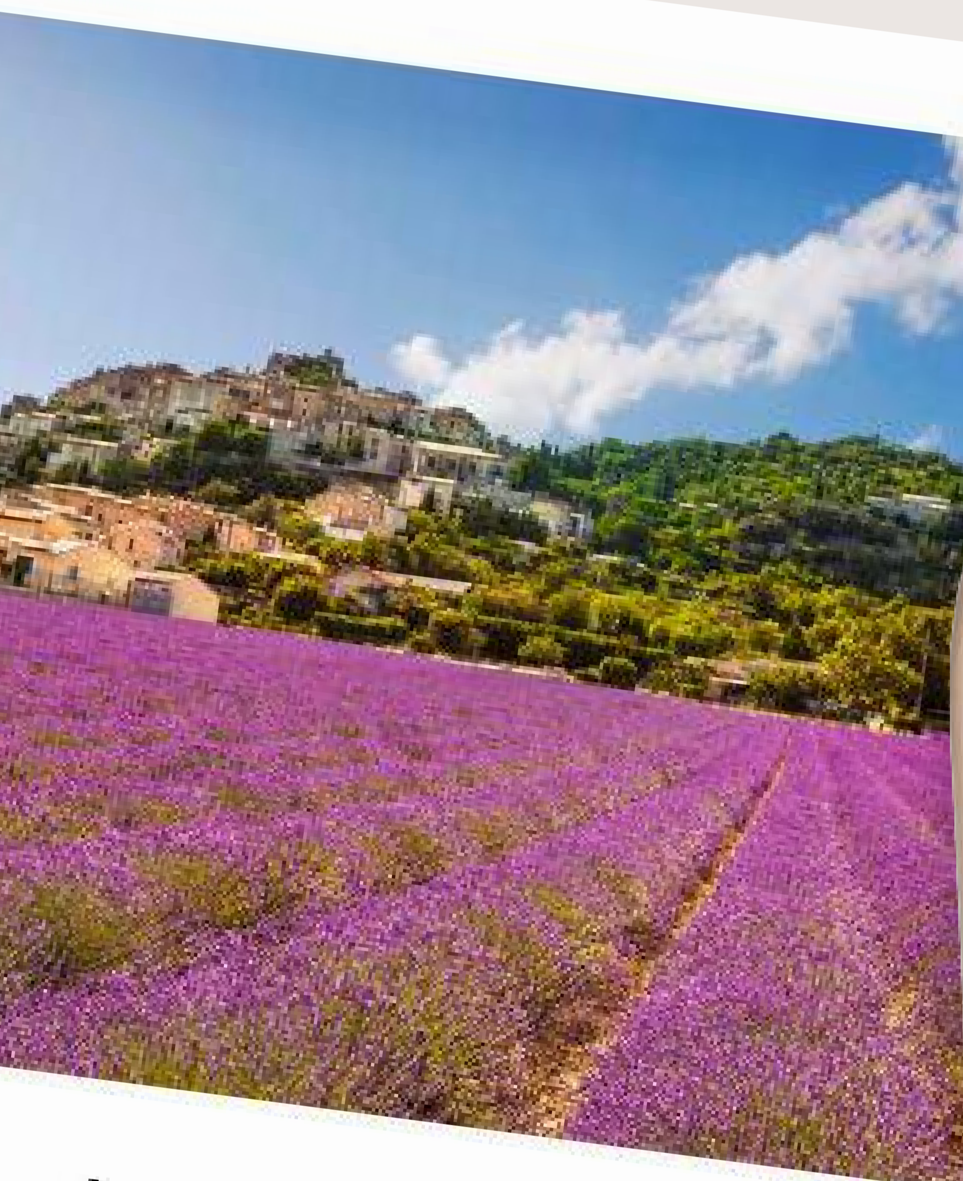
Château Minuty PROVENCE, FRANCE