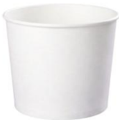
PB2900W 85 oz (2,900 ml) Ø 180/145 H 165 mm 300/ctn