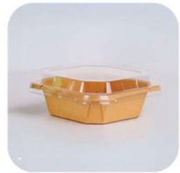
OX650K 22 oz (650 ml) 134x134x47 H mm 200/ctn