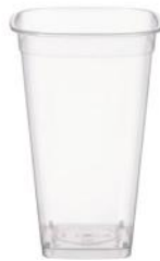
SC16P 16 oz (500 ml) Ø 82/50 H 144 mm 500/ctn