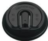
SL90P Sip Lid PP PLASTIC Ø 90 mm 1,000/ctn