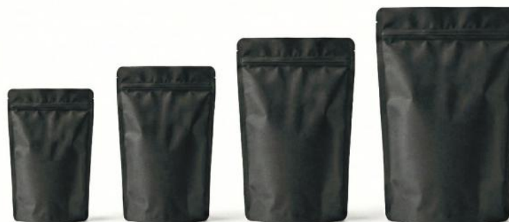
SP150B 150 g 12x7 H 20 cm 300/ctn SP250B 250 g 16x9 H 23 cm 300/ctn SP500B 500 g 18x10 H 29 cm 300/ctn SP1000B 1000 g 24x12 H 34 cm 300/ctn