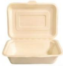
CG450 450ml Clamshell 175x125x38/50mm 500/ctn