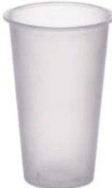
CC16F 16 oz (500 ml) Ø 90/55 H 135 mm 500/ctn