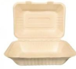
CG960 9"x6" Clamshell 233x155x45/80mm 250/ctn