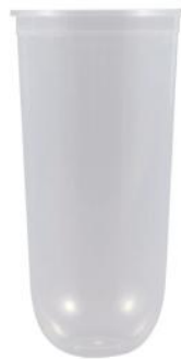
UC24P 24 oz (700 ml) Ø 90/50 H 160 mm 500/ctn