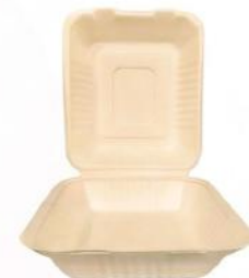
CG990 9"x9" Clamshell 230x230x45/80mm 200/ctn