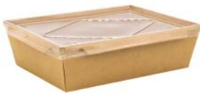
CX1600K 1,600 ml 211x153x60 H mm 200/ctn