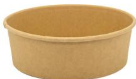
SB1300K 42 oz (1,300 ml) Ø 185/160 H 65 mm 300/ctn