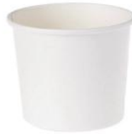
TB350W 12 oz (350 ml) Ø 96/75 H 60 mm 300/ctn