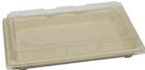
CH600 20 oz (600 ml) 238x145 H 23 mm 300/ctn