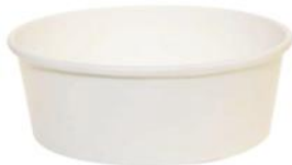
SB1300W 42 oz (1,300 ml) Ø 185/160 H 65 mm 300/ctn