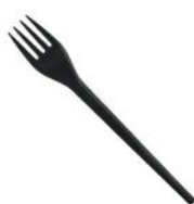
EF166 PS Plastic 166 mm 1,000/ctn