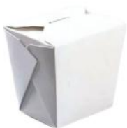
NX500W 16 oz (500 ml) 92 x 75 x 84 H mm 200/ctn