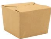
BX1200K 1,200 ml 125x120x90 H mm 200/ctn