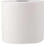
MR20 White Paper 200m 6 Roll / box