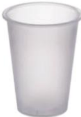
CC14F 14 oz (400 ml) Ø 90/55 H 114 mm 500/ctn