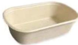
CD700 25 oz (700 ml) 195x115 H 50 mm 500/ctn