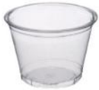
IC04T 4 oz (120 ml) Ø 74/49 H 45 mm 1,000/ctn