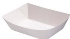
FX4W #4 205x135x45H mm 500/ctn