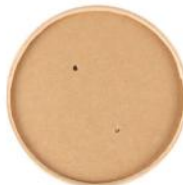
BL96K Kraft Paper Ø 96 mm 300/ctn