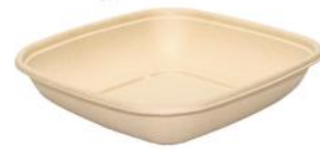
CQ1400 48 oz (1,400 ml) 216x216 H 51 mm 300/ctn