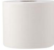
MR25 White Paper 250m 6 Roll / box