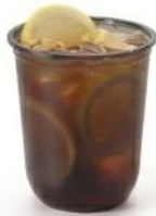
UC14B 14 oz (400 ml) Ø 90/40 H 95 mm 1,000/ctn