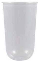
UC16P 16 oz (500 ml) Ø 90/45 H 120 mm 500/ctn