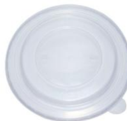
BL185T PET Plastic Ø 185 300/ctn