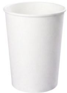
PB2000W 64 oz (2,000 ml) Ø 135/100 H 195 mm 500/ctn