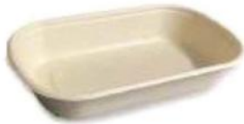
CD500 16 oz (500 ml) 195x115 H 35 mm 500/ctn