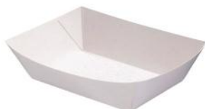
FX6W #6 260x175x60H mm 500/ctn