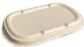
BL195S Sugarcane Pulp 210x120 H 18 mm 500/ctn