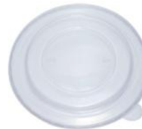
BL150T PET Plastic Ø 150 300/ctn