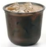
UC10B 10 oz (300 ml) Ø 90/40 H 83 mm 1,000/ctn