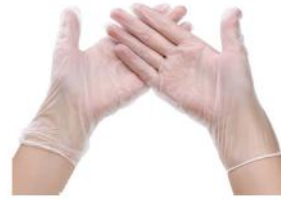
VV03 Powder Free Vinyl S,M,L,XL 100 pcs / box 10 box / ctn