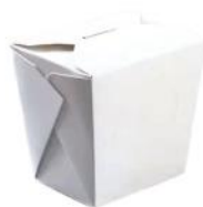
NX750W 26 oz (750 ml) 105 x 80 x 103 H mm 200/ctn