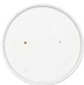
BL115W White Paper Ø 115 mm 300/ctn