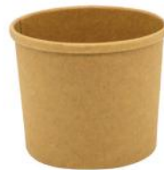
TB350K 12 oz (350 ml) Ø 96/75 H 60 mm 300/ctn