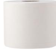
MR30 White Paper 300m 6 Roll / box