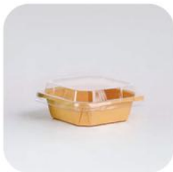
OX300K 10 oz (300 ml) 100x100x36 H mm 200/ctn