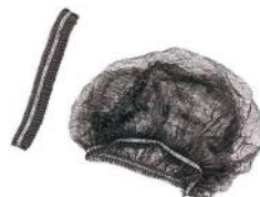
HC02 Nonwoven 100 pcs / box 10 box / ctn