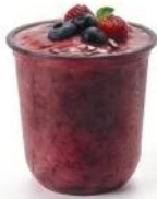
UC12B 12 oz (350 ml) Ø 90/40 H 90 mm 1,000/ctn