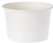
WB500W 16 oz (500 ml) Ø 115/93 H 62 mm 300/ctn