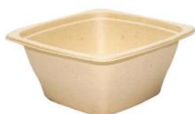
CS1400 48 oz (1,400 ml) 180x180 H 90 mm 300/ctn