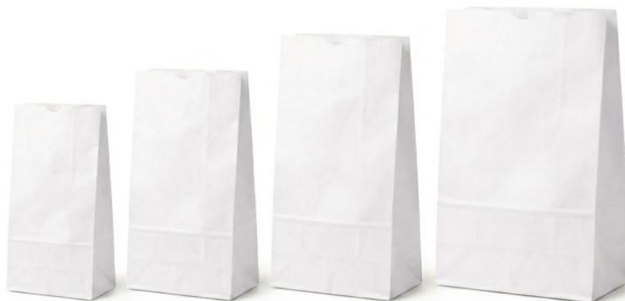
SNACK NG1509W 15x9x28 cm 250/ctn