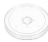
HL80C Flat Hole Lid PP Plastic Ø 80 mm 1,000/ctn