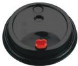
RL90P Red Heart Lid PP PLASTIC Ø 90 mm 1,000/ctn