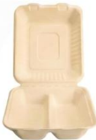
CG882 8"x8" Clamshell 2 Comp 200x220x45/77mm 200/ctn