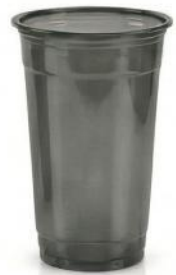
CC24B 24 oz (700 ml) Ø 98/63 H 153 mm 1,000/ctn