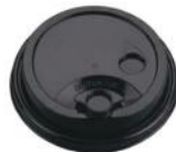
CL90P Connected Lid PP PLASTIC Ø 90 mm 1,000/ctn