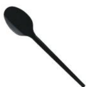
ES164 PS Plastic 164 mm 1,000/ctn