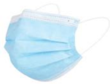
FM01 3ply Nonwoven 175 x 95 mm 50 pcs / box 20 box / ctn