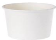
WB250W 8 oz (250 ml) Ø 115/93 H 40 mm 300/ctn