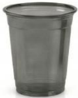
CC12B 12 oz (350 ml) Ø 92/56 H 107 mm 1,000/ctn