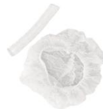
HC03 Nonwoven 100 pcs / box 10 box / ctn