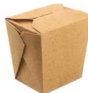
NX750K 26 oz (750 ml) 105 x 80 x 103 H mm 200/ctn