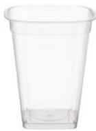
SC12P 12 oz (360 ml) Ø 82/50 H 114 mm 500/ctn