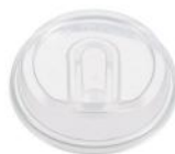
SL90P Sip Lid PP PLASTIC Ø 90 mm 1,000/ctn