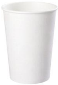
PB700W 24 oz (700 ml) Ø 95/65 H 175 mm 1000/ctn