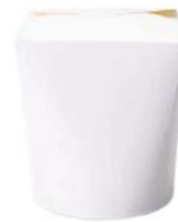
NB1000W 32 oz (1,000 ml) 102 x 90 x 112 H mm 200/ctn