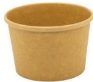
TB250K 8 oz (250 ml) Ø 96/75 H 60 mm 300/ctn