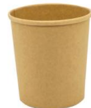
TB500K 16 oz (500 ml) Ø 96/75 H 100 mm 300/ctn