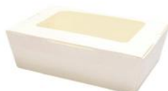
WX1200W 40 oz (1200ml) 198x138x50 H mm 200/ctn