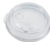
CL90P Connected Lid PP PLASTIC Ø 90 mm 1,000/ctn