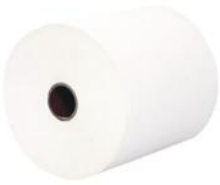
AR12 White Paper 20cm x 120m 6 Roll / box