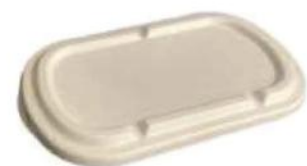
BL235S Sugarcane Pulp 240x138 H 18 mm 500/ctn