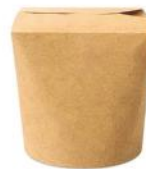
NB750K 26 oz (750 ml) 95 x 90 x 97 H mm 200/ctn