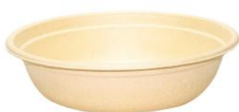
CN700 24 oz (700 ml) Ø 208 H 45 mm 300/ctn