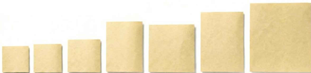
FW2015K 20x15 cm 2,000/ctn