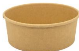
SB1500K 50 oz (1,500 ml) Ø 185/160 H 75 mm 300/ctn