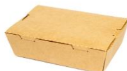
AX1600K 54 oz (1600ml) 212x144x60 H mm 200/ctn