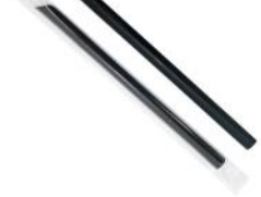
SS1219 PP Plastic Ø 12 x 190 mm 4,000/ctn