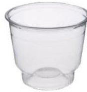
IC08T 8 oz (250 ml) Ø 92/56 H 71 mm 1,000/ctn