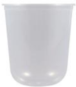
UC12P 12 oz (360 ml) Ø 90/45 H 95 mm 500/ctn