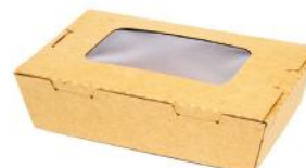
WX2100K 70 oz (2100ml) 220x164x65 H mm 200/ctn