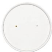
BL96W White Paper Ø 96 mm 300/ctn