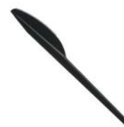
EN164 PS Plastic 164 mm 1,000/ctn