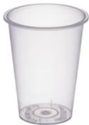
CC14P 14 oz (400 ml) Ø 90/55 H 114 mm 500/ctn