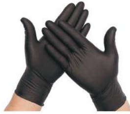
VV02 Powder Free Vinyl S,M,L,XL 100 pcs / box 10 box / ctn