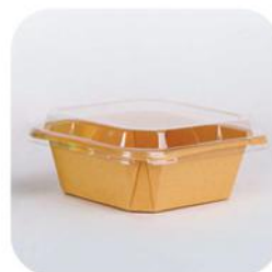
OX1200K 40 oz (1,200 ml) 160x160x62 H mm 200/ctn