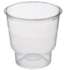
IC12T 12 oz (350 ml) Ø 98/62 H 83 mm 1,000/ctn