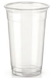
CC24T 24 oz (700 ml) Ø 98/63 H 153 mm 1,000/ctn