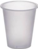
CC12F 12 oz (350 ml) Ø 90/55 H 100 mm 500/ctn