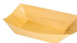
FX5K #5 220x160x55H mm 500/ctn