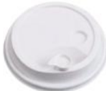
CL90P Connected Lid PP PLASTIC Ø 90 mm 1,000/ctn