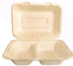
CG962 9"x6" Clamshell 2 Comp 233x155x45/80mm 250/ctn