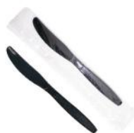
PN185 PS Plastic 185 mm 1,000/ctn