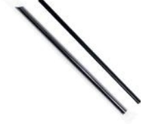
SS619 PP Plastic Ø 6 x 190 mm 4,000/ctn