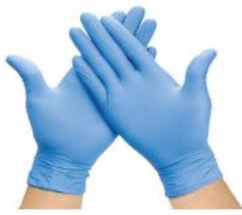
VV01 Powder Free Vinyl S,M,L,XL 100 pcs / box 10 box / ctn