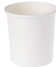
TB500W 16 oz (500 ml) Ø 96/75 H 100 mm 300/ctn