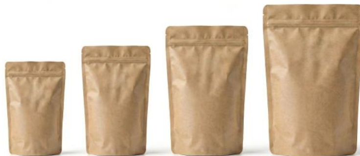
SP150K 150 g 12x7 H 20 cm 300/ctn SP250K 250 g 16x9 H 23 cm 300/ctn SP500K 500 g 18x10 H 29 cm 300/ctn SP1000K 1000 g 24x12 H 34 cm 300/ctn