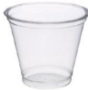
IC09T 9 oz (270 ml) Ø 92/55 H 71 mm 1,000/ctn