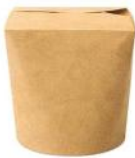
NB500K 16 oz (500 ml) 83 x 78 x 92 H mm 200/ctn