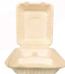
CG993 9"x9" Clamshell 3 Comp 230x230x45/80mm 200/ctn