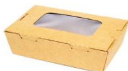
WX1200K 40 oz (1200ml) 198x138x50 H mm 200/ctn