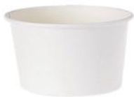
TB200W 6 oz (200 ml) Ø 96/78 H 48 mm 300/ctn