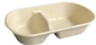
CD852 28 oz (850 ml) 235x132 H 46 mm 500/ctn