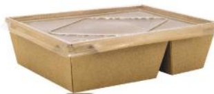
EX1500K 1,500 ml 211x151x59 H mm 200/ctn