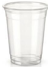
CC16T 16 oz (500 ml) Ø 98/65 H 121 mm 1,000/ctn