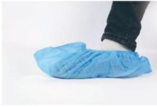
SC01 Nonwoven 1,000 pcs / ctn