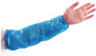
SL01 PE Plastic 2,000 pcs / ctn