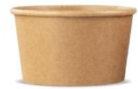
IC16K 16 oz (500 ml) Ø 110/90 H 86 mm 1,000/ctn