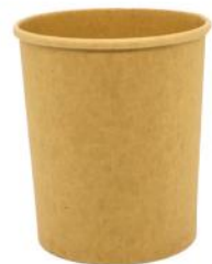
WB1000K 32 oz (1,000 ml) Ø 115/93 H 130 mm 300/ctn