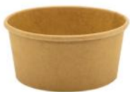
WB250K 8 oz (250 ml) Ø 115/93 H 40 mm 300/ctn