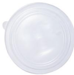
BL208P PP Plastic Ø 208 mm 300/ctn