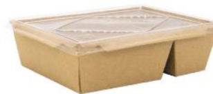
EX2000K 2,000 ml 220x162x65 H mm 200/ctn