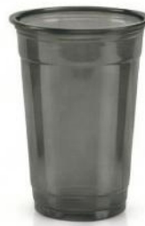
CC20B 20 oz (600 ml) Ø 98/64 H 135 mm 1,000/ctn