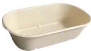
CD1000 32 oz (1,000 ml) 235x132 H 60 mm 500/ctn