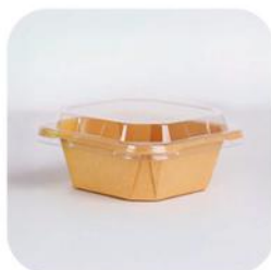
OX750K 25 oz (750 ml) 134x134x55 H mm 200/ctn