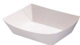
FX5W #5 220x160x55H mm 500/ctn