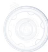
BL96P PP Plastic Ø 96 mm 300/ctn