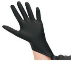
NV02 Powder Free Nitrile S,M,L,XL 100 pcs / box 10 box / ctn