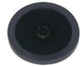
HL80B Flat Hole Lid PP Plastic Ø 80 mm 1,000/ctn