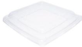
BL203T PET Plastic 203x203 mm 300/ctn