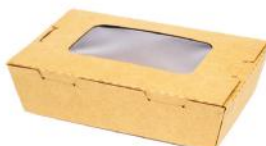
WX1600K 54 oz (1600ml) 212x144x60 H mm 200/ctn