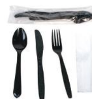
PK2 PS Plastic Wrap Food Kit 1,000/ctn