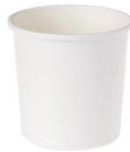
WB800W 26 oz (800 ml) Ø 115/93 H 110 mm 300/ctn