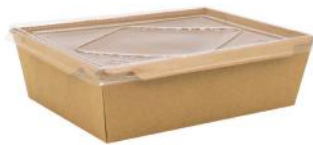
CX2100K 2,100 ml 220x164x65 H mm 200/ctn