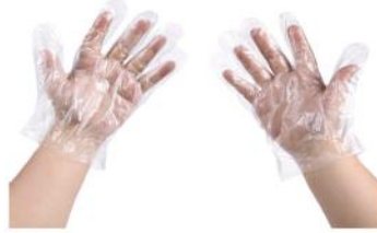
PV01 PE Plastic 10,000 pcs / ctn