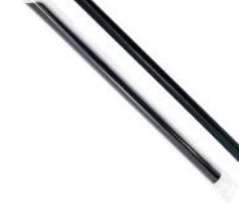
SS1021 PP Plastic Ø 10 x 210 mm 4,000/ctn