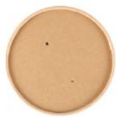
BL115K Kraft Paper Ø 115 mm 300/ctn