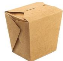
NX1000K 32 oz (1,000 ml) 115 x 90 x 110 H mm 200/ctn