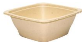
CS1000 32 oz (1,000 ml) 180x180 H 70 mm 300/ctn