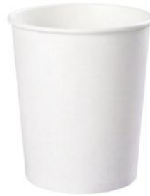
PB1350W 46 oz (1,350 ml) Ø 115/89 H 172 mm 500/ctn