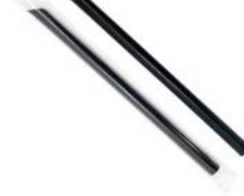
SS1019 PP Plastic Ø 10 x 190 mm 4,000/ctn