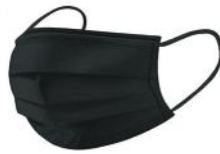
FM02 3ply Nonwoven 175 x 95 mm 50 pcs / box 20 box / ctn