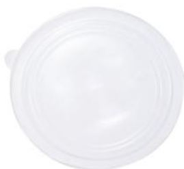
BL208T PET Plastic Ø 208 mm 300/ctn