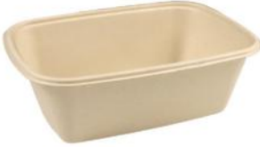
CR1400 48 oz (1,400 ml) 223x160 H 69 mm 300/ctn