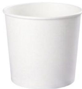
PB3600W 130 oz (3,600 ml) Ø 185/148 H 196 mm 100/ctn