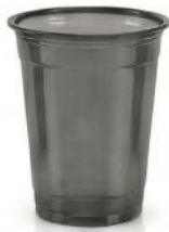
CC14B 14 oz (400 ml) Ø 92/56 H 116 mm 1,000/ctn