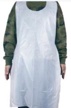
PA01 PE Plastic 1,000 pcs / ctn