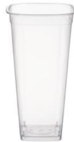
SC20P 20 oz (600 ml) Ø 82/50 H 172 mm 500/ctn