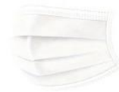
FM03 3ply Nonwoven 175 x 95 mm 50 pcs / box 20 box / ctn