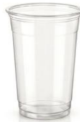
CC20T 20 oz (600 ml) Ø 98/64 H 135 mm 1,000/ctn