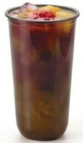
UC24B 24 oz (700 ml) Ø 90/40 H 150 mm 1,000/ctn