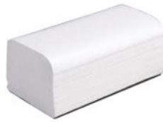
IF19 White Paper 19 x 21 cm 6 Roll / box