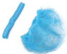
HC01 Nonwoven 100 pcs / box 10 box / ctn