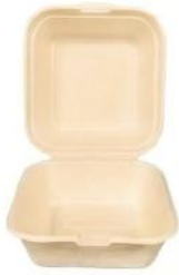
CG660 6"x6" Clamshell 150x150x40/80mm 500/ctn