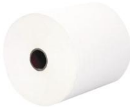
AR20 White Paper 20cm x 200m 6 Roll / box