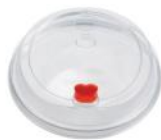
RL90P Red Heart Lid PP PLASTIC Ø 90 mm 1,000/ctn