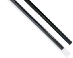
SS1221 PP Plastic Ø 12 x 210 mm 4,000/ctn