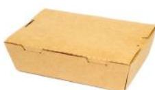
AX1400K 48 oz (1400ml) 198x138x60 H mm 200/ctn