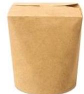
NB1000K 32 oz (1,000 ml) 102 x 90 x 112 H mm 200/ctn