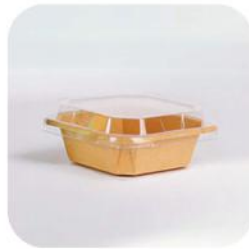
OX500K 16 oz (500 ml) 124x124x45 H mm 200/ctn