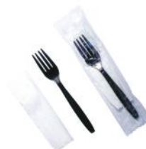
PK1 PS Plastic Fork & Napkin 1,000/ctn