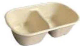
CD702 25 oz (700 ml) 195x115 H 56 mm 500/ctn