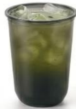
UC16B 16 oz (500 ml) Ø 90/40 H 115 mm 1,000/ctn