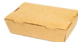
AX2100K 70 oz (2100ml) 220x164x65 H mm 200/ctn