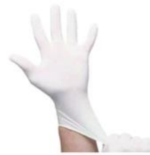
NV03 Powder Free Nitrile S,M,L,XL 100 pcs / box 10 box / ctn