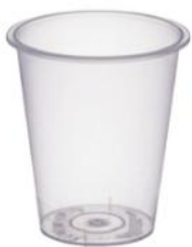
CC12P 12 oz (350 ml) Ø 90/55 H 100 mm 500/ctn