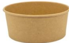
SB1000K 32 oz (1,000 ml) Ø 150/128 H 75 mm 300/ctn