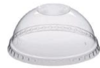
DL110T PET Plastic Ø 110 1,000/ctn