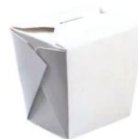
NX1000W 32 oz (1,000 ml) 115 x 90 x 110 H mm 200/ctn