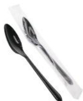
PS168 PS Plastic 168 mm 1,000/ctn