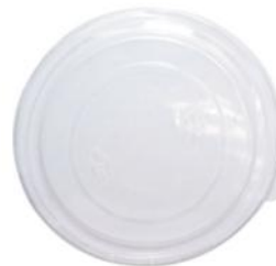
BL185P PP Plastic Ø 185 300/ctn