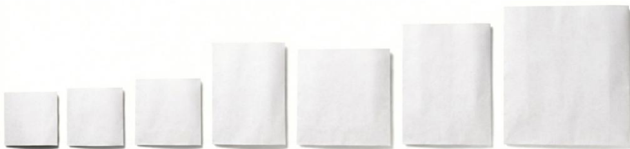
FW2015W 20x15 cm 2,000/ctn