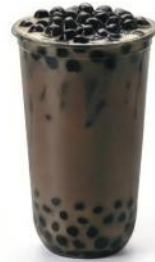
UC20B 20 oz (600 ml) Ø 90/40 H 140 mm 1,000/ctn