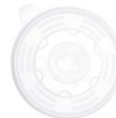
BL115P PP Plastic Ø 115 mm 300/ctn