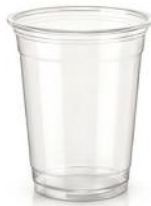
CC14T 14 oz (400 ml) Ø 92/56 H 116 mm 1,000/ctn