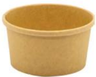
TB200K 6 oz (200 ml) Ø 96/78 H 48 mm 300/ctn