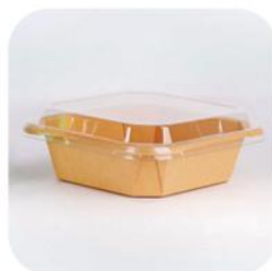
OX1000K 32 oz (1,000 ml) 160x160x50 H mm 200/ctn