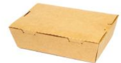
AX1200K 40 oz (1200ml) 198x138x50 H mm 200/ctn