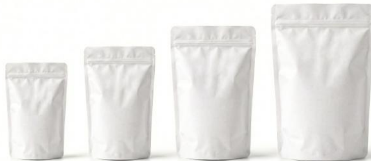
SP150W 150 g 12x7 H 20 cm 300/ctn SP250W 250 g 16x9 H 23 cm 300/ctn SP500W 500 g 18x10 H 29 cm 300/ctn SP1000W 1000 g 24x12 H 34 cm 300/ctn