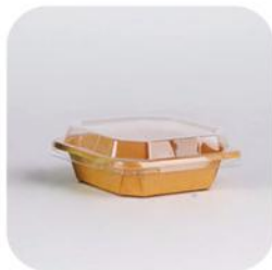
OX400K 14 oz (400 ml) 124x124x36 H mm 200/ctn