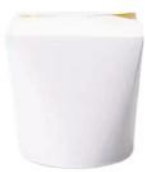
NB500W 16 oz (500 ml) 83 x 78 x 92 H mm 200/ctn