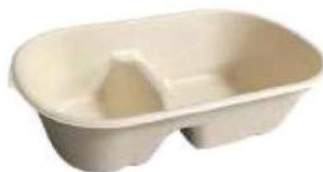
CD1002 32 oz (1,000 ml) 235x132 H 60 mm 500/ctn