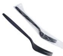
PF172 PS Plastic 172 mm 1,000/ctn