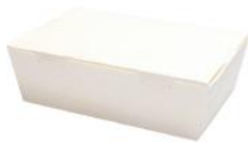
AX1400W 48 oz (1400ml) 198x138x60 H mm 200/ctn