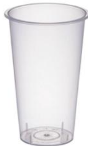
CC16P 16 oz (500 ml) Ø 90/55 H 135 mm 500/ctn