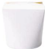
NB750W 26 oz (750 ml) 95 x 90 x 97 H mm 200/ctn