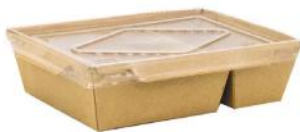
EX1200K 1,200 ml 198x138x49 H mm 200/ctn