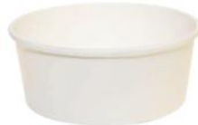
SB1000W 34 oz (1,000 ml) Ø 150/128 H 75 mm 300/ctn