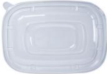
BL223P PP Plastic (Microwaveable) 223x160 mm 300/ctn