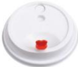
RL90P Red Heart Lid PP PLASTIC Ø 90 mm 1,000/ctn