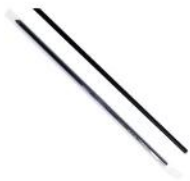
SS419 PP Plastic Ø 4 x 190 mm 4,000/ctn