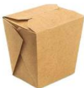
NX500K 16 oz (500 ml) 92 x 75 x 84 H mm 200/ctn