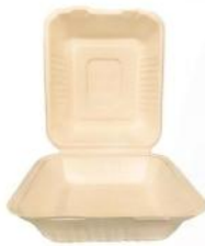
CG880 8"x8" Clamshell 200x215x45/80mm 200/ctn