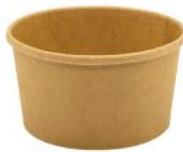
WB500K 16 oz (500 ml) Ø 115/93 H 62 mm 300/ctn