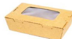
WX900K 30 oz (900ml) 174x134x48 H mm 200/ctn