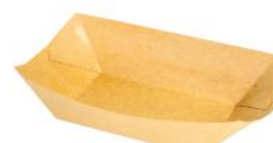
FX6K #6 260x175x60H mm 500/ctn