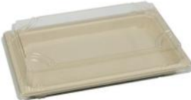
CH450 15 oz (450 ml) 215x135 H 20 mm 300/ctn