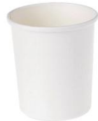
WB1000W 32 oz (1,000 ml) Ø 115/93 H 130 mm 300/ctn