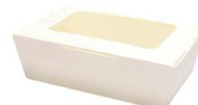
WX2100W 70 oz (2100ml) 220x164x65 H mm 200/ctn