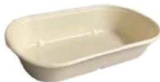
CD850 28 oz (850 ml) 235x132 H 46 mm 500/ctn