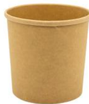
WB800K 26 oz (800 ml) Ø 115/93 H 110 mm 300/ctn