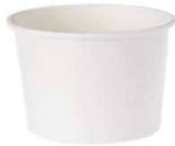
TB250W 8 oz (250 ml) Ø 96/75 H 60 mm 300/ctn