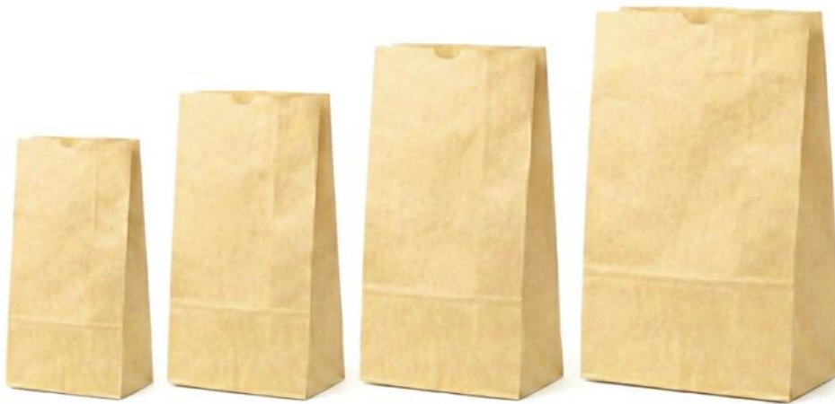
SNACK NG1509K 15x9x28 cm 250/ctn