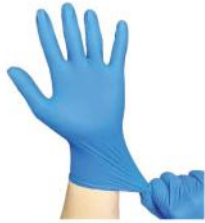
NV01 Powder Free Nitrile S,M,L,XL 100 pcs / box 10 box / ctn