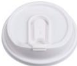
SL90P Sip Lid PP PLASTIC Ø 90 mm 1,000/ctn