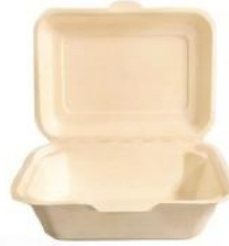
CG750 7"x5" Clamshell 183x135x45/65mm 500/ctn