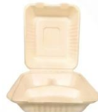
CG883 8"x8" Clamshell 3 Comp 200x215x45/80mm 200/ctn