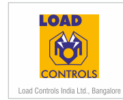
Load Controls India Ltd., Bangalore