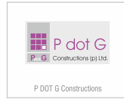
P DOT G Constructions