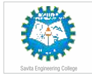
Savita Engineering College