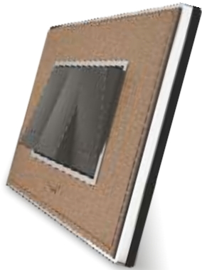
SWITCHES & ACCESSORIES