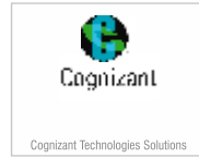
Cognizant Technologies Solutions