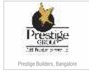
Prestige Builders, Bangalore