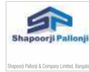
Shapoorji Pallonji & Company Limited, Bangalore