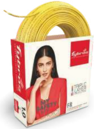
WIRES & CABLES