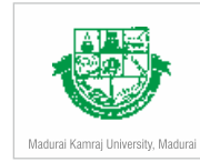
Madurai Kamraj University, Madurai