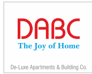
De-Luxe Apartments & Building Co.