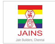
Jain Builders, Chennai