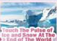
Touch The Pulse of Ice and Snow At The End of The World

The Maze-Like Water Alley Hides the Secret of The Glass Island. Take the Last Boat at The Pink Sunset and Have a Dream of The Adriatic That Will Never Fade.