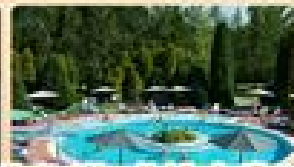
Karlovy Vary Hot Spring Town