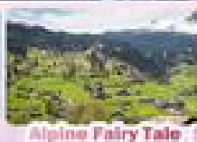
Alpine Fairy Tale

The Steel Tower Pierces The Paris Skyline and Turns Into Golden Starlight At Night. Climb to The Top and Overlook The Meandering Seine River Which Is Synonymous With Every Step You Take Leads You to The Wonderland Heart of Paris.