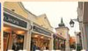
Fashion Outlet Parndorf

Travel Through a Fairytale Winter Wonderland As The Christmas Bells Ring In, Let The Scent of Cinnamon Cure Your Winter Fantasies