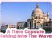
A Time Capsule Sinking Into The Waves

Snow-Capped Mountains Redoat Emerald Lakes and A Small Train Travels Through Green Fields and Flower Fields. Switzerland Is God's Private Palette. Every Step You Take Leads You to The Wonderland in The Postcards.