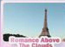
Romance Above The Clouds

The Steel Tower Pierces The Paris Skyline and Turns Into Golden Starlight At Night. Climb to The Top and Overlook The Meandering Seine River Which Is Synonymous With Every Step You Take Leads You to The Wonderland Heart of Paris.