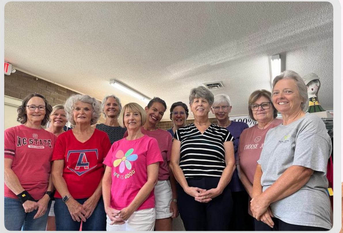
A team of volunteers from the Wednesday Bible study group at Real Life Church assisted us in organizing the Christmas Decor section of the store.

Have you wondered what volunteering at the King's Daughters Ministry is like? We have many areas to use the gifts and talents the Lord has blessed you with. Some areas are: