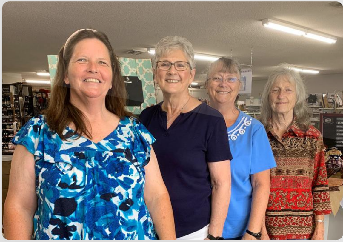
A group of volunteers came from Alexis Baptist to help price and stock shelves.