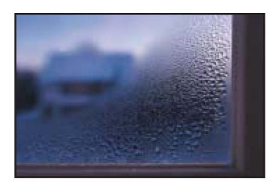
Condensation on the inside of a windowpane.