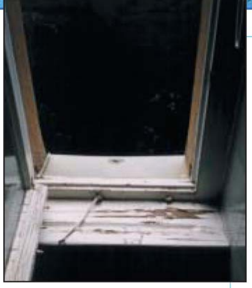
Leaky window — mold is beginning to rot the wooden frame and windowsill.

If you already have a mold problem – ACT QUICKLY.