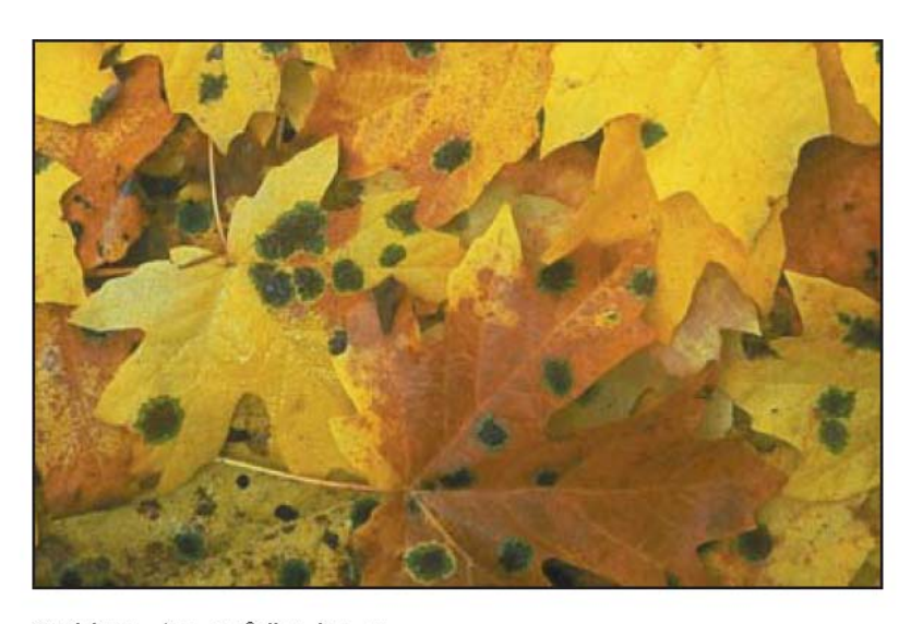
Mold growing on fallen leaves.

This document is available on the Environmental Protection Agency, Indoor Environments Division website at: www.epa.gov/iaq/molds/moldguide.html