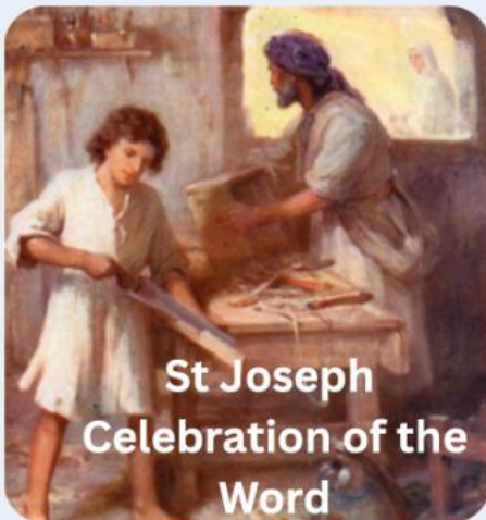
St Joseph Celebration of the Word