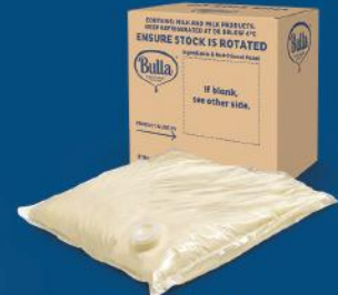
8143 Bulla Deli Style Sweetened Yoghurt 10kg