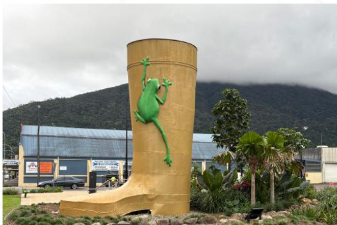
The iconic Golden Gumboot in Tully, with cloud-capped Mt Tyson standing proudly behind.

Tully Meals on Wheels™ recently marked a major milestone, 45 years of continuous service to the local community. Nestled in Far North Queensland, Tully is a tight-knit town of just over 2,000 residents, renowned for its record-breaking rainfall (immortalised by the Golden Gumboot monument) and its vital contribution to Queensland's agricultural economy.