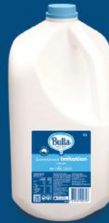
6020 Bulla Sweetened Imitation Cream 5L