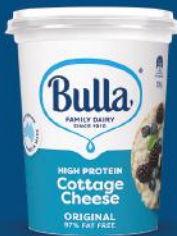
9013 Bulla Cottage Cheese Original 500g