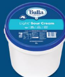
7003 Bulla Light ® Sour Cream 5L