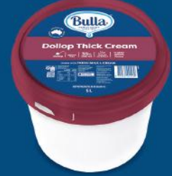
4045 Bulla Dollop Thick Cream 5L