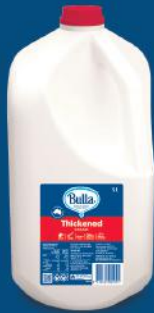
4015 Bulla Thickened Cream 5L