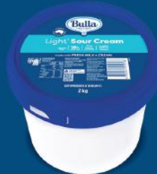
5000125 Bulla Light ® Sour Cream 2kg