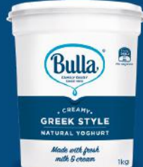
8320 Bulla Greek Style Natural Yoghurt 1kg