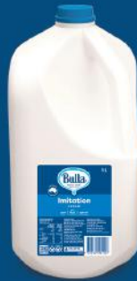
6010 Bulla Imitation Cream 5L