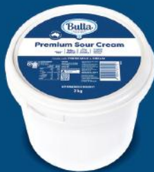
5000126 Bulla Premium Sour Cream 2kg