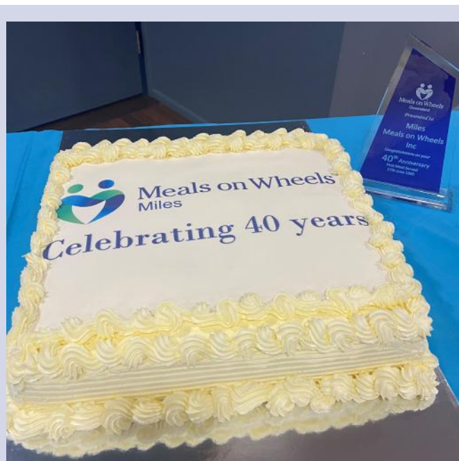
A golden milestone captured in cake and trophy, honouring four decades of care in Miles.

As Meals on Wheels™ Miles looks to the future, the 40th birthday celebration served as a powerful reminder of what can be achieved when a community comes together to care for its own. From a simple knock on the door to thousands of meals delivered with love, the journey of Miles Meals on Wheels™ is a story worth celebrating, and continuing.