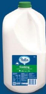
4014 Bulla Cooking Cream 5L