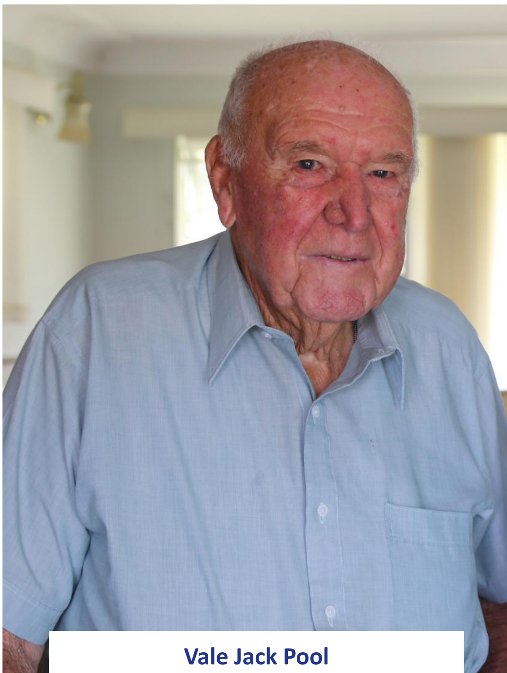
Vale Jack Pool