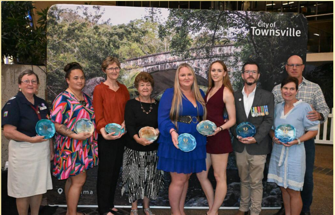
Heroes of the North! The 2025 Community Volunteering Impact Award winners shine bright, celebrating the everyday legends who go above and beyond for their communities.