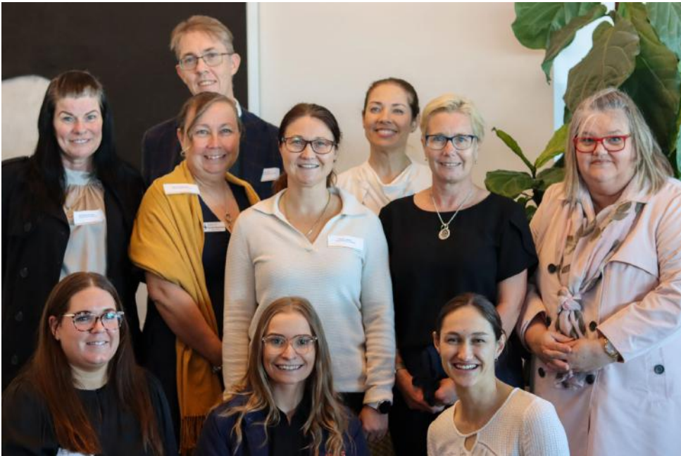
Meals on Wheels™ Queensland team at the QCOSS Budget Breakfast, advocating for vulnerable seniors and community-led solutions.

On Friday 4 July, Meals on Wheels™ Queensland proudly joined 350 community sector leaders at the QCOSS Queensland Budget Breakfast in Brisbane.