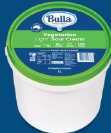
7016 Bulla Vegetarian Light ® Sour Cream 5L