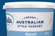
5000561 Bulla Australian Style Natural Yoghurt 100g