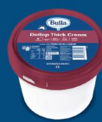
5000127 Bulla Dollop Thick Cream 2L