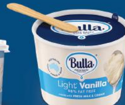
1111 Bulla light Vanilla Party Cup 100mL