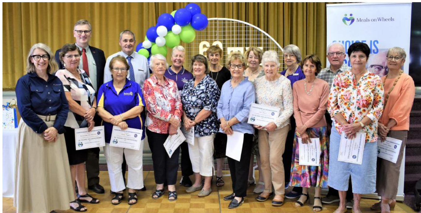
A remarkable group of long-serving volunteers recognised for their decades of dedication to Stanthorpe Meals on Wheels™

On Tuesday, 18 March, we had the privilege of attending the annual Stanthorpe Volunteers 'Thank You' Luncheon at the International Club. This year's gathering was even more special as it marked the 60th anniversary of Stanthorpe Meals on Wheels™, a tremendous achievement that speaks to the dedication and generosity of the local community.