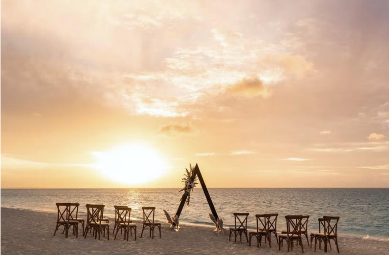
The Ritz-Carlton, Turks & Caicos

Experience your special day with Marriott Bonvoy, Caribbean - offering luxurious and memorable experiences for couples and their guests. With a large portfolio of idyllic venues, expert planning, and dining tailored to your taste, you'll watch as your dream day comes to life.