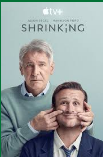
Shrinking is hilarious throughout

Apple TV has some fun stuff besides 'Ted Lasso'. Binged watched comedy-drama 'Shrinking'. All 22 episodes in two days. Three therapists, including Harrison Ford, share a practice. Some contrived plots but the script is so sharp and clever, I was envious of the writer. It's absolutely well worth a watch. Genuine LOL material.