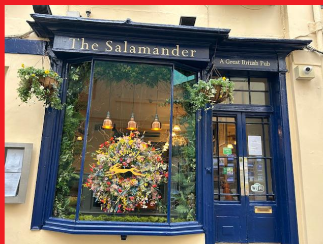
This pub is extremely popular