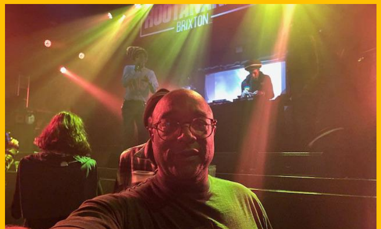
The Marley night was banging