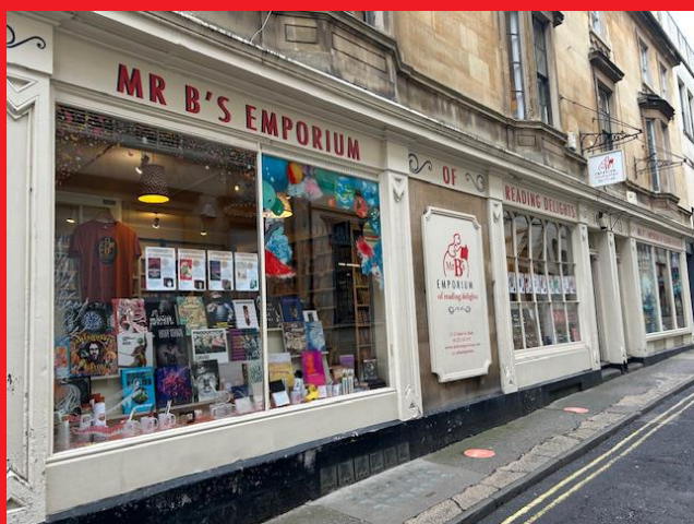
Many unique shops in Bath