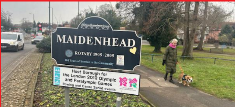
This dog lady was very friendly

Having a Freedom Pass means travelling all over for little or no outlay. So off I went to Maidenhead to disturb the locals. Stunning riverside views. A friendly lady walking her dog insisted I should come back in the summer when hot and sunny. Unlikely. Probably teeming with tourists!