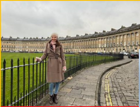
Queen Jojo in Royal Crescent