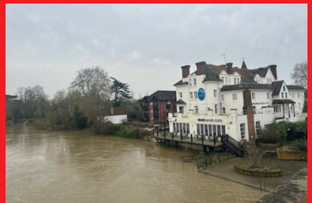
Riverside in Maidenhead