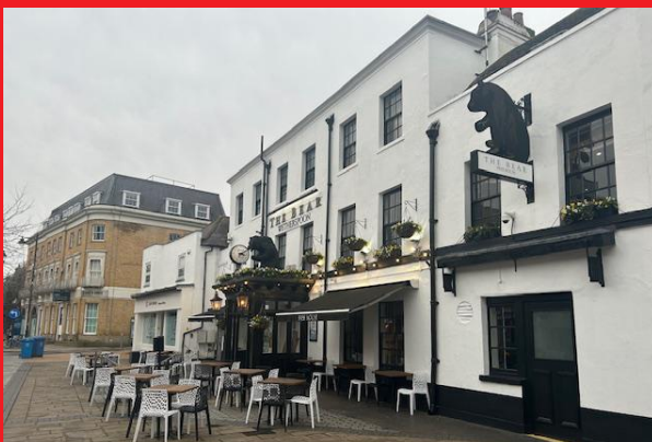
Maidenhead has some great pubs

Having a Freedom Pass means travelling all over for little or no outlay. So off I went to Maidenhead to disturb the locals. Stunning riverside views. A friendly lady walking her dog insisted I should come back in the summer when hot and sunny. Unlikely. Probably teeming with tourists!