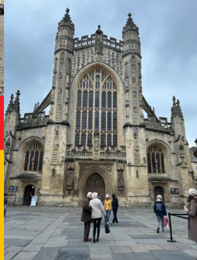
Bath Abbey is impressive