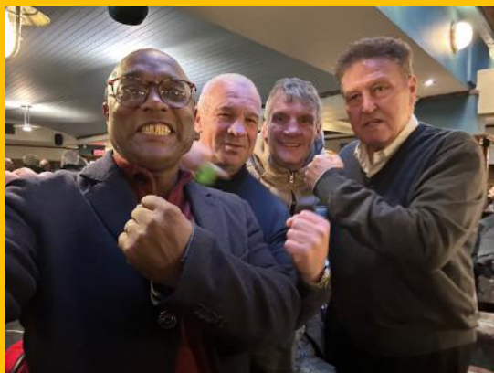
Don't mess with the Hogarth champs!