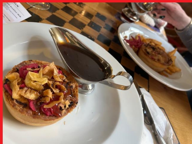
The Raven grub was okay but service slow