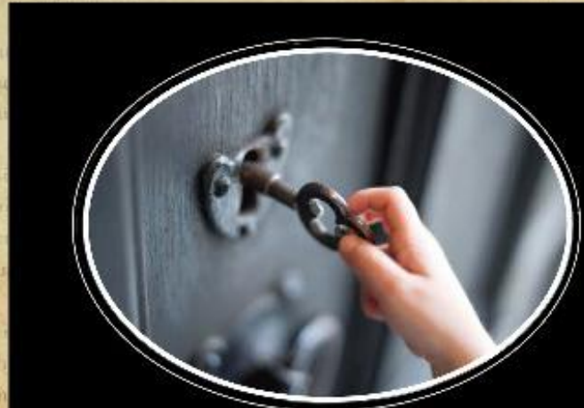
Maritime Prayer Ministries