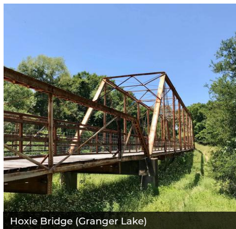
Hoxie Bridge (Granger Lake)