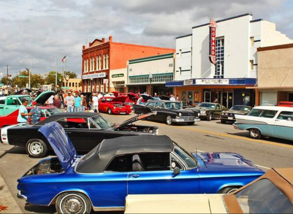
Main Street Car Show