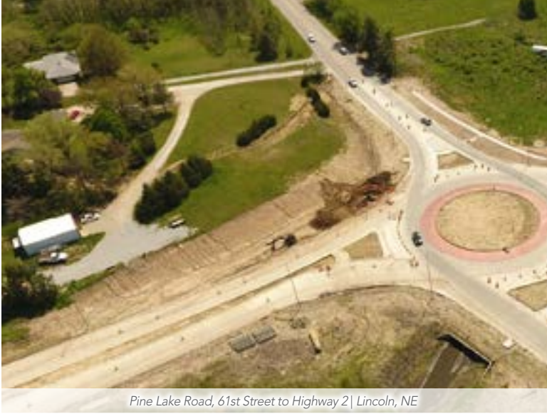
Pine Lake Road, 61st Street to Highway 2 | Lincoln, NE