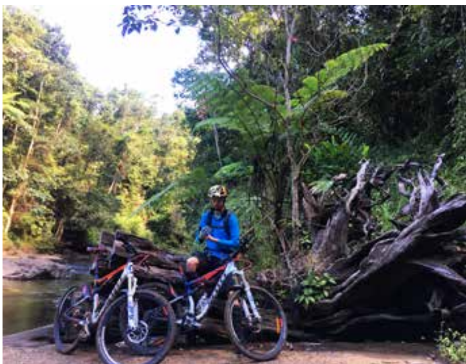
Clockwise from top: A rainforest creek in Wooroonooran National Park; ferns; a rest stop on the Gorrell Track; the North Johnston River two years after Cyclone Larry; the Mamu Tropical Skywalk.