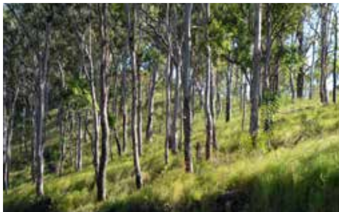
An example of the incredible vistas to be enjoyed at Binna Burra (top) and (left) eucalyptus forest with grassy understorey.

We had an introductory stroll around and spent some time steeping ourselves in the views from the high ground across the gorge to the mountains beyond. Lunch at a table