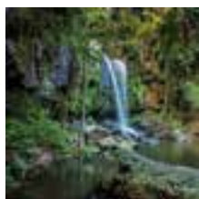
Curtis Falls in the Joalah section of Tamborine National Park in the Gold Coast Hinterland.