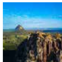
Hikers atop Mt Ngungun in Glass House Mountains National Park on the Sunshine Coast.