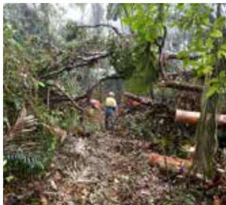
Rangers faced a massive task to reopen walking tracks after Cyclone Debbie, such as the Pine Grove Circuit at Eungella National Park (above), and (top) work to restore sand to Whitehaven Beach after it was eroded.

Here at NPAQ we believe that people know that they are connected to nature – that no amount of concrete, steel and air conditioning can cause complete and utter severance of the interconnectedness of the human and natural worlds. It's just that sometimes people need to be reminded.