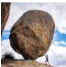
Balancing Rock on top of The Pyramid in Girraween National Park on the Granite Belt.