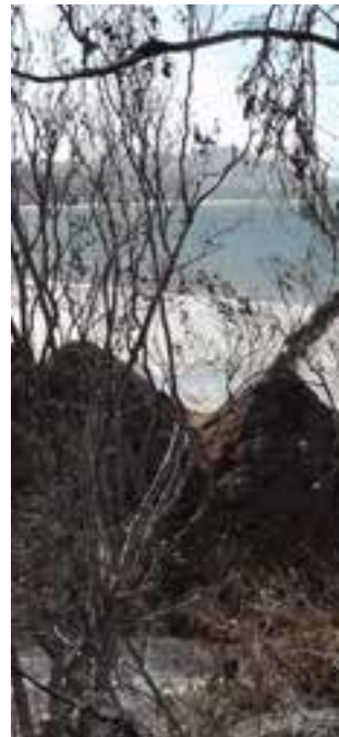
Clockwise from top: Whitsunday Island National Park after Cyclone Debbie; mulching of fallen vegetation on Whitehaven Beach; debris post-flooding at Purling Brook Falls in Springbrook National Park.