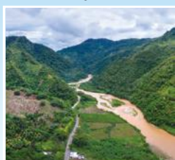
BRAZILLIAN AMAZON ADVENTURE APR 25 – MAY 10 2026 MAY 30 – JUN 14 2026