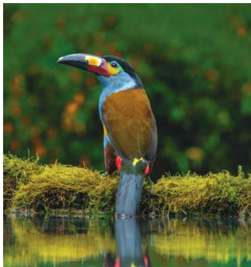
Magangué, Colombia.

Spend the day near Magangué, surrounded by nature, as you enjoy a birdwatching tour featuring species found only in this part of Colombia.