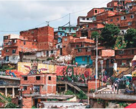
Comuna 13, Medellín.

Discover Medellín's remarkable urban transformation at Comuna 13. Stroll through the celebrated graffiti art district, savour a refreshing mango popsicle, and experience the innovative outdoor escalators that have revitalized this neighbourhood. A local guide will explain the significance of the art and the community's inspiring story. Enjoy lunch at a local restaurant. Later, visit a coffee farm within the city limits to learn about the bean-to-brew process behind Colombia's world-renowned coffee. Dinner at local restaurant featuring lively ambiance, live music, and fine cuisine.