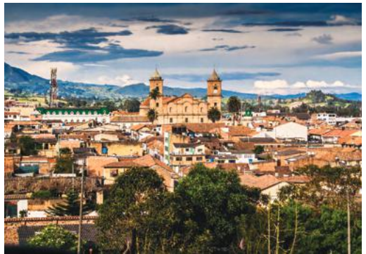
Zipaquirá, Bogotá.

Following breakfast, visit the spectacular Salt Cathedral of Zipaquirá, an engineering marvel constructed by miners deep within a salt mine. This awe-inspiring place of worship was built in honour of the Virgin of the Rosary of Guasá, protector of miners. Afterwards, enjoy lunch in Zipaquirá before continuing to the Guatavita Lagoon. This sacred place for indigenous people is home to the mythic El Dorado legend, where the chief swam in waters full of gold and precious stones.