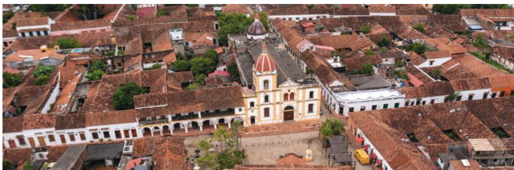
Mompox