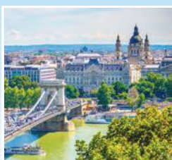
GOLF CRUISE ON DANUBE MAY 16 – 26, 2026