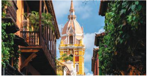
Cartagena, Colombia.

Accommodation: onboard AMA Melodia or similar (7 nights)