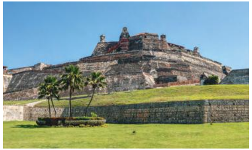
San Felipe Castle, Cartagena.

Visit the impressive San Felipe Castle, the "Old Shoes" monument, and the serene La Popa Monastery. After a short walk, enjoy your lunch. Spend the afternoon exploring the vibrant neighbourhood of Getsemaní and Trinidad Square, a key site in Colombia's independence movement. Enjoy a rum and chocolate tasting experience led by an expert, showcasing the harmonious pairing of these Colombian specialties.