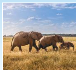
KENYA & TANZANIA OCT 23 – NOV 5, 2026