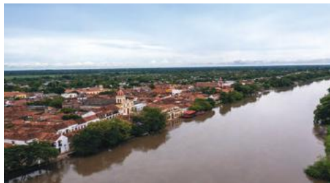
Magdalena River.

Say goodbye to Mompox and cruise through the stunning La Mojana region of the Magdalena River. Discover the rich history of cumbia, a global music and dance born from African roots and enriched by American and European influences. End the day with a special cumbia performance by local artists.