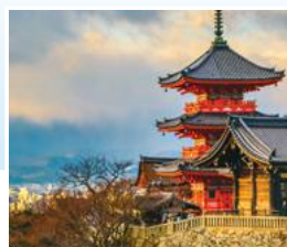
SOUTH KOREA AND JAPAN MAY 11 – 29, 2026