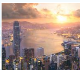
HONG KONG WINE AND DINE OCT 20 – 26, 2025