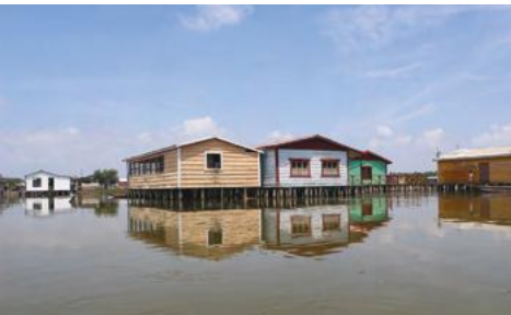
Nueva Venecia.

Later, continue to the seaside city of Barranquilla, a lively cultural centre known for its musicians, writers, and artists. Visit notable landmarks such as the Bocas de Cenizas, where the Magdalena River meets the Caribbean Sea, and the Carnaval Museum, showcasing the region's rich festive traditions. In the evening, enjoy an exclusive private Carnaval celebration created especially for AmaWaterways guests.