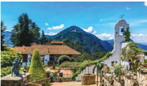
Mount Monserrate, Bogota.