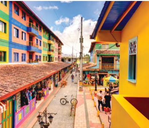
Guatapé, Medellín.

Today, we journey to the colourful town of Guatapé, located approximately two hours from Medellín. Marvel at the breathtaking landscapes before climbing El Peñol Rock, a striking 220-metre-high monolith with 740 steps to the top. Enjoy panoramic views as your reward. Following the climb, unwind with a short boat trip on the reservoir.