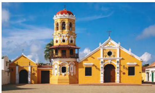
Santa Bárbara Church

Spend the morning in Santa Bárbara de Pinto, situated along the banks of the Mompox arm of the Magdalena River. Stroll through this traditional town, visit the Santa Bárbara Church, and admire the region's fine hand-crafted goods.