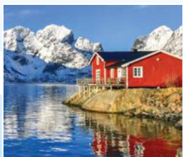
NORWAY AND LAPLAND MAY 8 – 23, 2026