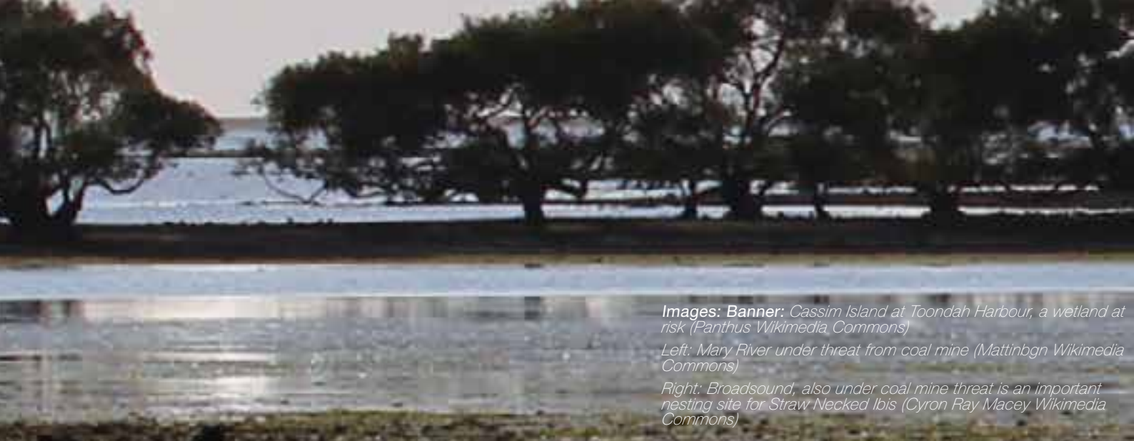
Images: Banner: Cassim Island at Toondah Harbour, a wetland at risk