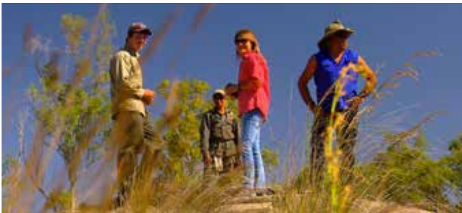
The Talaroo Nature Refuge is managed by Ewamian Traditional Owners. They are excited by the opportunities presented by the Nature Refuges program however are experiencing the under-investment first hand.