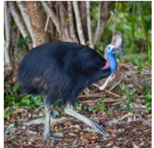
National parks provide a habitat to cassowaries, a threatened yet extremely significant bird for the health of Queensland's rainforests.

In 2017, Galaxy Research found that support for Queensland's national parks remains very strong with 84% of respondents indicating