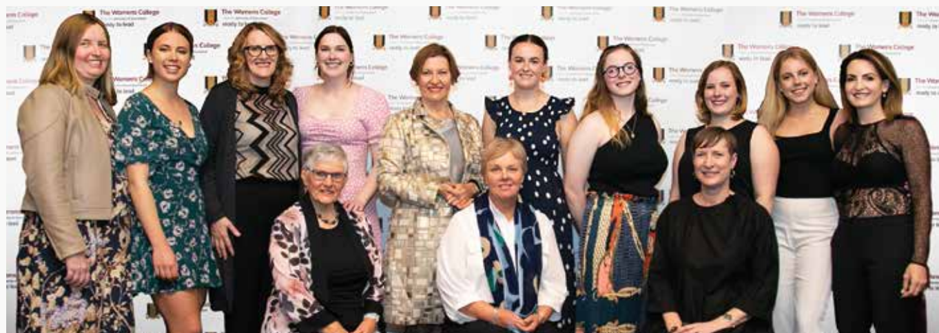
Above: Multi-generational families were presented with special badges at the inaugural Mother & Daughter Dinner.

In conjunction with The University of Queensland Scholarship Match Program, and the generosity of UQ Alumni Friends, the College is establishing scholarships to honour two beloved women of our Women's community who passed away in 2020. The Dr Maureen Aitken Undergraduate Scholarship was launched in April and the Dorothy Marsden Undergraduate Scholarship will be officially launched at our upcoming