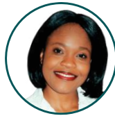
SEBONGILE KOLOBE TV JOURNALIST