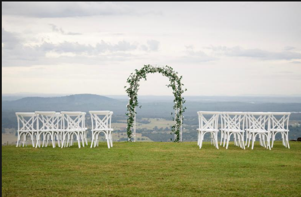
Our White Arbour facing towards Brisbane and the Sunrise

Whether you dream of saying your vows bathed in morning sunshine or wrapped in the glow of the afternoon, our endless views promise a breathtaking backdrop -and if the weather has other ideas, our beautiful indoor Barn ensures your ceremony remains equally magical. Here are our three most popular ceremony locations: