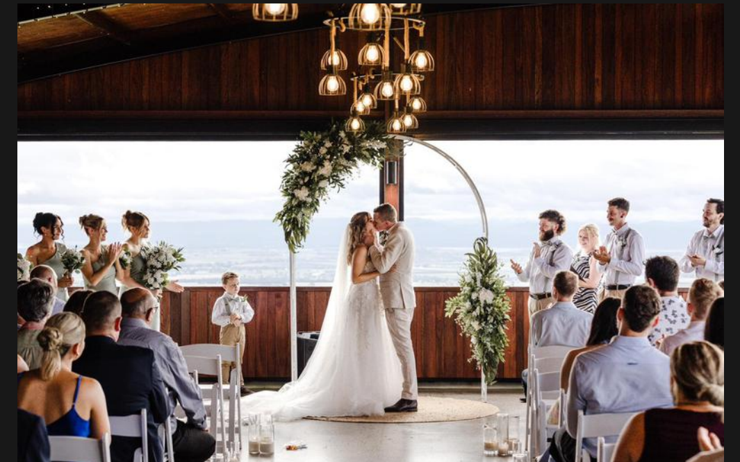
Our Barn provides a stunning, quick setup, alternate weather option