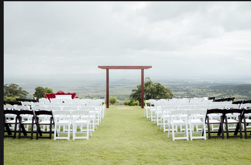
Our Brown Arbour facing towards Toowoomba and the Sunset