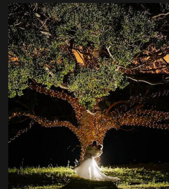
2 x Fairy Light Trees