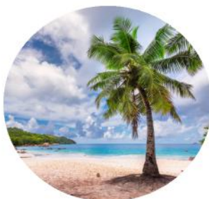
Songs of Summer