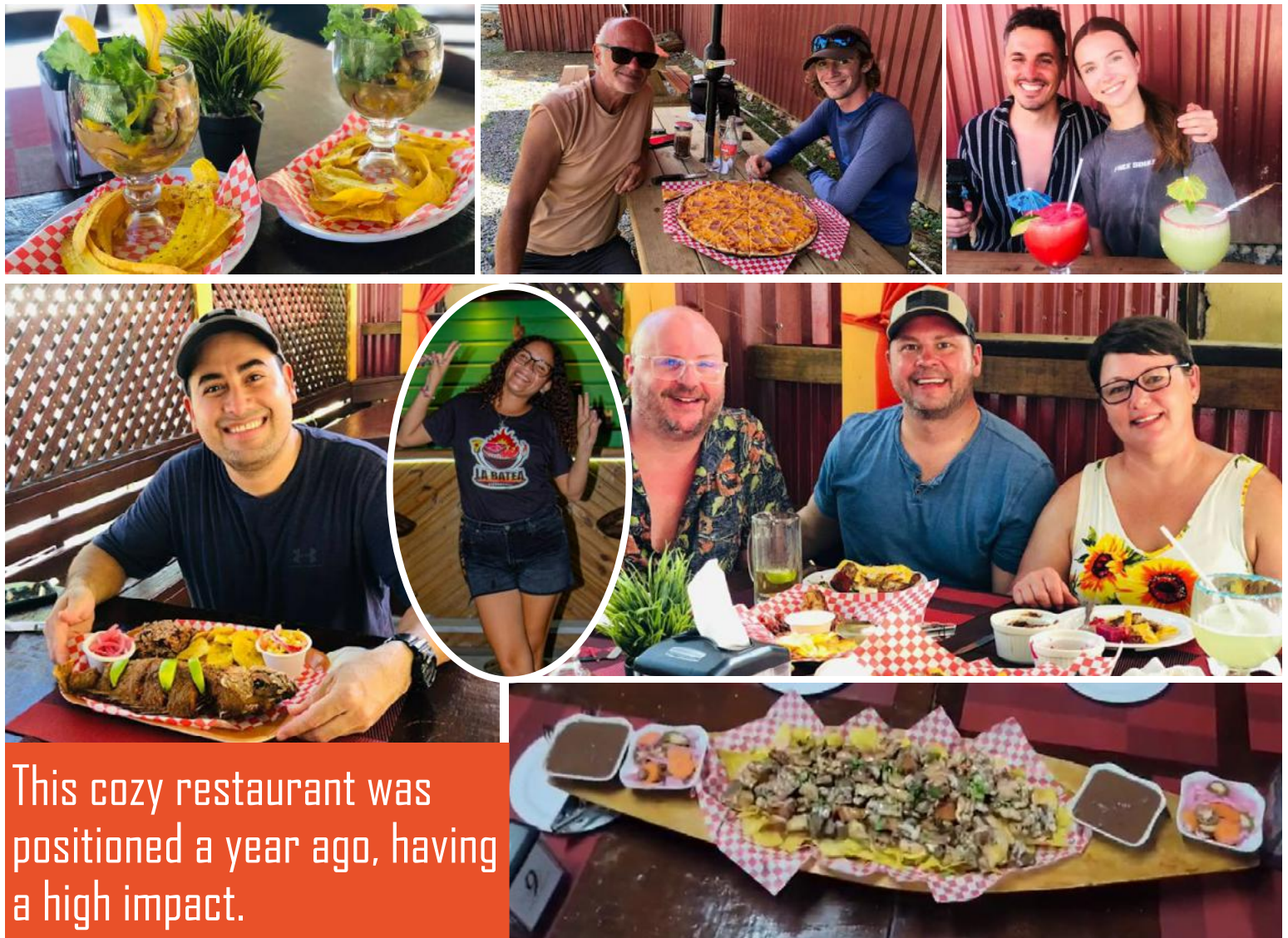
This cozy restaurant was positioned a year ago, having a high impact.

re, since their vision and mission is to give you the best service and new experiences, thus contributing to the tourism development of The Island of Roatán, since thanks to them has been its growth in gratitude, they always give everything for everything in their constant fight. Likewise, the restaurant has a branch in Coxen Hole, with the vision of expanding to strategic locations within the island to bring Caribbean flavor to every corner of Roatán. "The name of the batea is the typical name of the tray made of wood in the shape of a boat where the largest and most exquisite family dishes are served to your preference, whether seafood or grilled meats, all fresh and of high quality. ". One of the partners highlighted If you were delighted with this place, you can make your reservation outdoors and indoors. Making your reservations is so easy that with a simple call you can reserve the day and menu of your preference, where you will find different promotions. Contacting +504 8848-918.