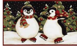
2'7" x 3'10"

The first 20 clients who visit my store by Wednesday, September 30 th and buy flooring will receive a Free holiday area rug, 2'7" x 3'10" , you choose the style! These are great for foyers and entryways and anywhere you want to shed some holiday cheer. There are 23 designs to choose from! So, the first 20 clients who buy flooring by September 30 th will be able to order their FREE rug in time for the holidays! We'll order your new area rug even if your flooring is not installed until after Christmas.