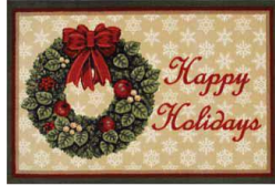
2'7" x 3'10"