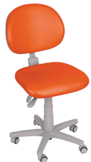
Zero Backache Stool for Doctor Comfort