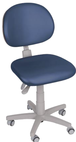
Zero Backache Stool for Doctor Comfort