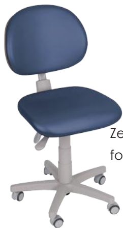
Zero Backache Stool for Doctor Comfort