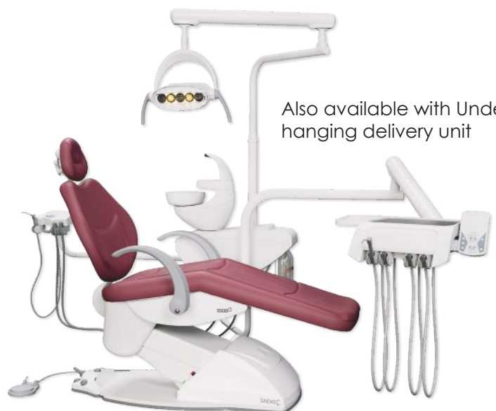
Also available with Under hanging delivery unit