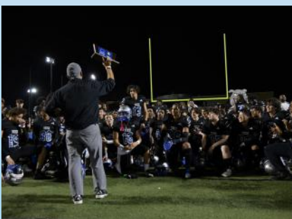
A very special shoutout to the Bulldogs football team named North Group 5 - Football State Champions. It was a historic season of grit and determination!