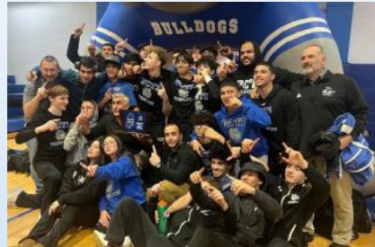
The Bulldog wrestling team are North 1 Group 5 wrestling State Sectional Champions! The team has been ranked as the highest public school in North Jersey and is ranked overall in North Jersey!