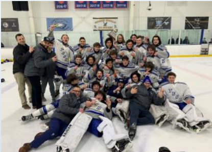
The powerful and unstoppable ice hockey team have claimed their first ever title as county champions a huge accomplishment for the only 4-year-old program!