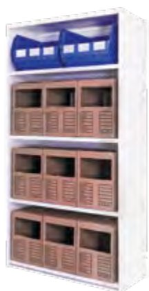
Delta Plus Distribution Centre