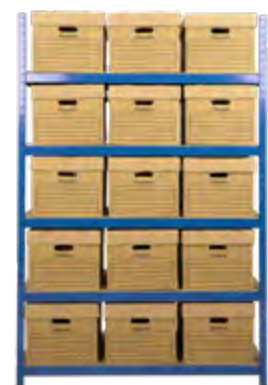
Clicka 265 with Archive Boxes