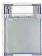
RTB2 108 x 90 x 141 Rhino Tilt Bin