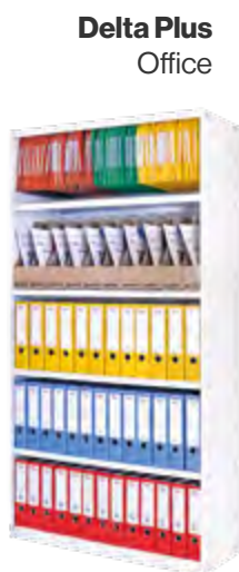
Delta Plus Office