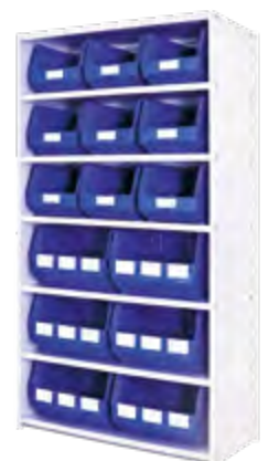
Delta Plus With Shelf bins