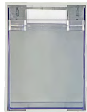
RTB4 215 x 167 x 283 Rhino Tilt Bin