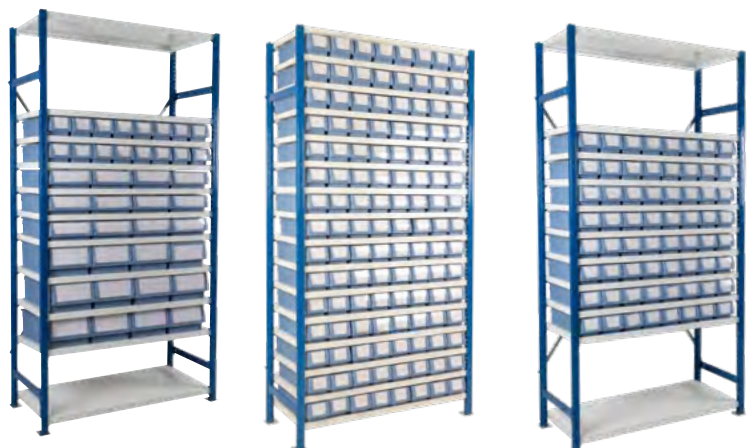
EXPO 4 Kits With Shelf Trays