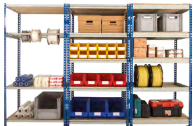
J Rivet Shelf Bins, Archive Boxes and Cable Reel Rack