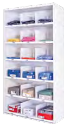
Delta Plus E-Commerce