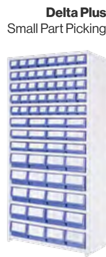
Delta Plus Small Part Picking