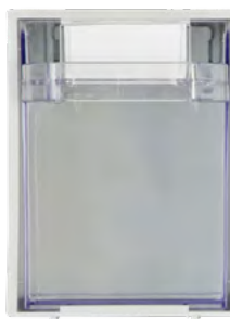
RTB3 144 x 121 x 193 Rhino Tilt Bin