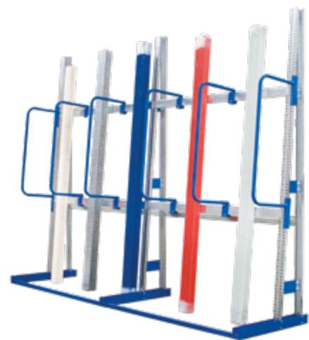
Vertical Racking Double Sided