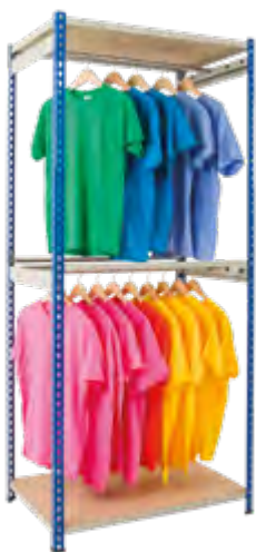
J Rivet Garment Rail