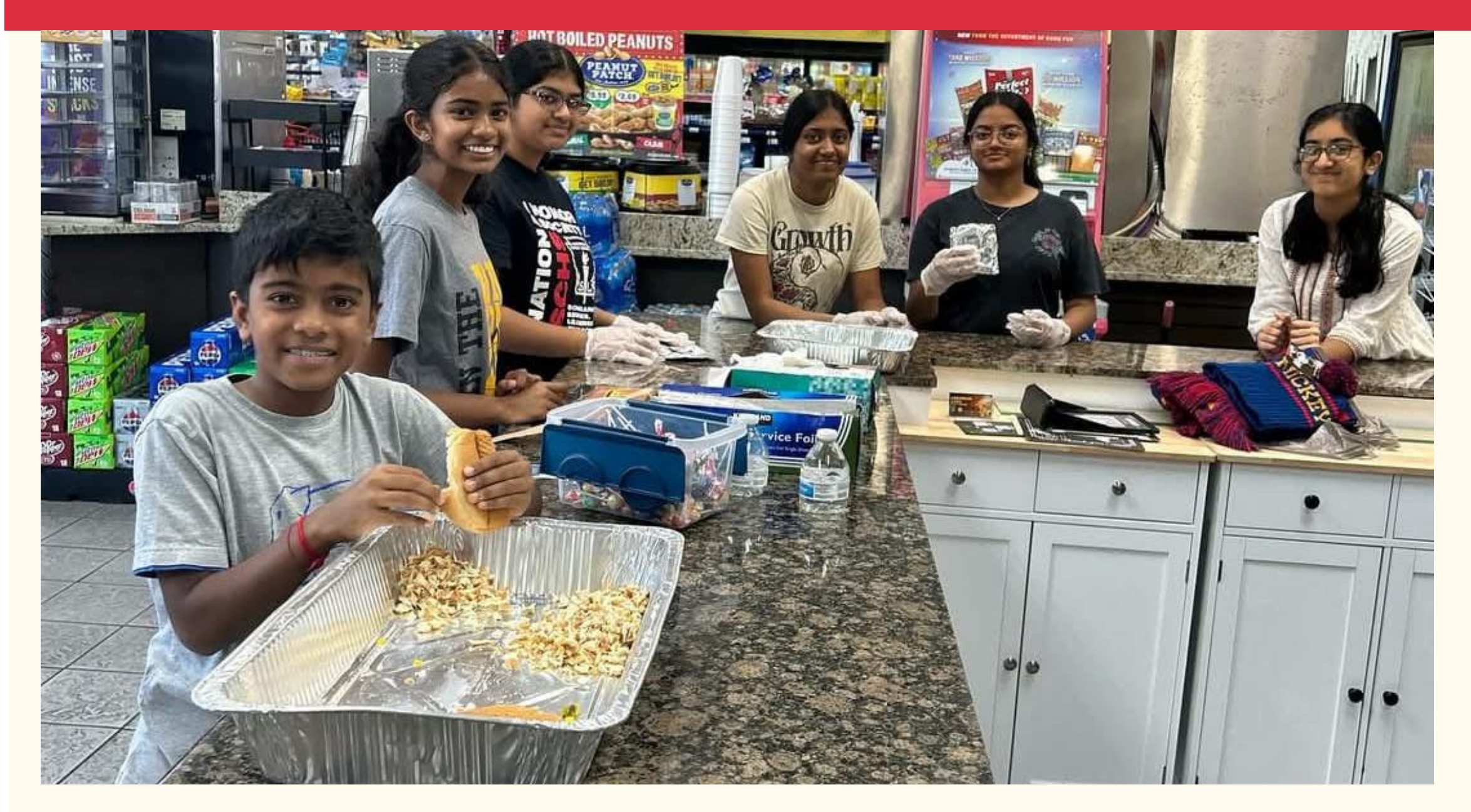
Volunteers distributed food and essentials in downtown, Tampa, FL

On January 2, Sewa Tampa distributed over 125 sandwiches, 50 care packages, goody bags, and several blankets to those in need in downtown Tampa. The Winter Warmth Drive exceeded expectations, spreading joy and comfort throughout the community. Sewa Tampa volunteers played a crucial role in packaging and distributing items, brightening the holiday season for many.