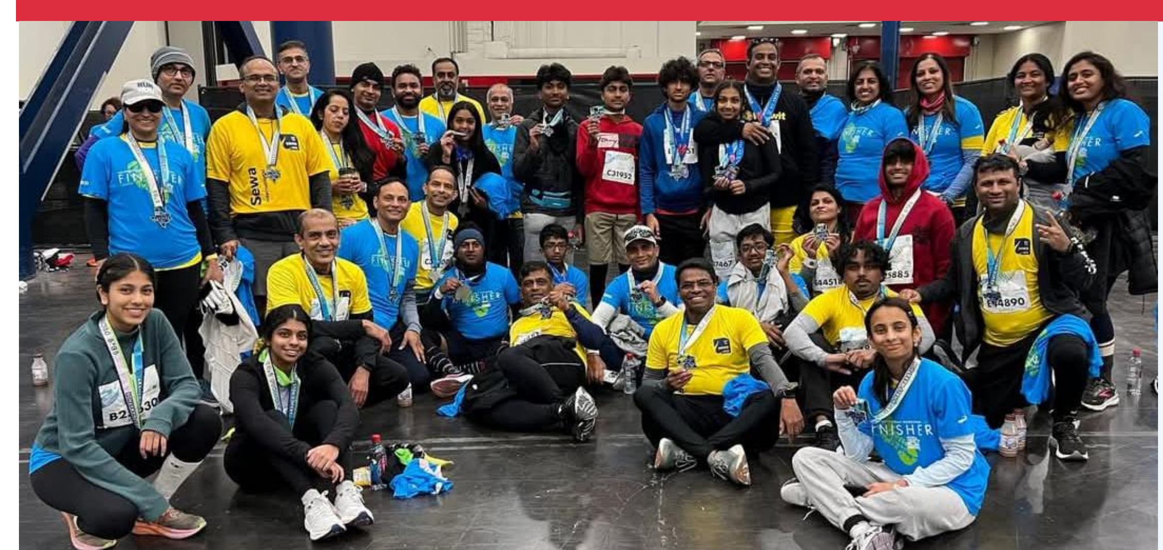
Sewa volunteers and runners brave the cold at the Chevron Houston Marathon

Despite freezing temperatures, over 100 Sewa volunteers and 140 runners participated in the Chevron Houston Marathon on January 19. Volunteers gathered at the Mile 8 Refueling Station, serving over 27,000 runners with water and Gatorade and cleaning up.