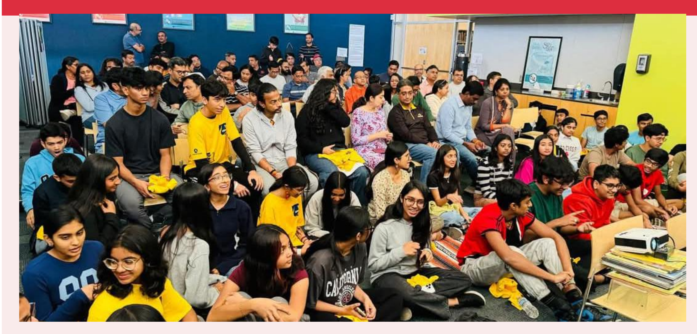
LEAD Youth and their parents participated at LEAD 2025 in Phoenix, AZ

The Sewa Phoenix chapter recently had the kickoff meeting for its LEAD 2025 program, which empowers youth through community service and leadership development. This year's program attracted eighty young participants, all committed to engaging in community service throughout the year.