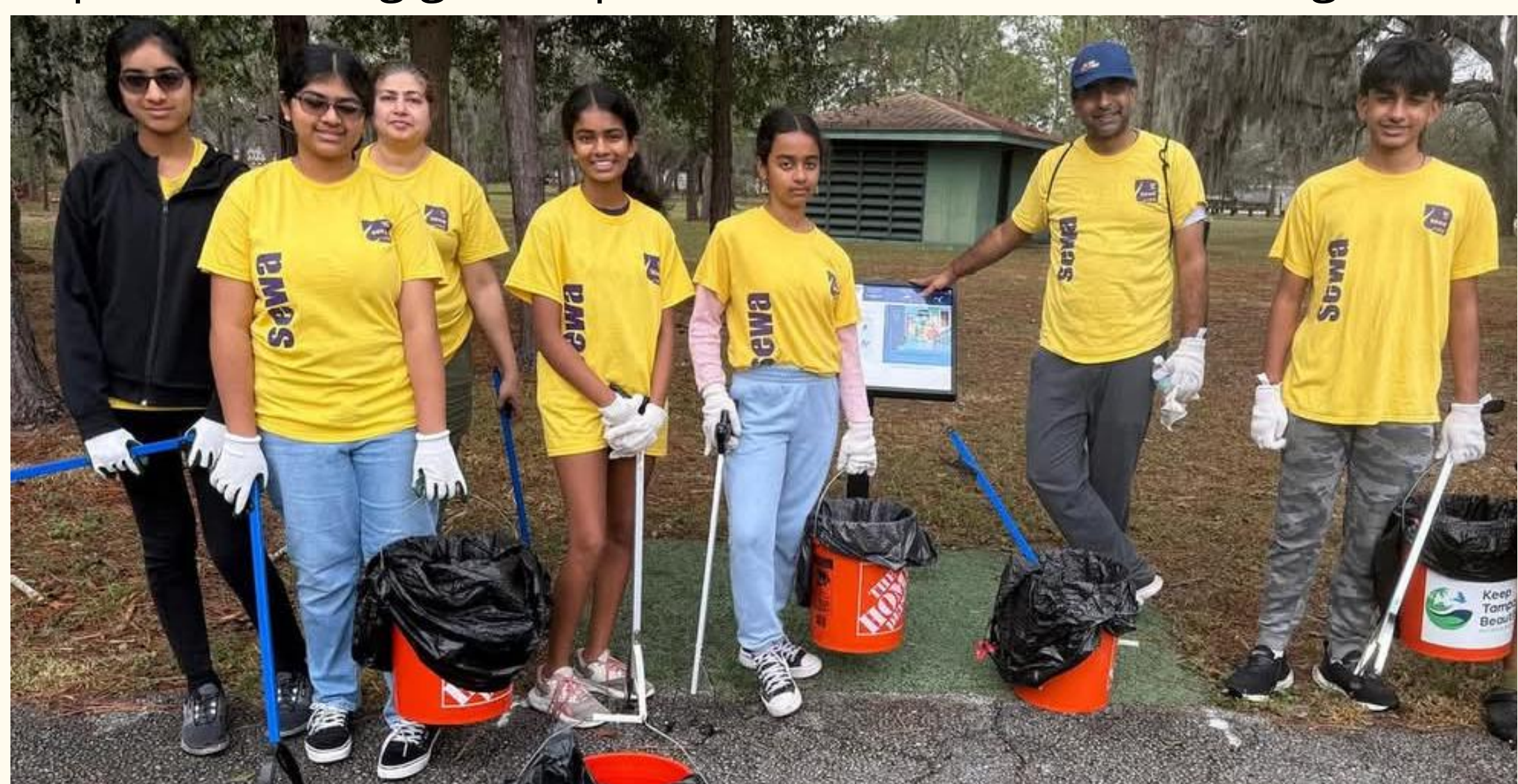
Tampa volunteers joined "Keep Tampa Bay Beautiful" team for the Rowlett Park cleanup

On the same day, in another event, the Sewa Tampa chapter volunteers joined Keep Tampa Bay Beautiful volunteers for the Rowlett Park cleanup. This initiative was part of a broader effort to preserve the pristine condition of parks across the Tampa Bay area. The volunteers' dedication exemplifies the true spirit of community and environmental care. Together, Sewa Tampa and Keep Tampa Bay Beautiful are making a meaningful impact, ensuring green spaces remain clean and inviting.