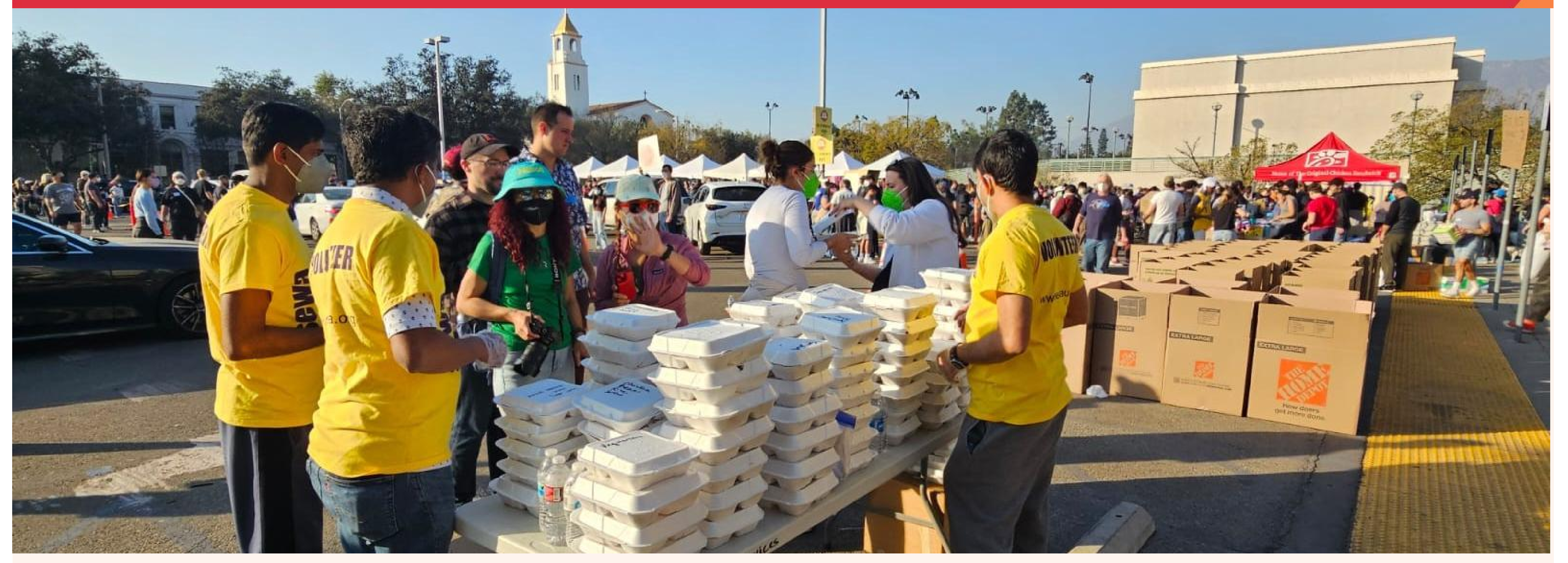
Sewa volunteers delivered essential aid to communities affected by the devastating Los Angeles wildfires

Sewa International has launched a fundraiser and deployed volunteers to deliver essential aid to communities affected by the devastating wildfires sweeping the Los Angeles area. The wildfires, which began on January 7, have claimed at least 28 lives and destroyed over 14,000 structures. Twenty-two individuals are missing.