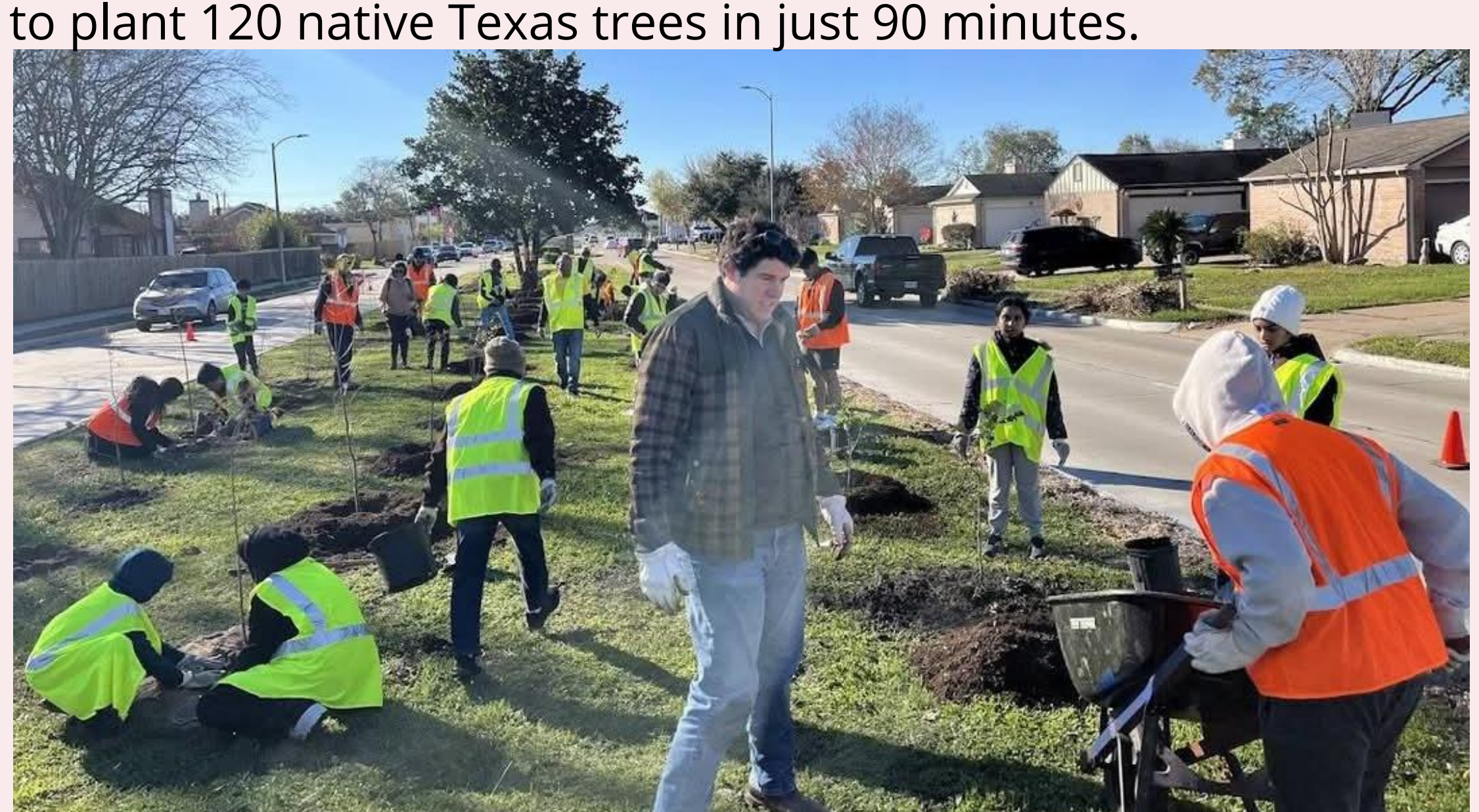
Houston Sewa volunteers planted trees in Alief neighbourhood as part of Sewa's environment and sustainability initiative

Despite chilly weather, 85 volunteers of all ages came together