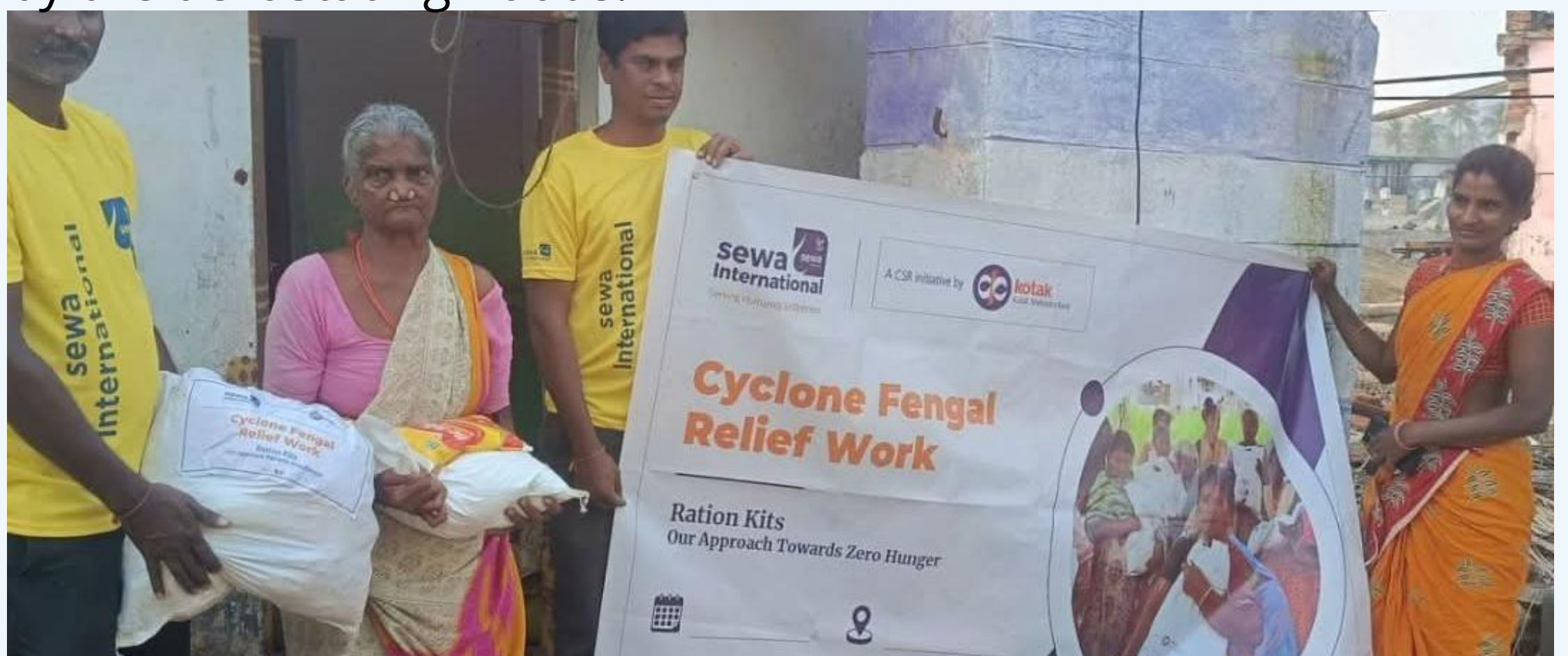
Sewa distributed ration kits to families affected by Cyclone Fengal in Chennai, Tamil Nadu, in collaboration with Kotak Bank Ltd.

In collaboration with Kotak Bank Ltd. under their CSR (Corporate Social Responsibility) initiative, Sewa distributed ration kits to families affected by Cyclone Fengal in Chennai, Tamil Nadu on January 10. The kits, carefully prepared with essential items, provided relief and support to those impacted by the devastating floods.