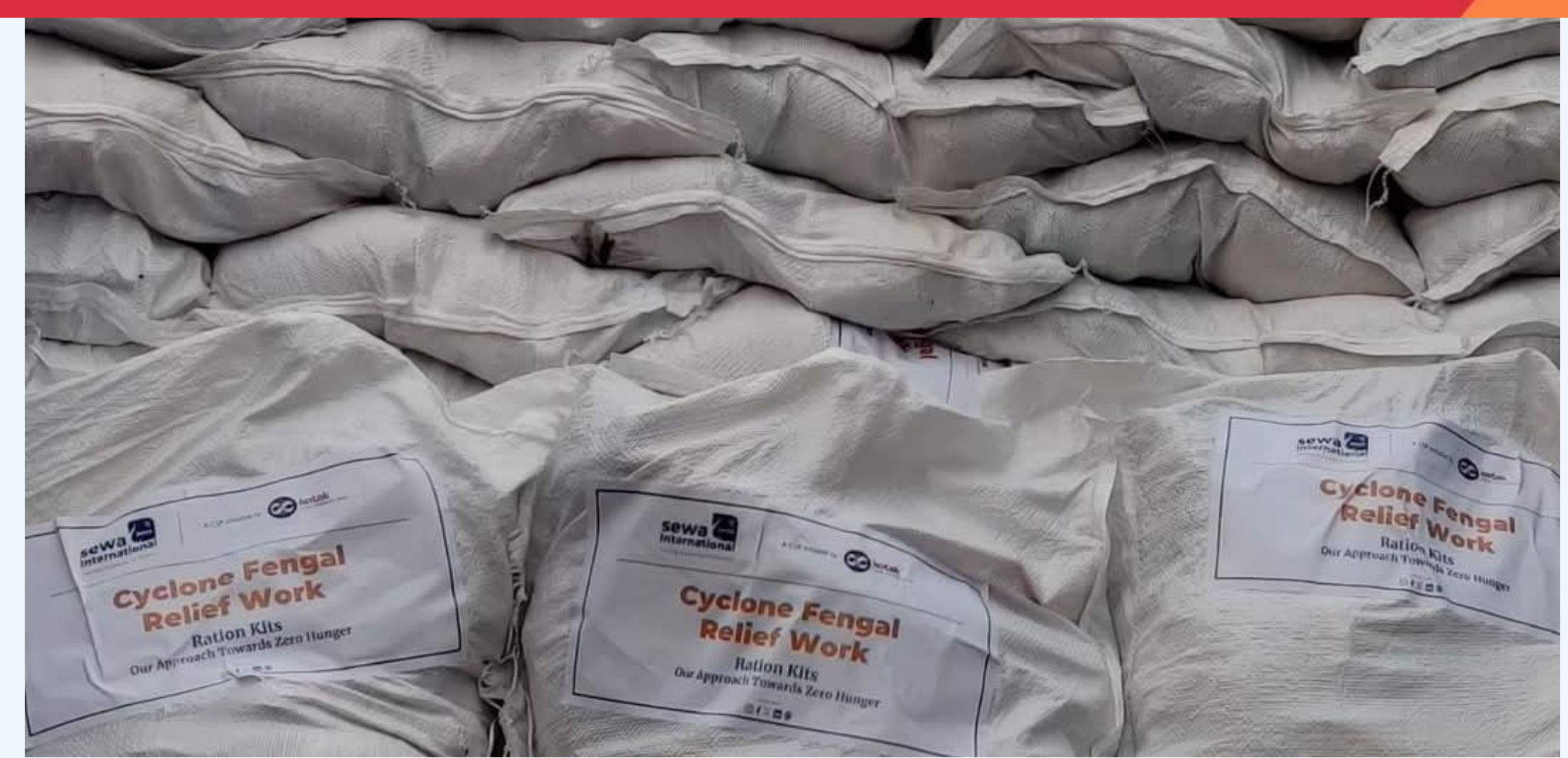
Ration kits ready for distribution to the families affected by Cyclone Fengal in Chennai, Tamil Nadu

Each ration kit contained a selection of items, including food staples, spices, cooking essentials, and daily necessities. Sewa distributed these kits to help cyclone victims recover and rebuild their lives.