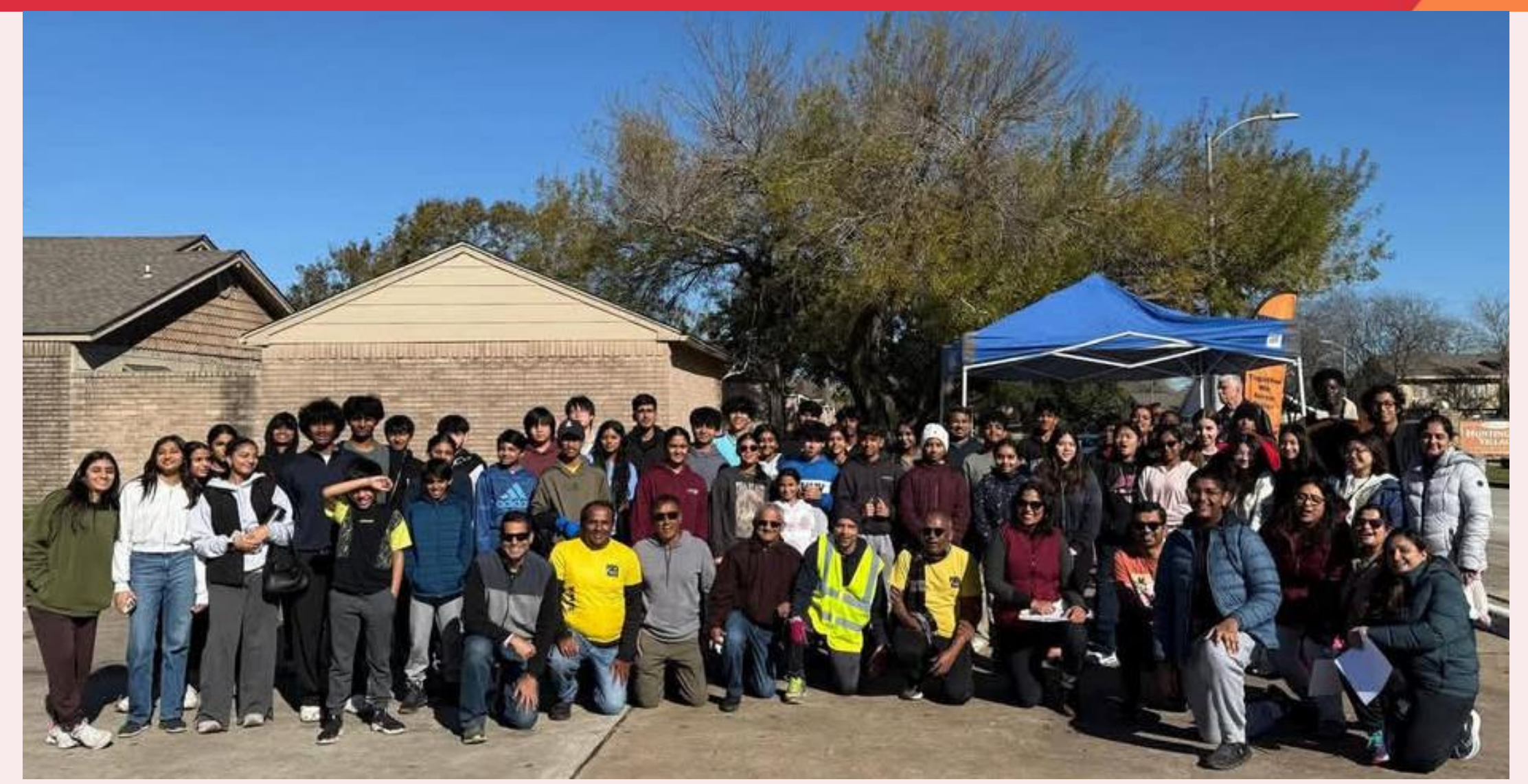
Volunteers of all ages joined hands to plant trees in Houston's Alief neighborhood drive

The Alief neighborhood, which experiences temperatures 10 degrees hotter than the rest of Houston, will greatly benefit from this initiative.