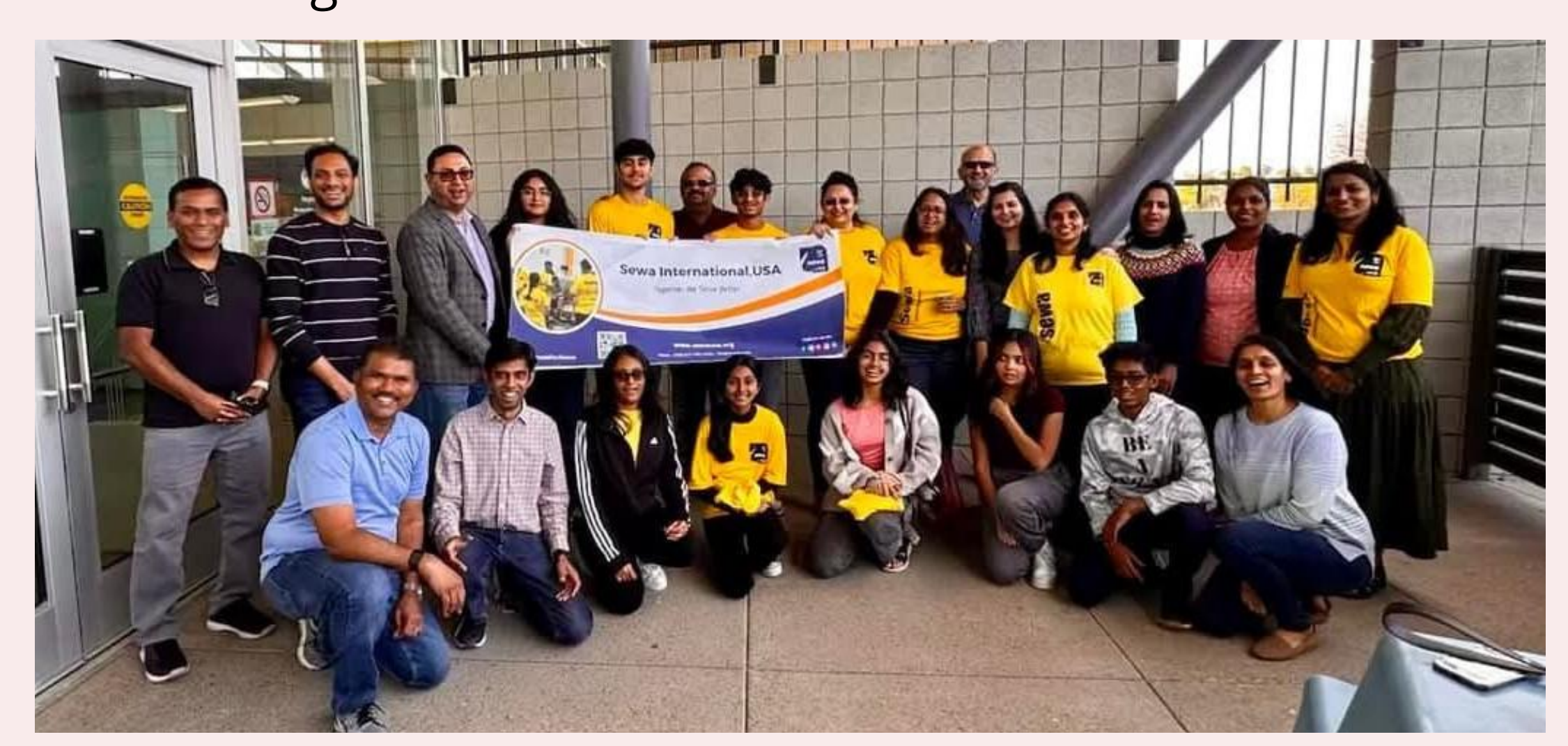
LEAD volunteers and mentors launched a year of service in Phoenix, AZ

Youths, parents, and mentors gathered to discuss ideas and share experiences during the kickoff meeting. The event also featured a certificate distribution ceremony, recognizing the achievements of participants who completed their volunteering service for 2024.