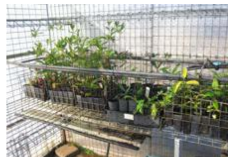
Above: (L of R): Volunteers involved in revegetation work on Tamborine National Park; Richmond birdwing butterfly in the Pirralilla section; propagation nursery plants.