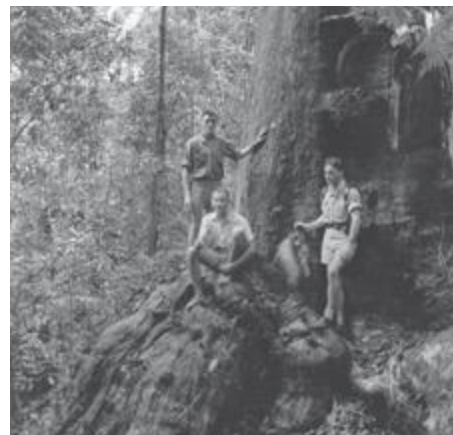
Above: Lamington National Park. Banner: Early NPAQ trip to Hinchinbrook Island.