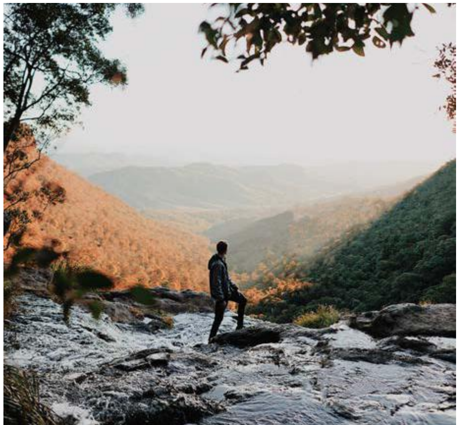
Above: Lamington National Park. Banner: NPAQ Ecotourism Seminar, October 2019.

It's been fantastic to see Traditional Owners on country offering knowledge and skills to help with the parks' protection. Through the collaborative approach we have established, we are all gaining a far better understanding of Traditional Owners' special cultural places and the strong linkages there are between cultural heritage and biodiversity.