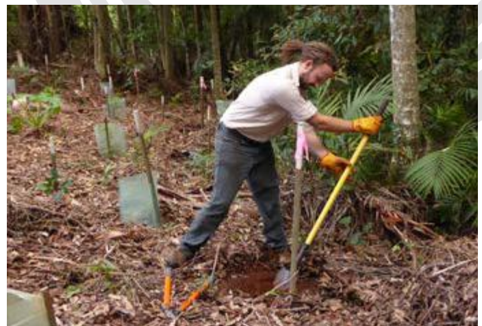
Above: Volunteers involved in revegetation work on Tamborine National Park. Banner: Some of the many volunteers of the Friends of Tamborine National Park.