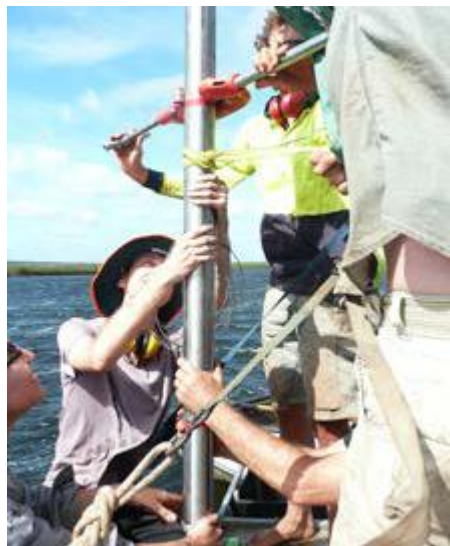
Above: Collecting sediment cores.

term monsoonal climate transitions. However, careful management is required to maintain stability, to conserve wetlands and heathlands into the future and to protect these environments from threats caused directly and indirectly by humans. These threats include land clearance, changing fire regimes, invasive plants and climate change (Keith et al. 2014, p.298-304).