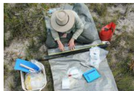
Above: Sampling a sediment core on site. Banner: Dwarf heathland vegetation surrounding Sanamere Lagoon.

The dwarf heathland vegetation around the lagoon today became more dominant around eight thousand years ago. Before this period, sedges were the main vegetation type around the site. Sanamere Lagoon itself likely expanded and deepened at this time, with less sediment reaching the middle of the lake. This occurred at